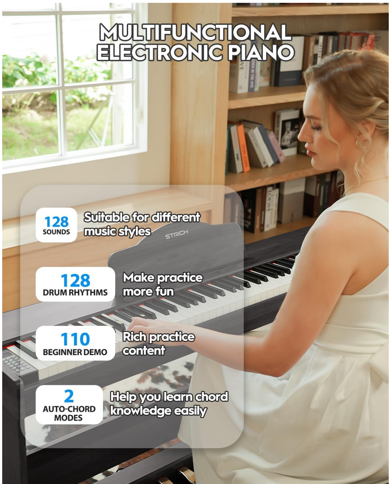
Figure 4: The digital piano offers a wide range of sounds and rhythms for musical exploration.