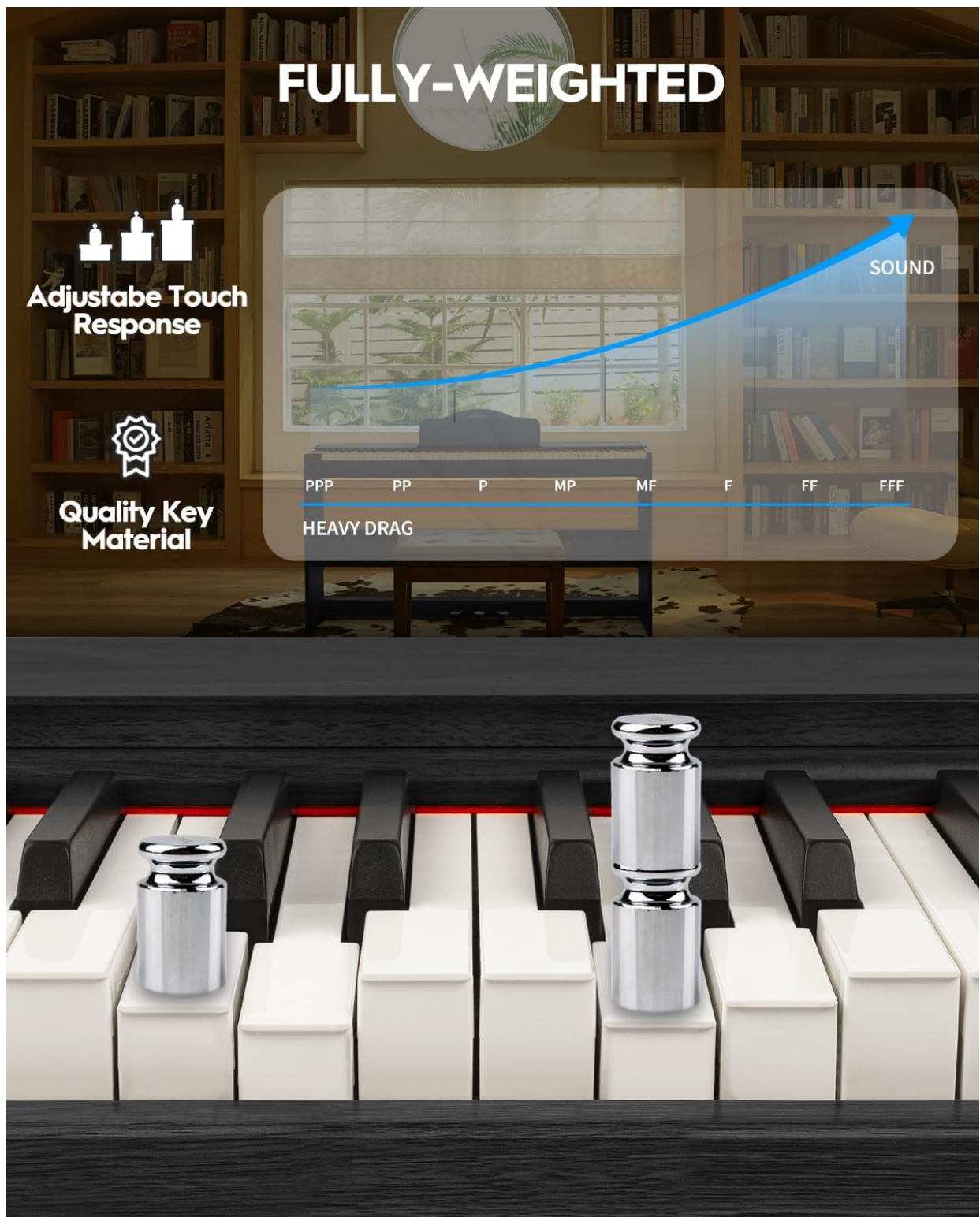
Figure 2: Detail of the fully-weighted, hammer-action keys with adjustable touch response.