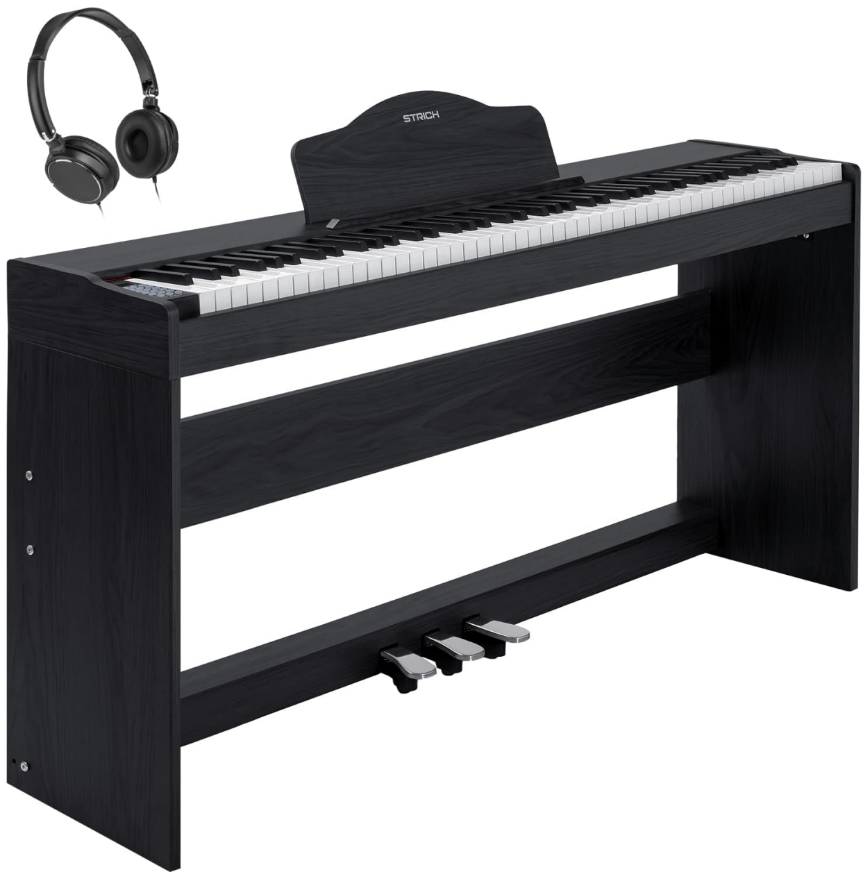
Figure 1: STRICH SDP-300W Digital Piano in Black with included headphones and music stand.