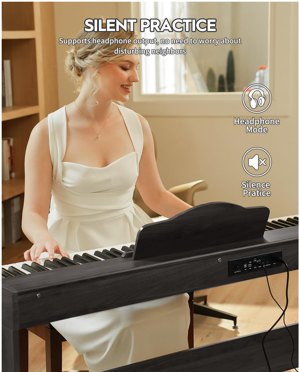
Figure 6: Enjoy private practice sessions using headphones.