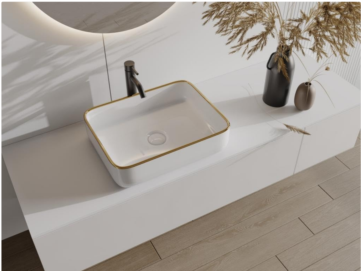
Figure 3: The JUNIKO II washbasin integrated into a modern bathroom environment.