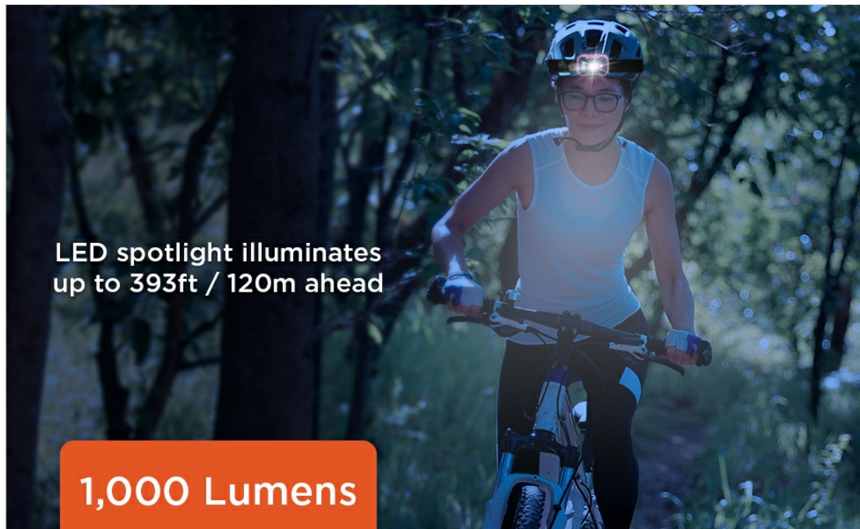
Image: The BLACK+DECKER 1,000 Lumens LED+COB Headlamp, highlighting its wave sensor, rechargeable battery, adjustable angle, and weather resistance.

LED spotlight illuminates up to 393ft / 120m ahead