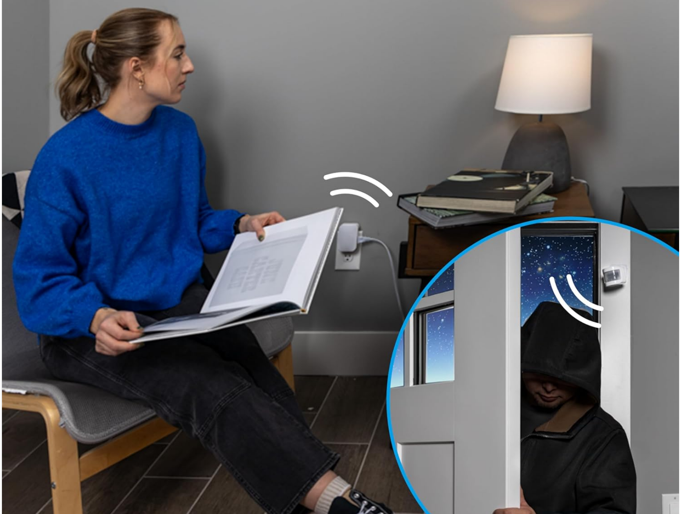
Image: A visual representation of the motion sensor detecting movement, automatically activating a connected device. The image shows a person reading and a separate scene of a person entering a room, triggering the sensor.