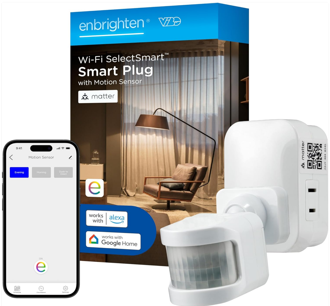
Image: The Enbrighten Vibe Smart Plug-in Outlet and its accompanying wireless motion sensor. The plug features a polarized outlet and a Matter QR code for easy setup.