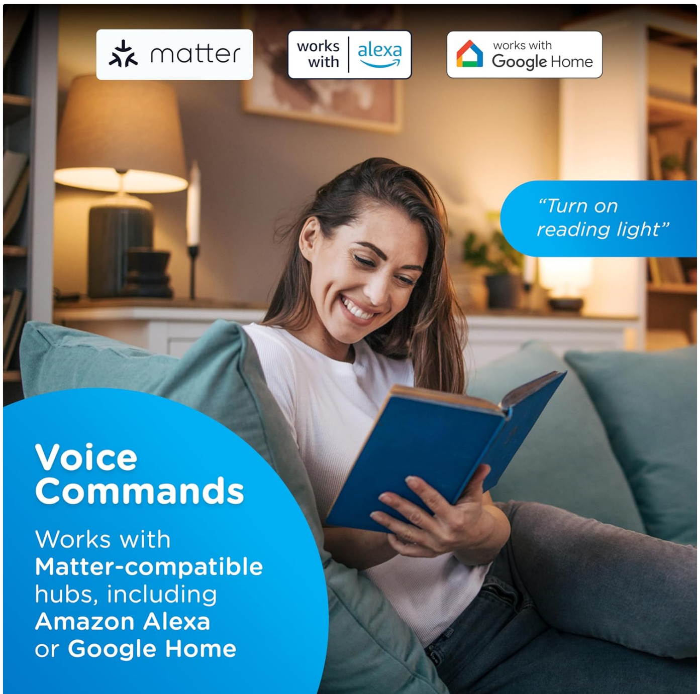
Image: A woman relaxing on a couch, using voice commands to control a smart device. Logos for Matter, Alexa, and Google Home indicate compatibility.