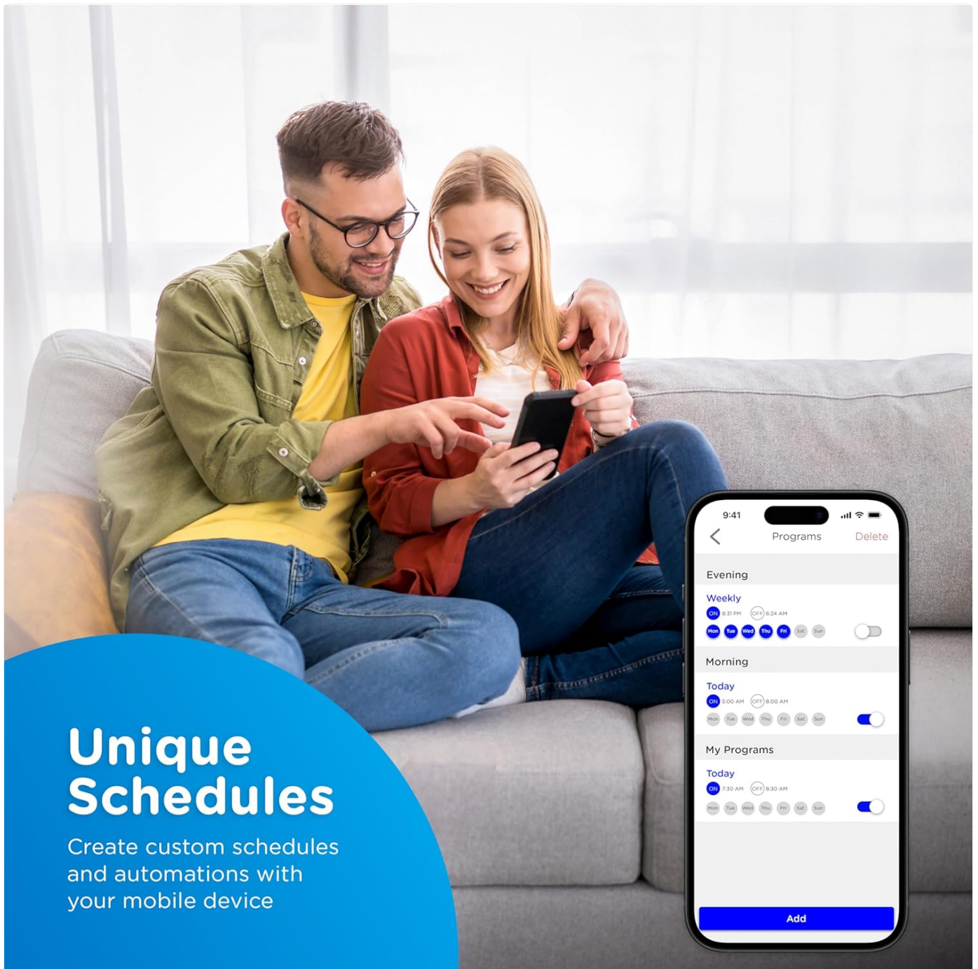
Image: A couple viewing a mobile app interface displaying options for creating custom schedules and automations for smart devices.