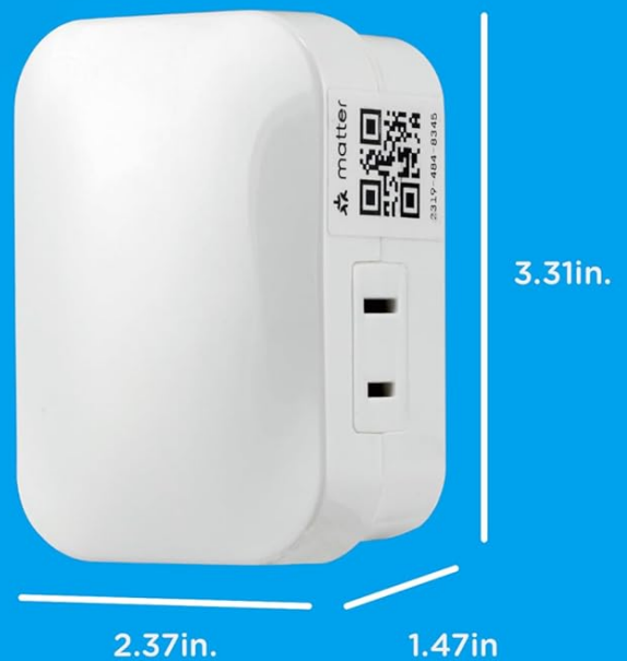
Image: Detailed dimensions for both the Enbrighten Vibe Smart Plug and the wireless motion sensor.