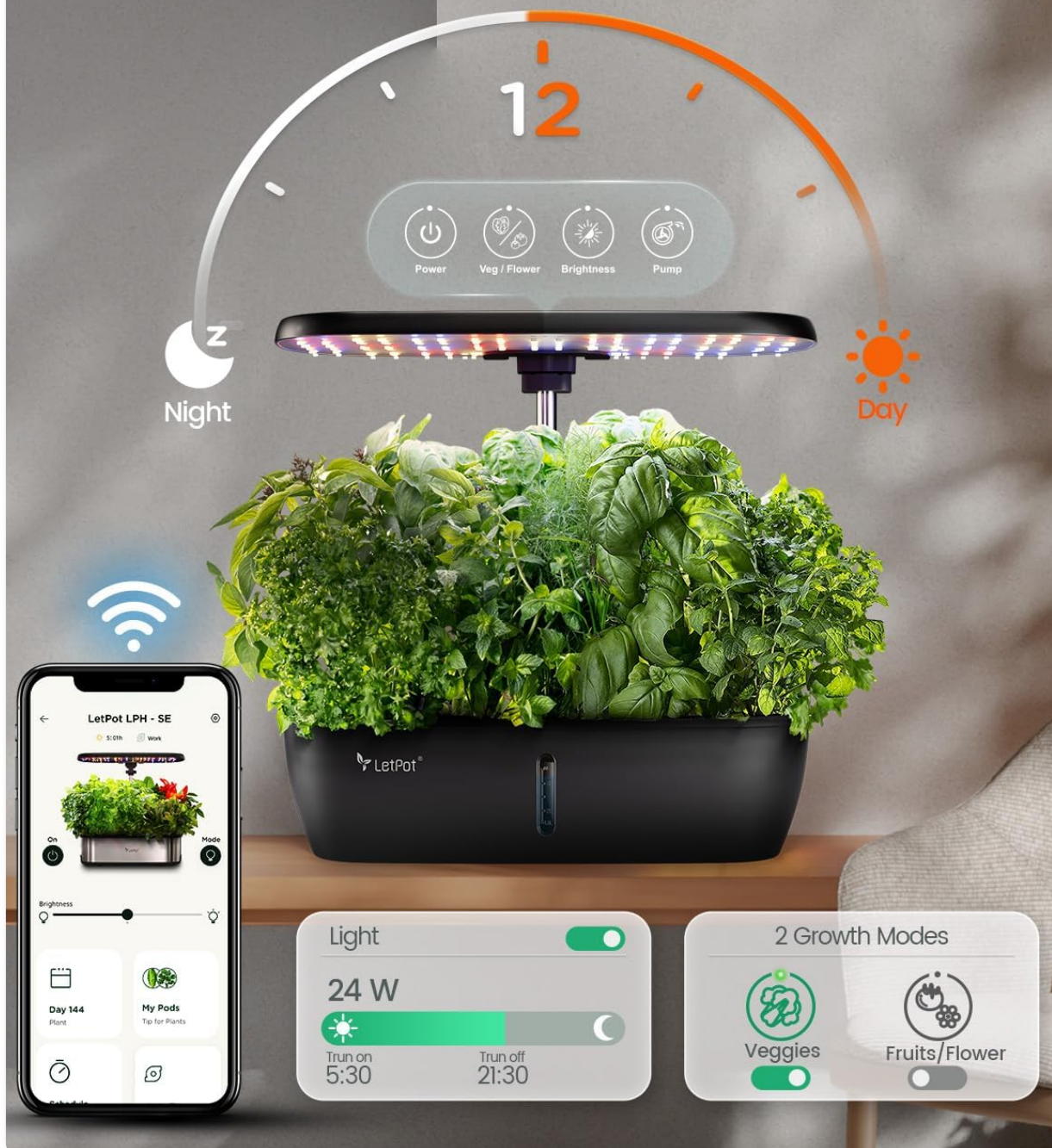
Image: The LETPOT LPH-Lite system with a smartphone displaying the app interface for setting lighting schedules and monitoring plant growth.