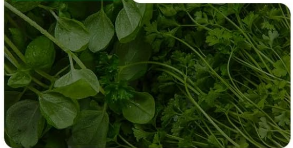
Image: The LETPOT LPH-Lite Hydroponics Growing System showcasing a variety of thriving plants, including herbs, vegetables, and flowers, highlighting its versatility for different planting needs.