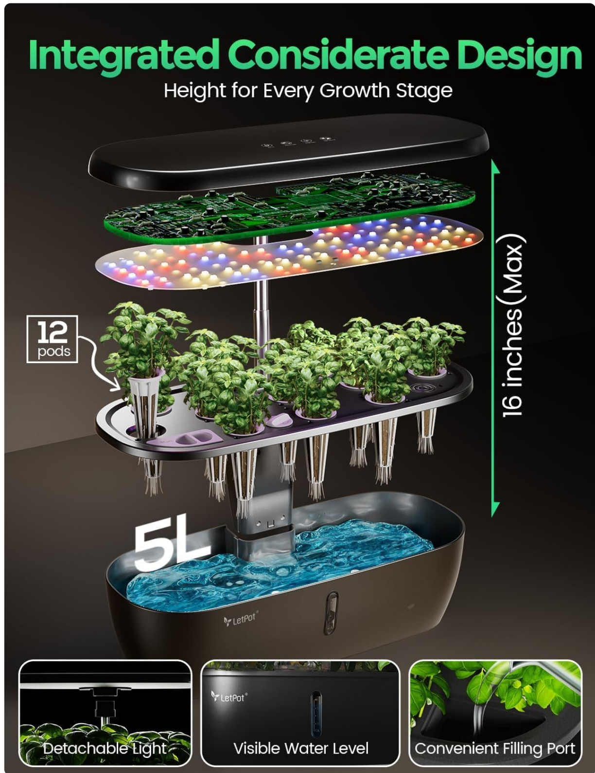
Image: An exploded diagram illustrating the various components of the LETPOT LPH-Lite system, including the water tank, light panel, and individual planting pods.