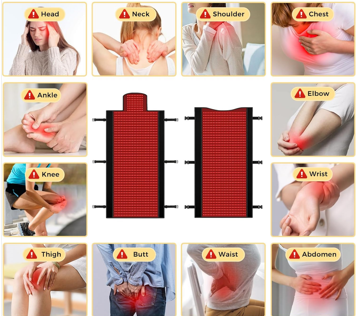
Figure 4: Mat Dimensions. This image provides a visual representation of the mat's size for full body coverage.