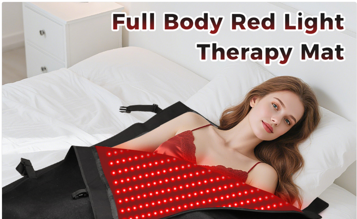
Figure 1: Full Body Coverage Diagram. This image illustrates the extensive coverage provided by the therapy mat, targeting various body areas for comprehensive treatment.

The mat is constructed from premium leather, offering a durable and easy-to-clean surface. It includes a multifunctional custom controller that allows users to adjust intensity levels, set session durations, and select from various therapy modes.