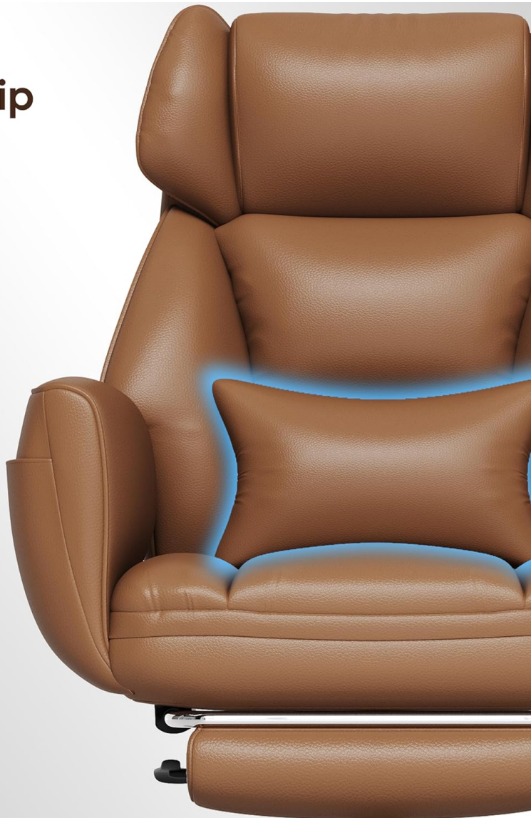
Image: Premium Craftsmanship. This image highlights the durable and easy-to-clean leather material of the chair.