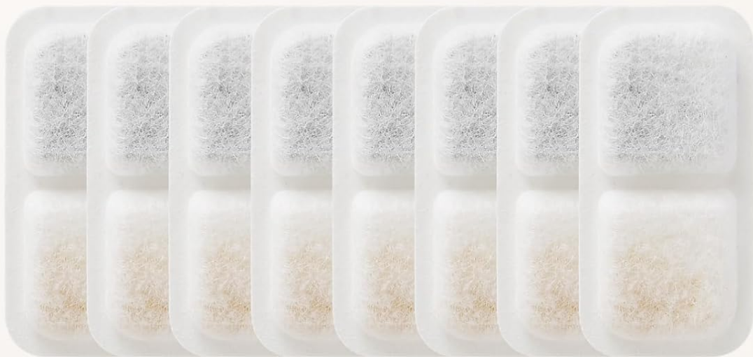
Figure 2.1: Contents of the replacement filter package, including 8 filters and 8 sponges.