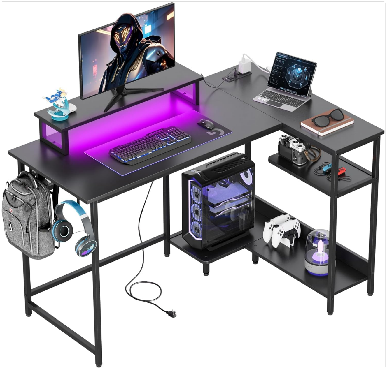
Image 1.1: The DEVAISE AMGZ L-Shaped Gaming Desk, showcasing its design and features with a monitor, keyboard, and other accessories.