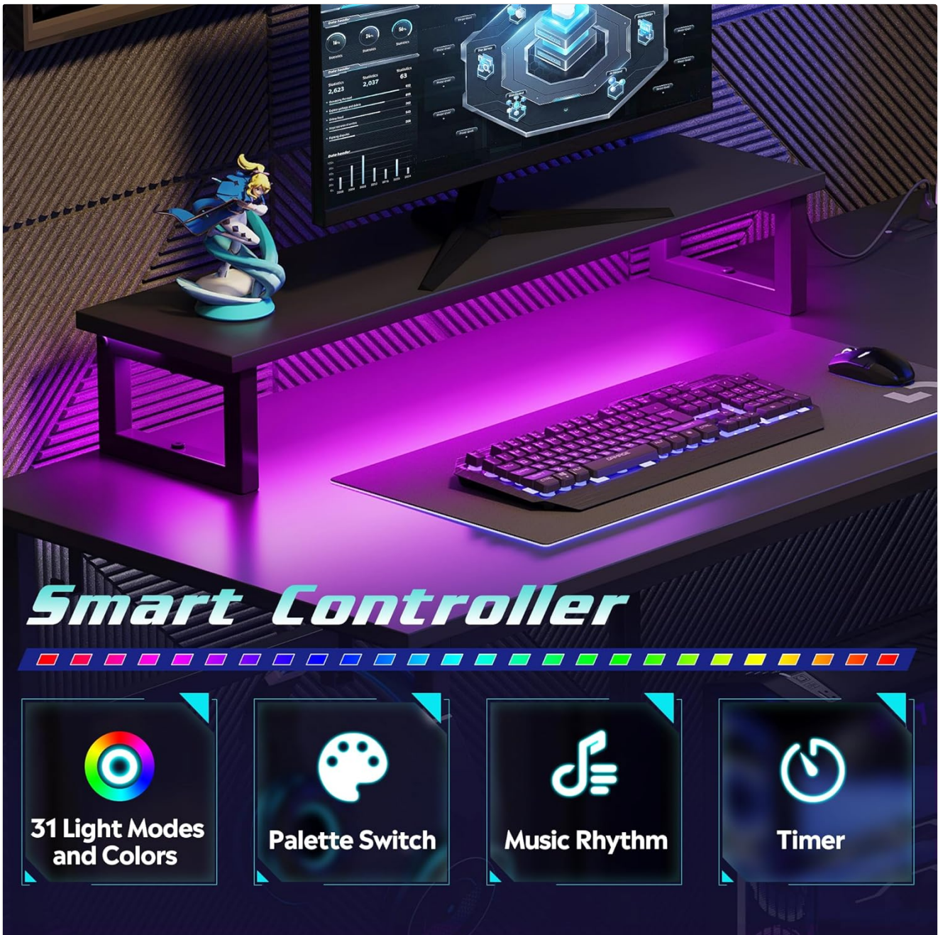
Image 3.1: Visual representation of the smart controller features, including 31 light modes and colors, palette switch, music rhythm, and timer functions.