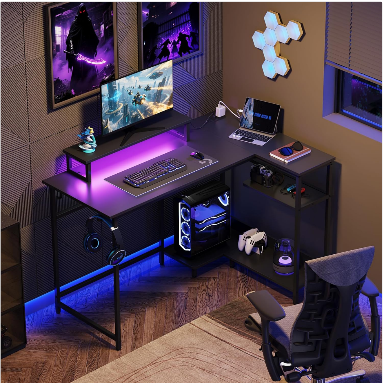
Image 1.2: The DEVAISE AMGZ L-Shaped Gaming Desk integrated into a modern room setup, demonstrating its aesthetic and functional placement.