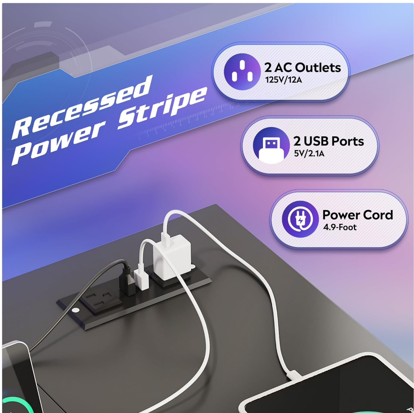
Image 3.2: Close-up view of the recessed power strip, highlighting the two AC outlets and two USB charging ports, along with the 4.9-foot power cord.