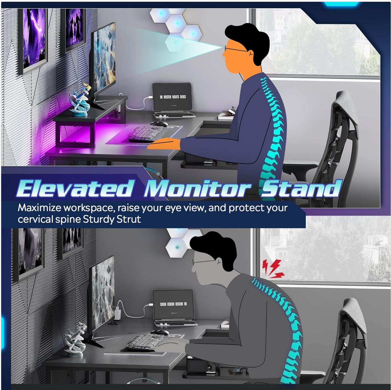
Image 3.3: Comparison illustrating the benefits of an elevated monitor stand for maintaining proper ergonomic posture versus a monitor placed directly on the desk.