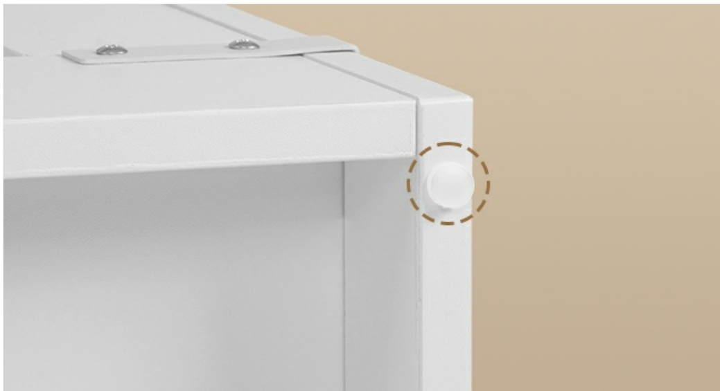
Image: Illustration of typical assembly steps, showing panels and connection points.