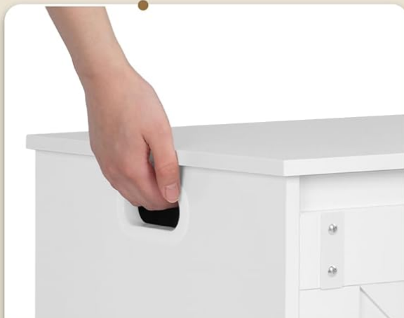
Easy to Move