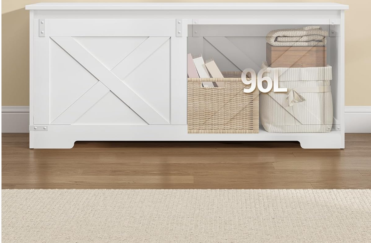
Image: Example of items that can be stored inside the chest, demonstrating its large capacity.