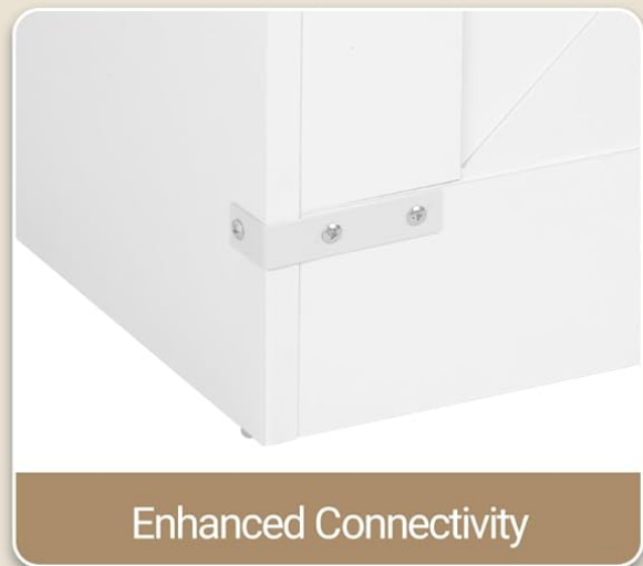
Image: The chest being used as a bench, illustrating its sturdy top plate and enhanced connectivity.