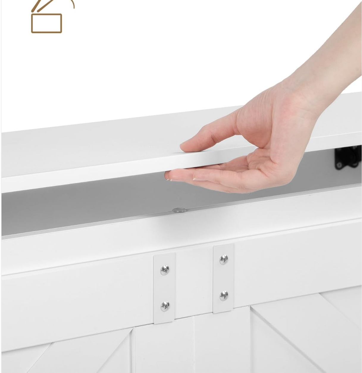
Image: Detail of the grooved lid design for convenient opening.