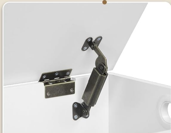
Smooth Opening and Closing

Image: Details of the side handles for portability and the smooth operation of the lid hinges.