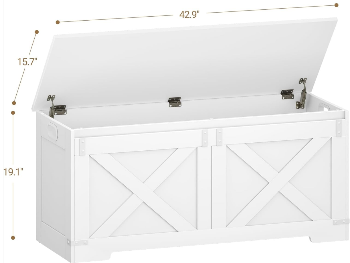
Image: Visual representation of the chest's dimensions and the safe lid feature, highlighting its 330 lb weight capacity.