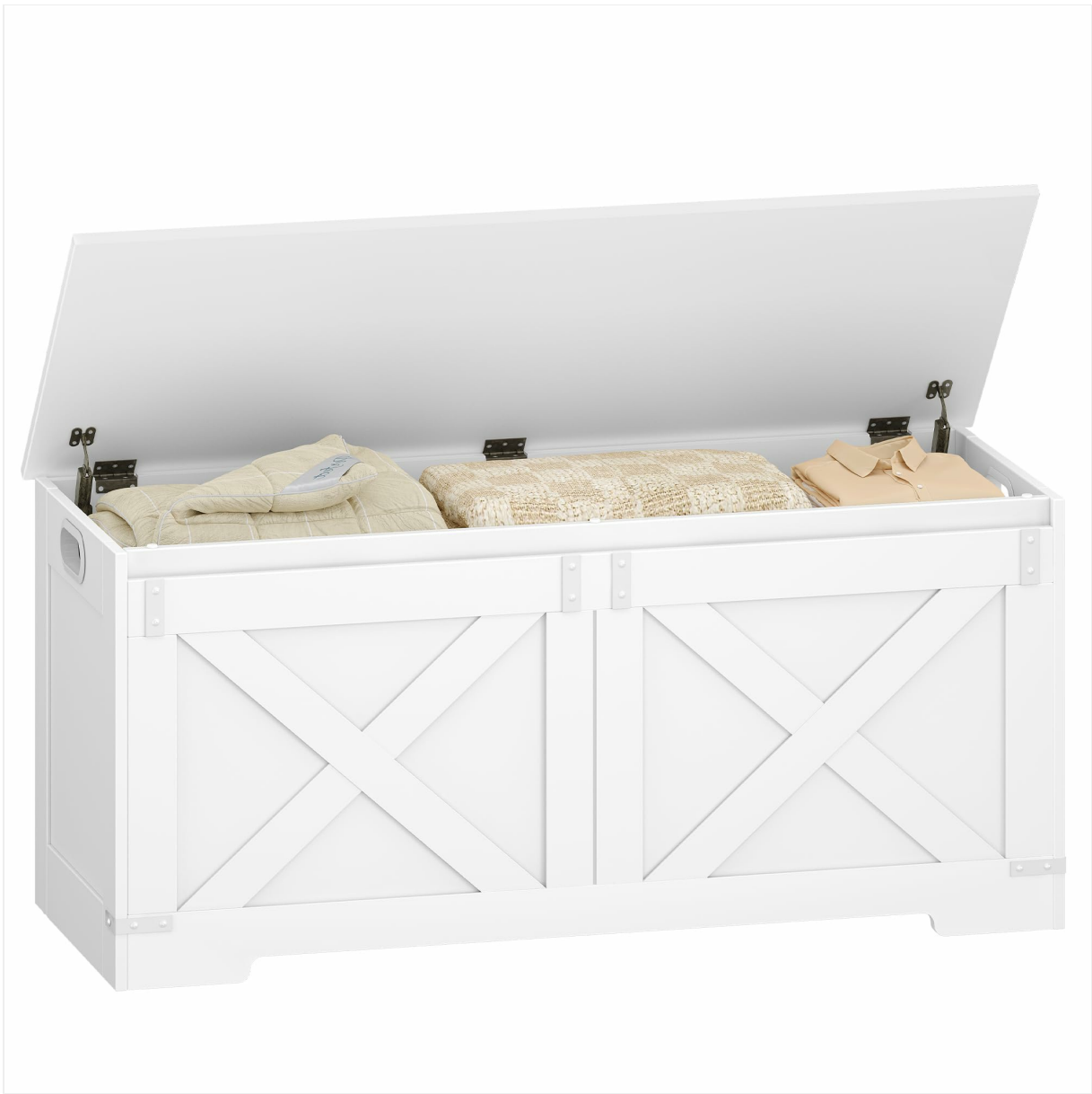
Image: The storage chest with its lid open, showcasing internal storage space.