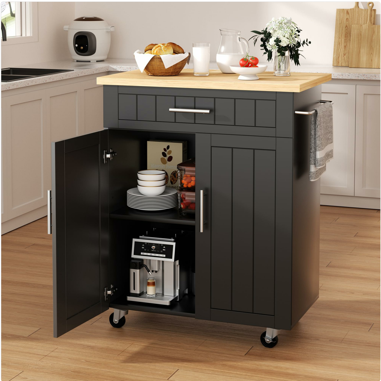
Figure 1: Front view of the Shintenchi Portable Kitchen Island Cart.