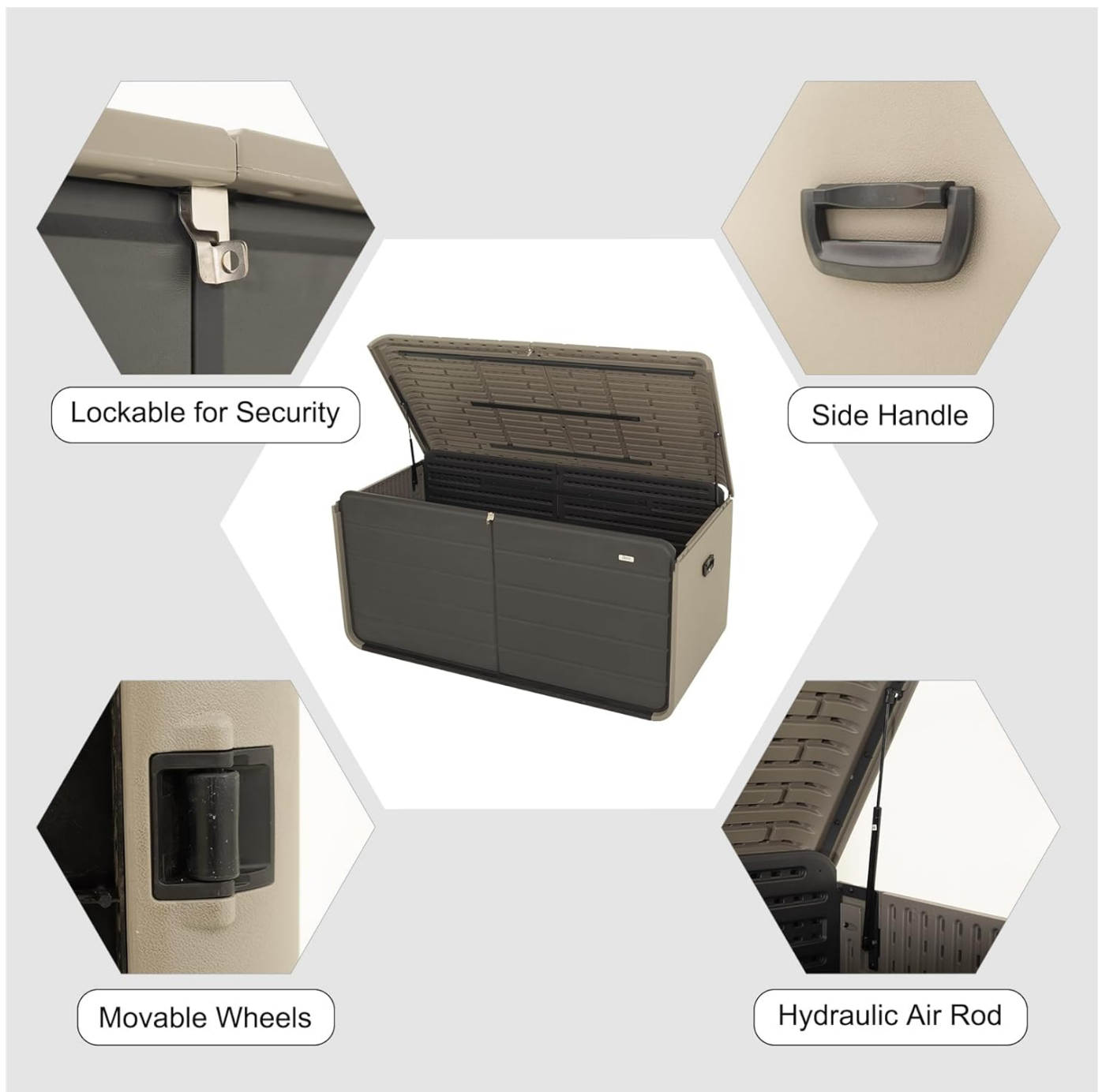
Image: A composite image highlighting the lockable feature, side handles, movable wheels, and hydraulic air rod for enhanced security and portability.