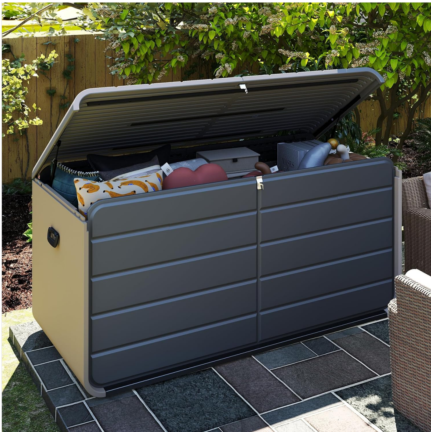
Image: The Domi 260 Gallon Resin Deck Box shown open, storing patio cushions, pool supplies, and garden tools in an outdoor setting.