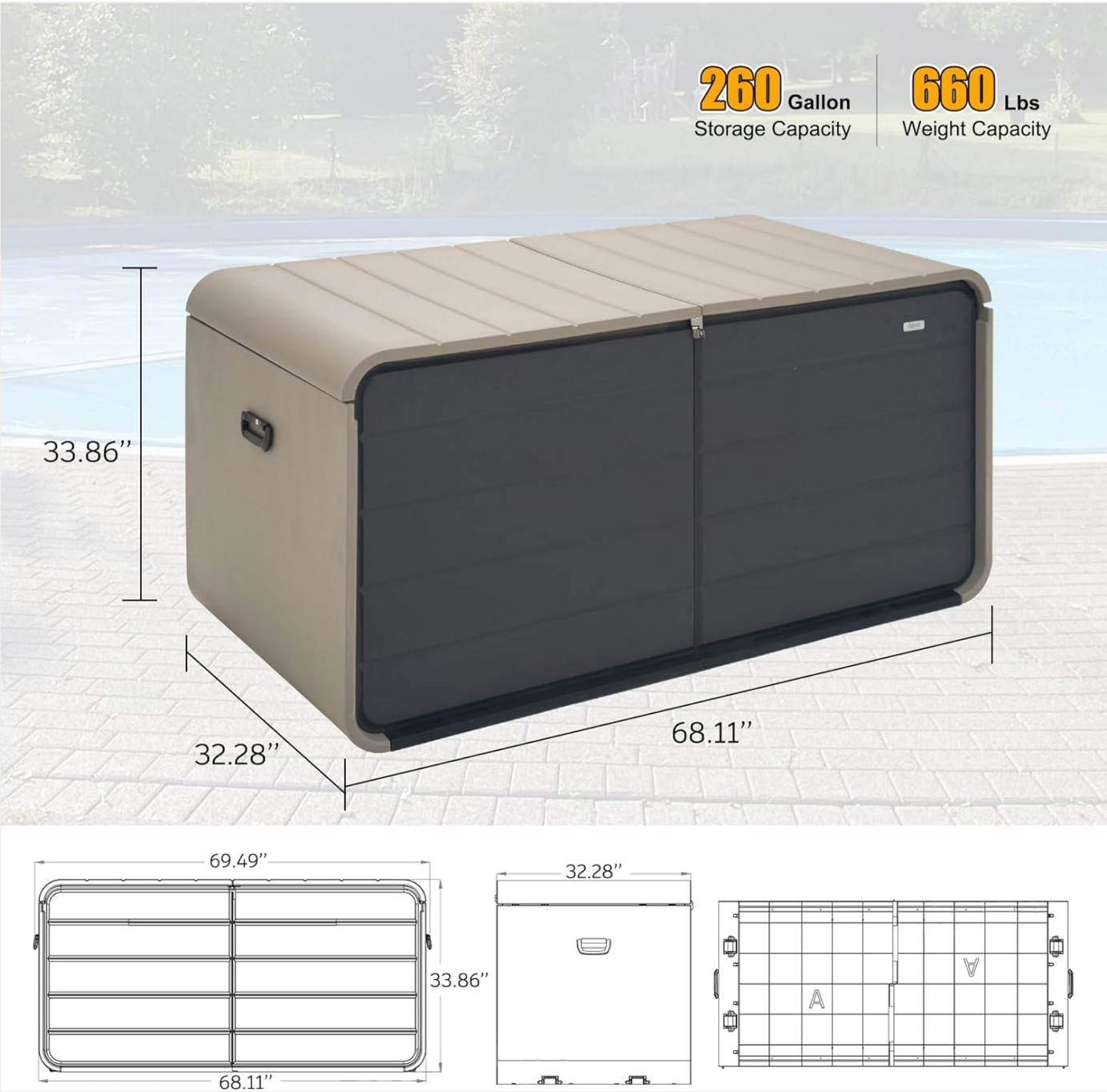
Image: Technical drawing illustrating the length, width, and height measurements of the deck box.

For warranty information, product support, or to inquire about replacement parts, please contact the manufacturer, domi outdoor living , or the seller, Fay outdoor life , directly through your purchase platform or their official website. Please have your model number (LNCZ0605-Fay-0515) and proof of purchase available when contacting support. For general inquiries, you may also refer to the product page on Amazon: Domi 260 Gallon Resin Deck Box on Amazon