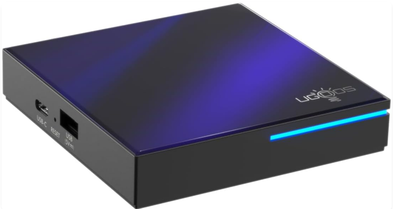
Figure 3.2: Front and side view highlighting the indicator light strip, which illuminates when the device is powered on.