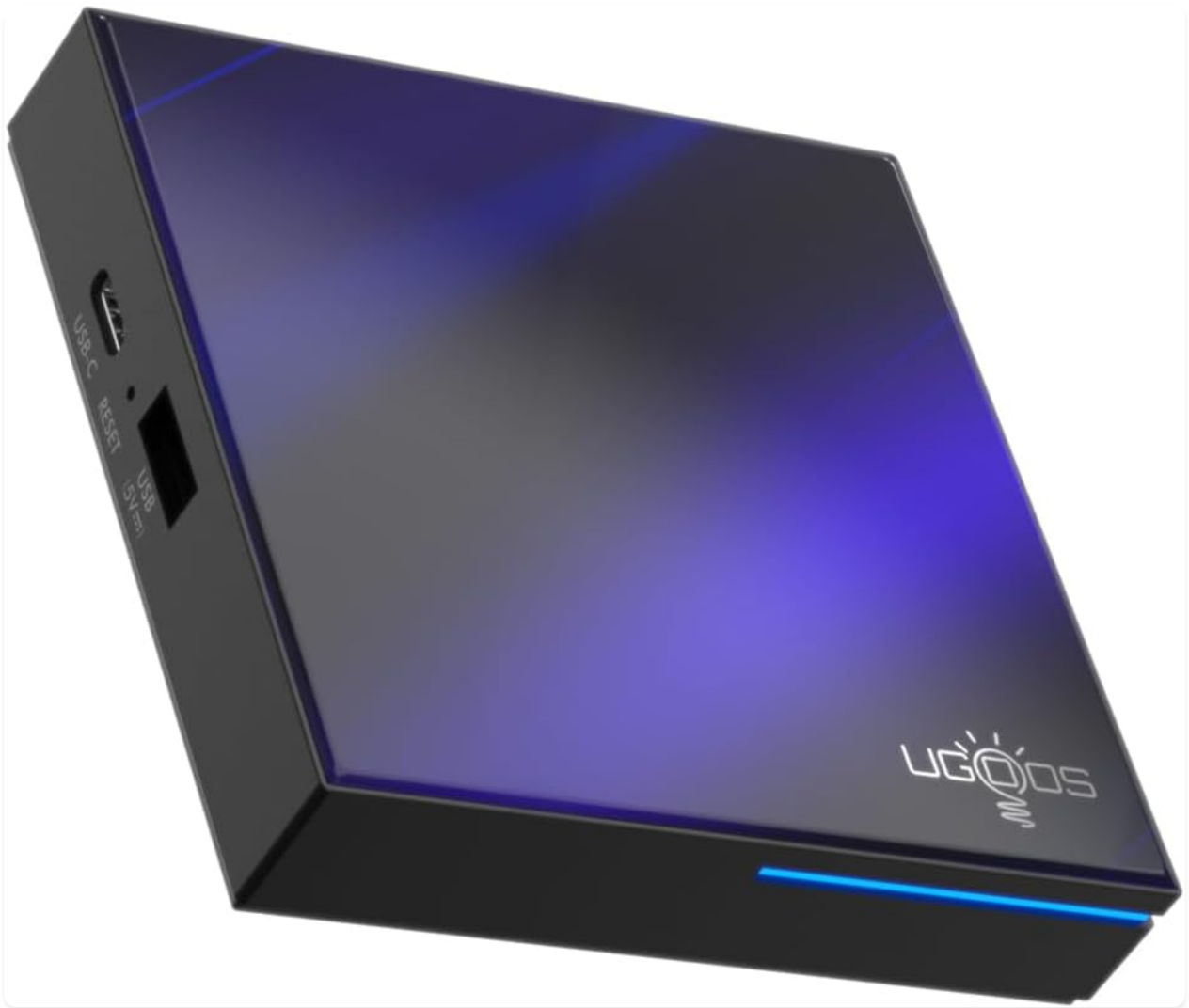
Figure 3.1: Side view of the Ugoos SK2 TV Box, showing the USB-C, Reset button, and USB 2.0 (5V===) port.