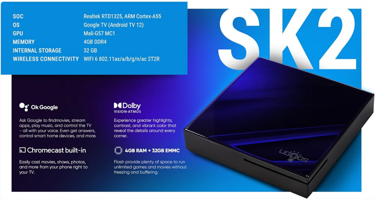
Figure 8.1: Overview of the Ugoos SK2's core technical specifications.