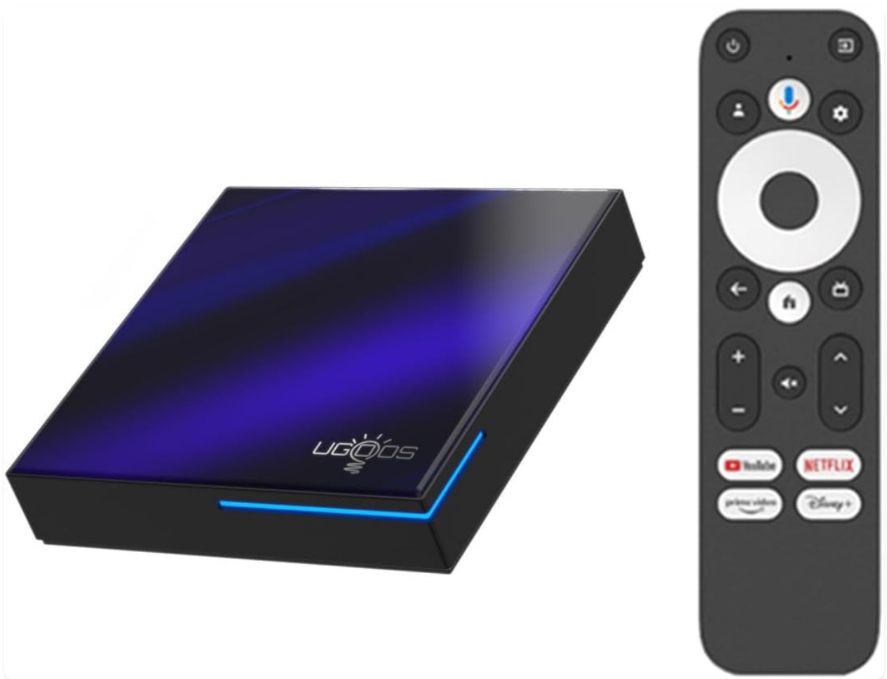
Figure 2.1: Ugoos SK2 TV Box and its accompanying remote control.