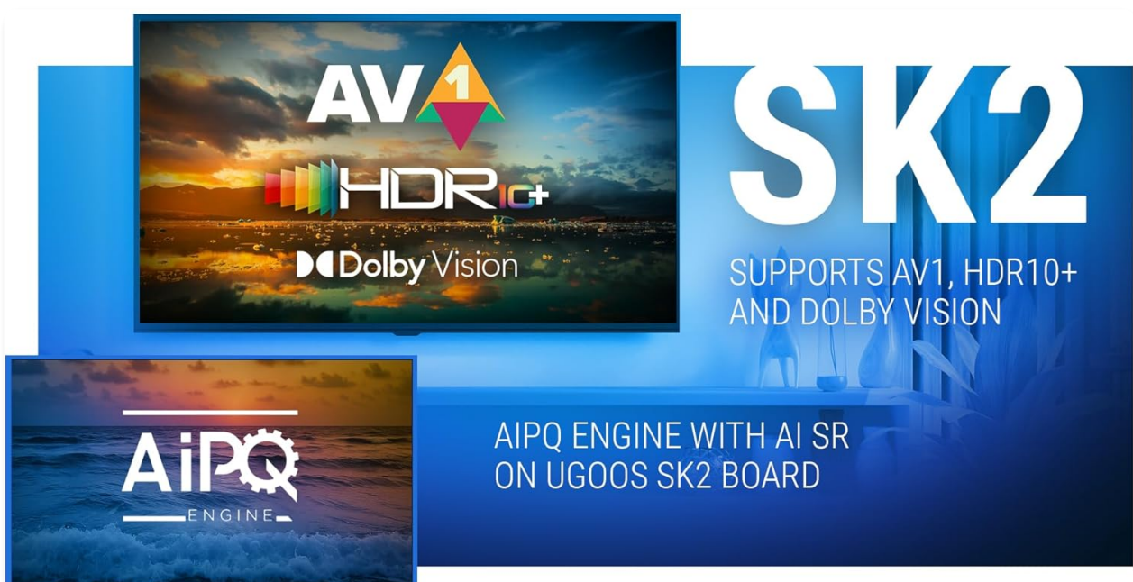
Figure 5.2: The device supports advanced video technologies like AV1, HDR10+, and Dolby Vision for enhanced visual fidelity.