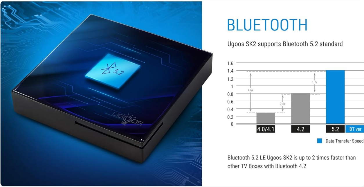
Figure 8.2: Comparison illustrating the improved data transfer speed of Bluetooth 5.2 supported by the Ugoos SK2.

Please read and follow these safety precautions to prevent damage to the device or injury to yourself: