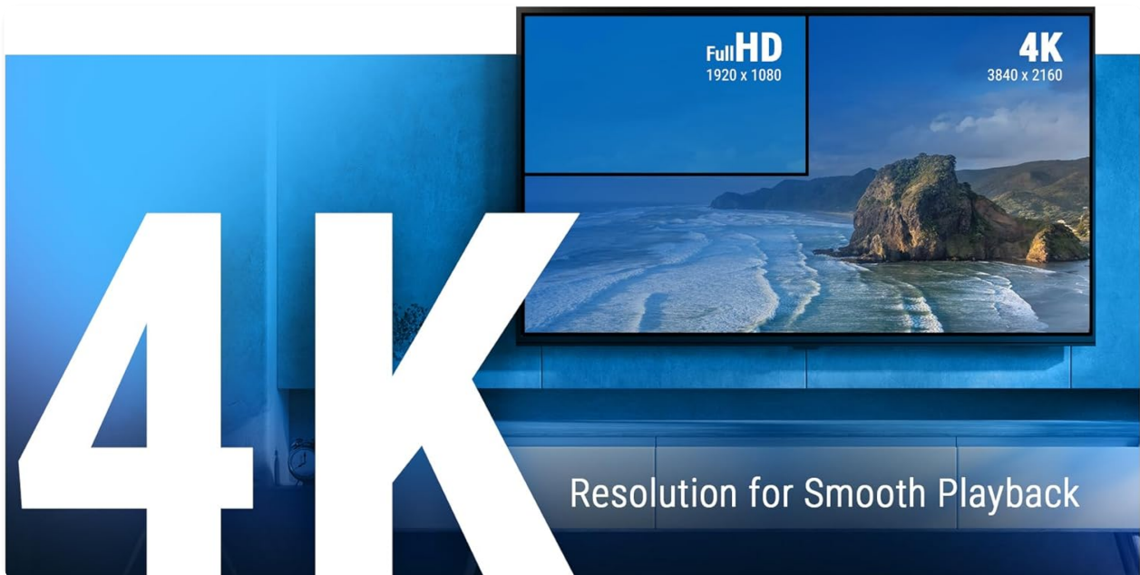
Figure 5.1: The Ugoos SK2 supports 4K resolution for smooth and high-quality video playback.

The Ugoos SK2 supports 4K 60fps resolution, H.265, AV1, and 4K HDR content, including Dolby Vision and HDR10+. This ensures a vibrant and detailed viewing experience with smooth playback.