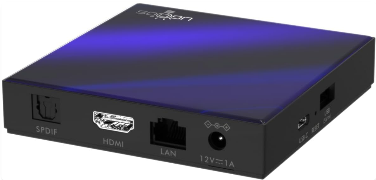
Figure 3.3: Rear view of the Ugoos SK2 TV Box, displaying the SPDIF, HDMI, LAN (Ethernet), and 12V/1A Power input ports.

Video 3.1: An unboxing and overview of the Ugoos SK2 ATV Box, showcasing its design and available ports.