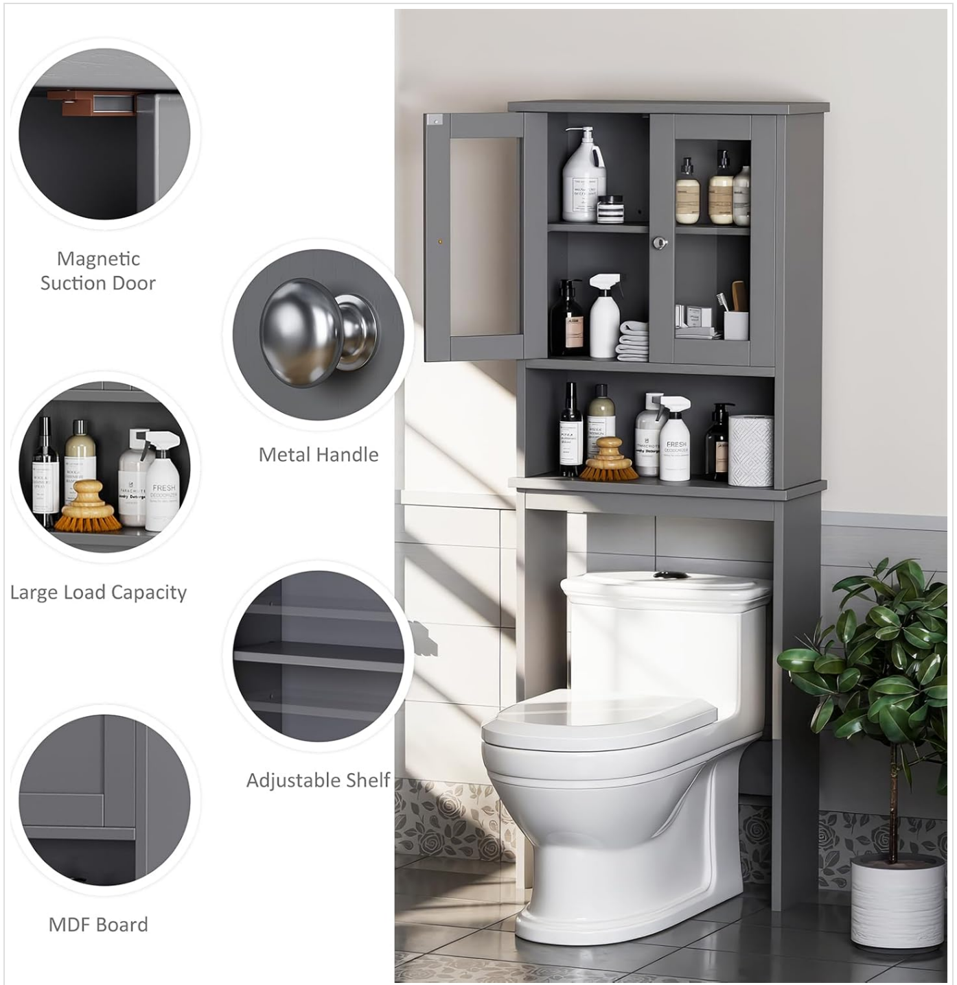
Image: Detailed view of cabinet features including magnetic suction door, metal handle, large load capacity, adjustable shelf, and MDF board construction.