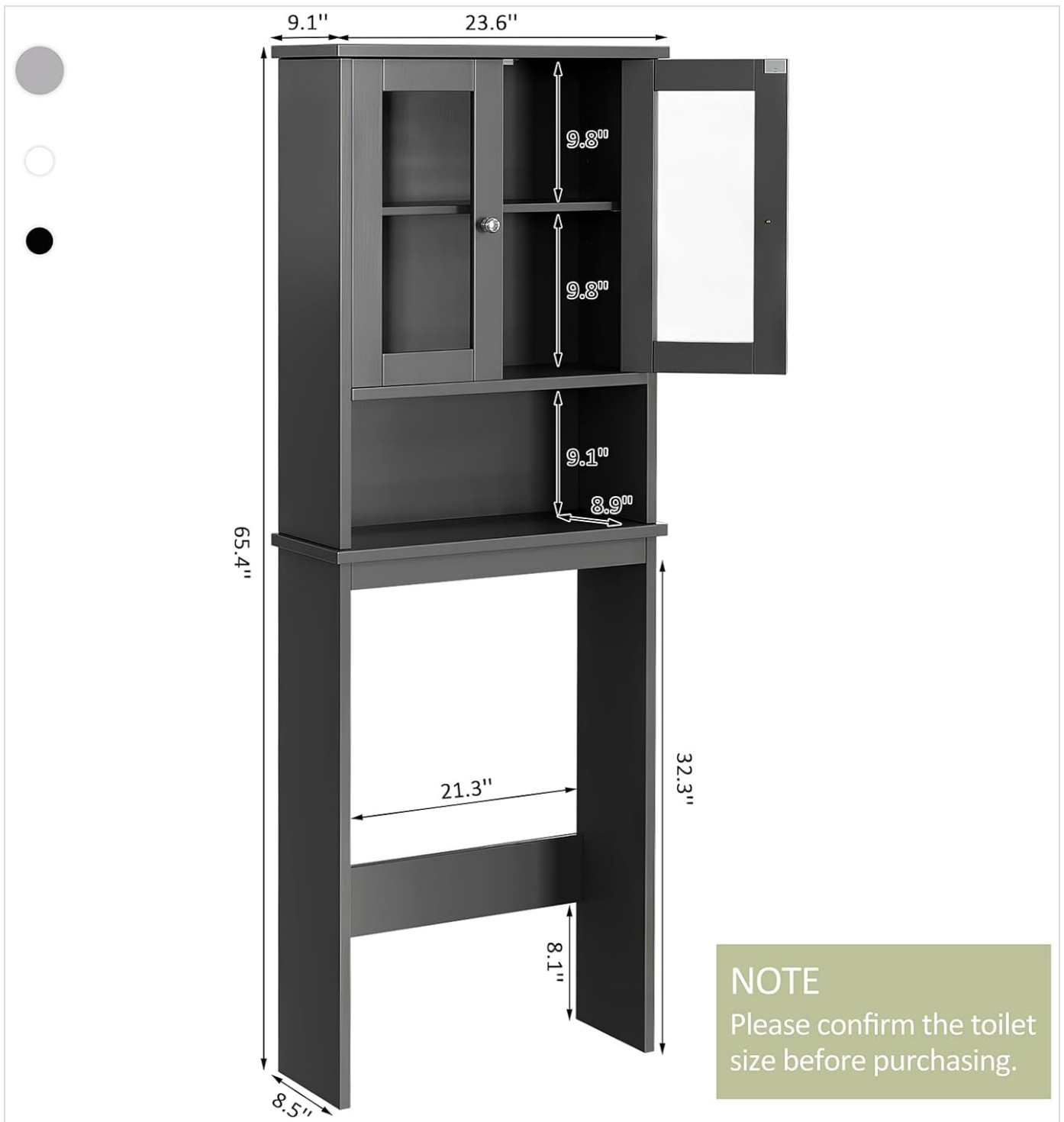
Image: Detailed dimensions of the Meilocar Over The Toilet Storage Cabinet, showing width, depth, height, and toilet clearance.