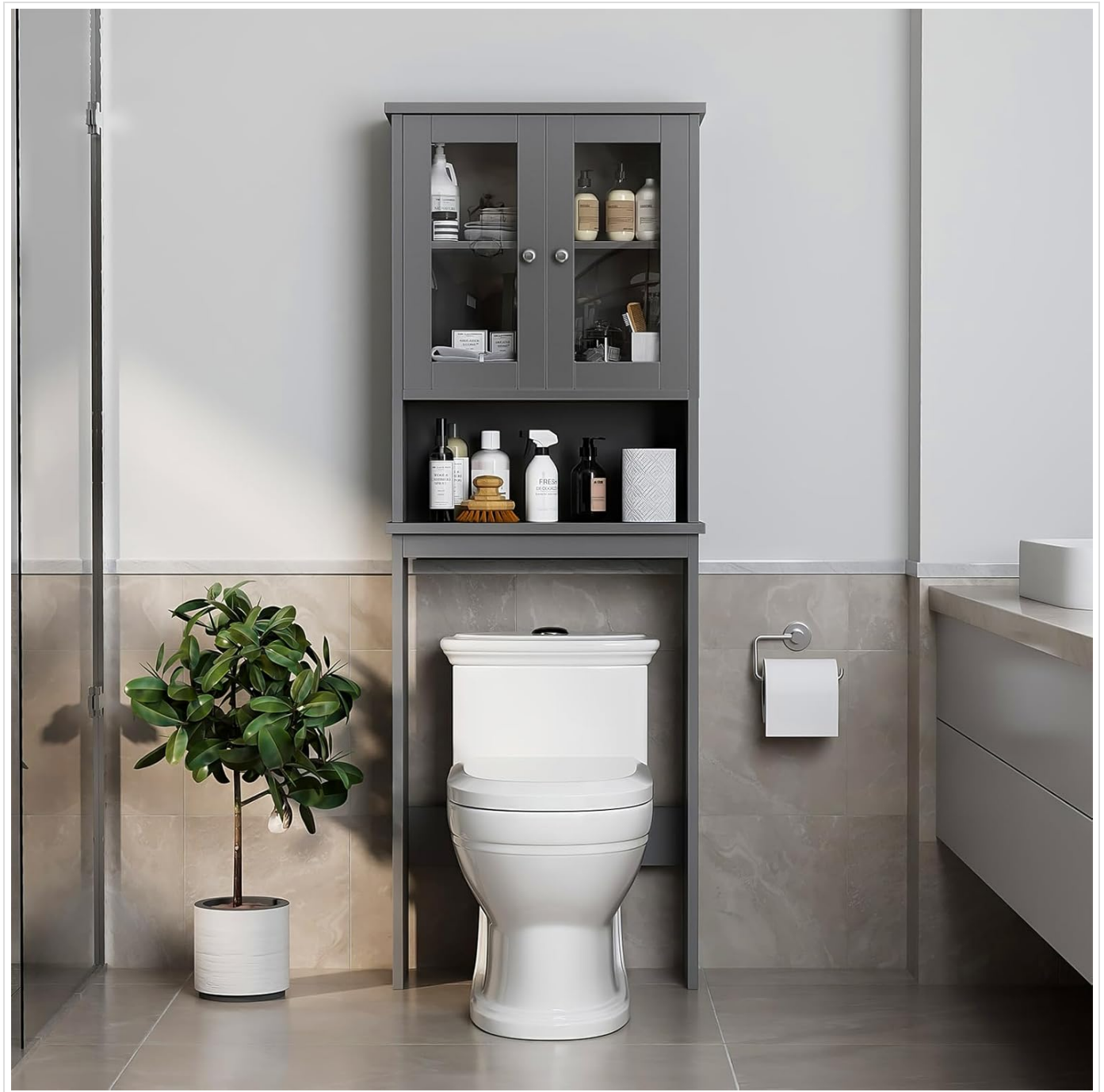
Image: The Meilocar Over The Toilet Storage Cabinet installed in a bathroom, providing storage above a toilet.