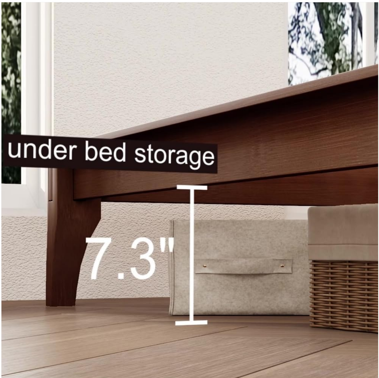
Image 5.1: Illustration of the 7.3-inch under-bed clearance for storage.