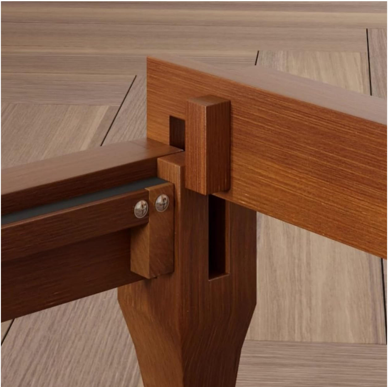
Image 4.1: Detail of the mortise and tenon joint for tool-free assembly.