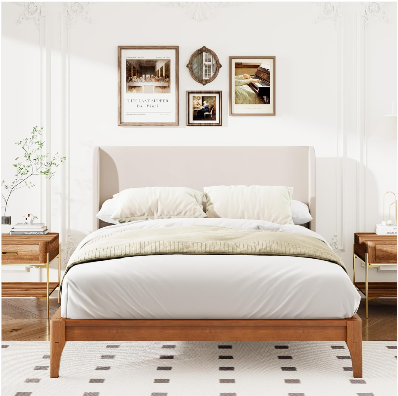
Image 1.1: Fully assembled GDFStudio King Size Platform Bed Frame with upholstered wingback headboard.