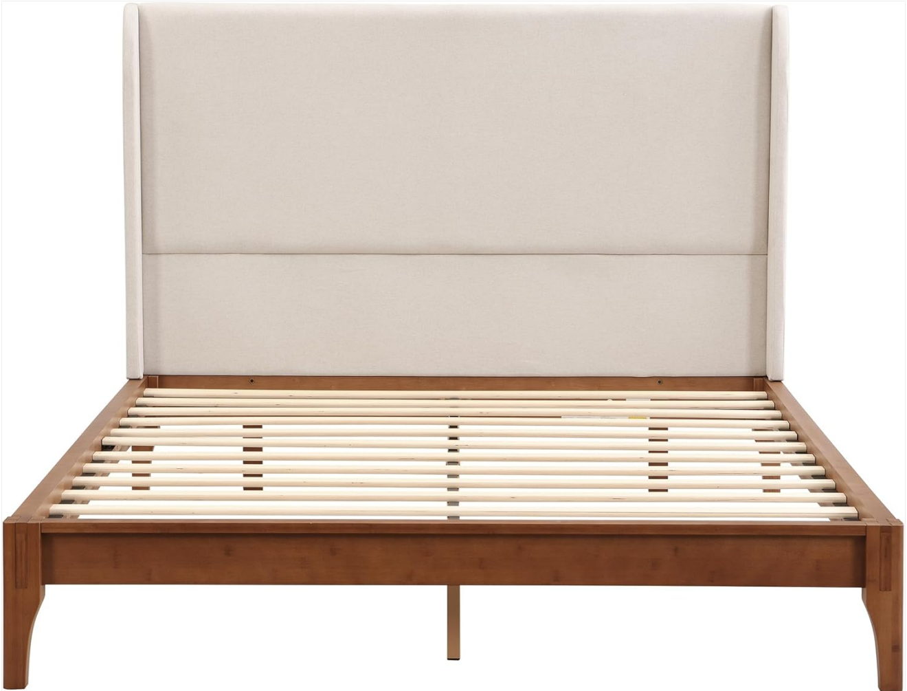
Image 3.1: View of the bed frame components, including headboard, side rails, and slats.