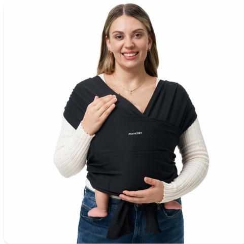
Image: The Momcozy Newborn Baby Wrap Carrier in black, shown being worn by a woman carrying a baby comfortably.