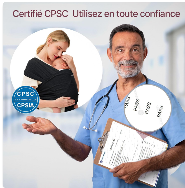
Image: A doctor holding a CPSC certification document, with an inset image of a woman comfortably carrying a baby in the Momcozy wrap, highlighting its safety certification.