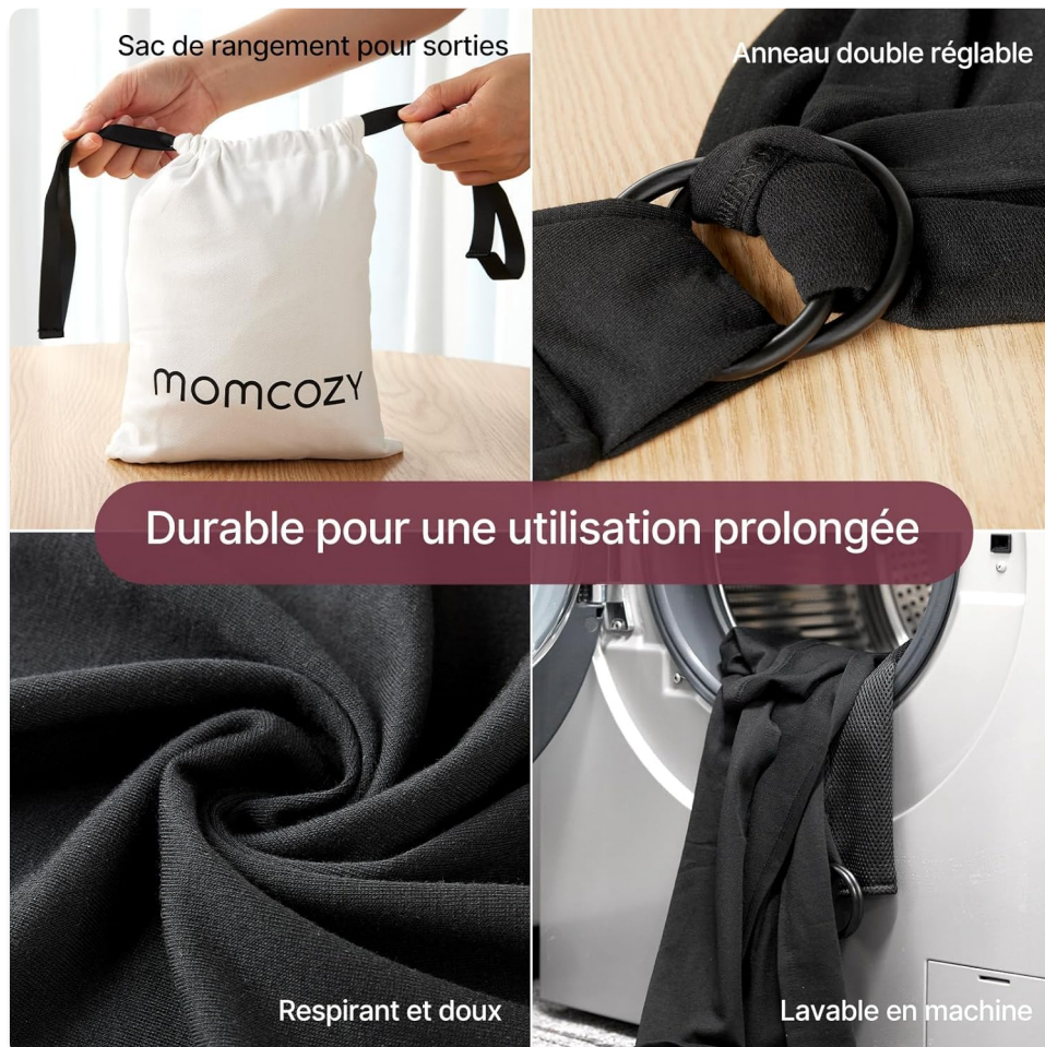
Image: A composite image showing the Momcozy storage bag, a close-up of the adjustable double ring, the breathable and soft fabric texture, and the carrier being placed into a washing machine.

When not in use, store the carrier in the provided travel bag to keep it clean and protected. Its lightweight design (600 grams) makes it easy to store and transport.