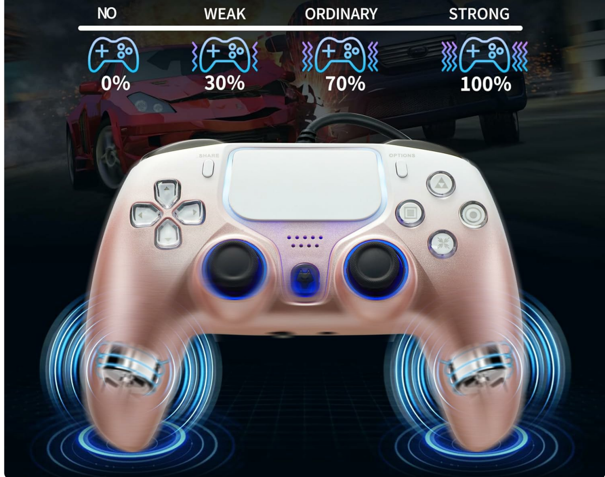
Figure 6: Dual Vibration Motors for Immersive Gameplay

Feel every action with precise rumble feedback for a more immersive gaming experience.