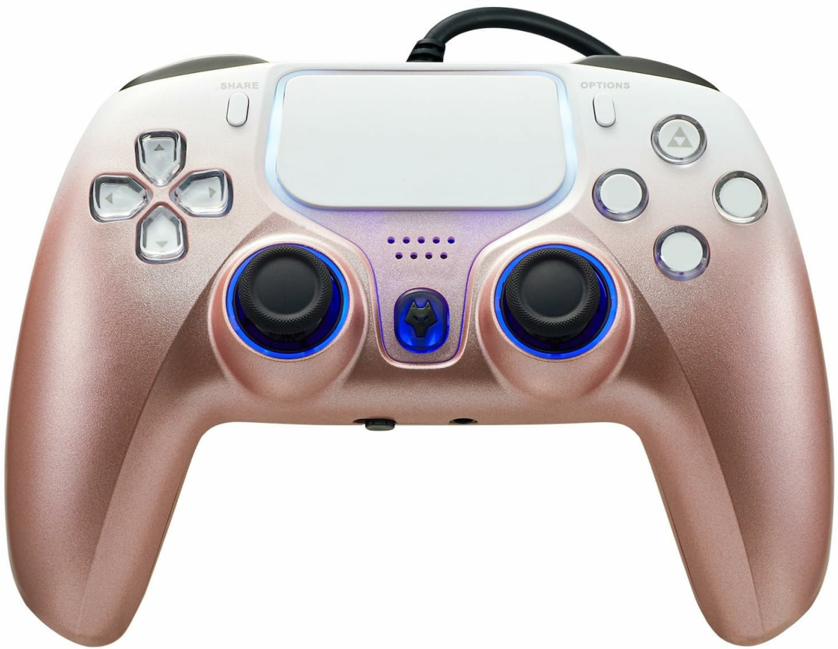
Figure 1: NBCP Wired PS5 Controller (Rose Gold)