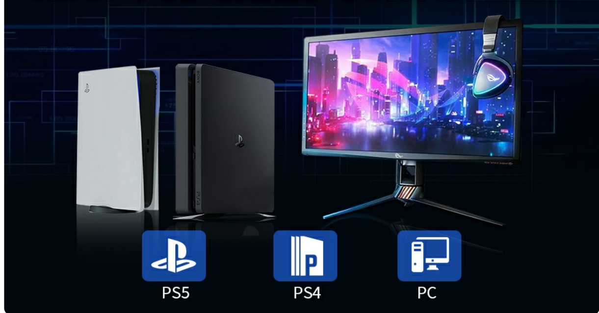
Figure 4: Turbo Function for Fast-Paced Games