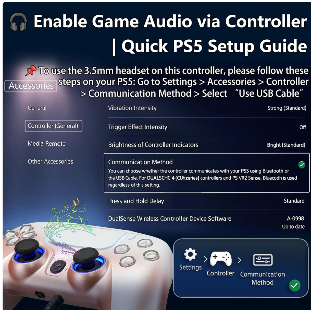
Figure 3: PS5 Audio Settings for Wired Controller

Ensure your standard TRRS gaming headset is plugged into the 3.5mm audio jack on the controller. Note: Apple EarPods are not supported due to CTIA/OMTP differences.