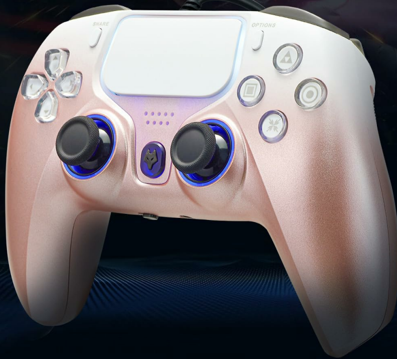
Figure 2: Wide Compatibility for PS5, PS4, PC, and Steam