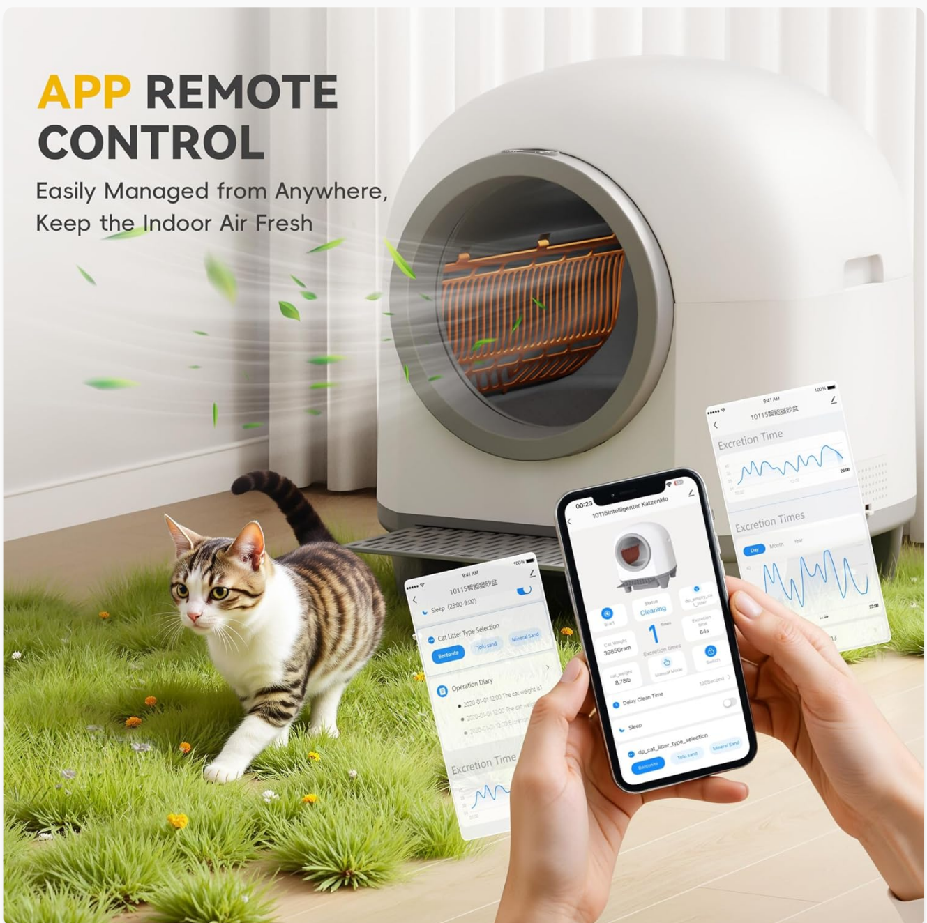
Image: App Remote Control. This image demonstrates the smartphone application interface, allowing users to easily manage the litter box remotely and monitor various settings and cat activity.