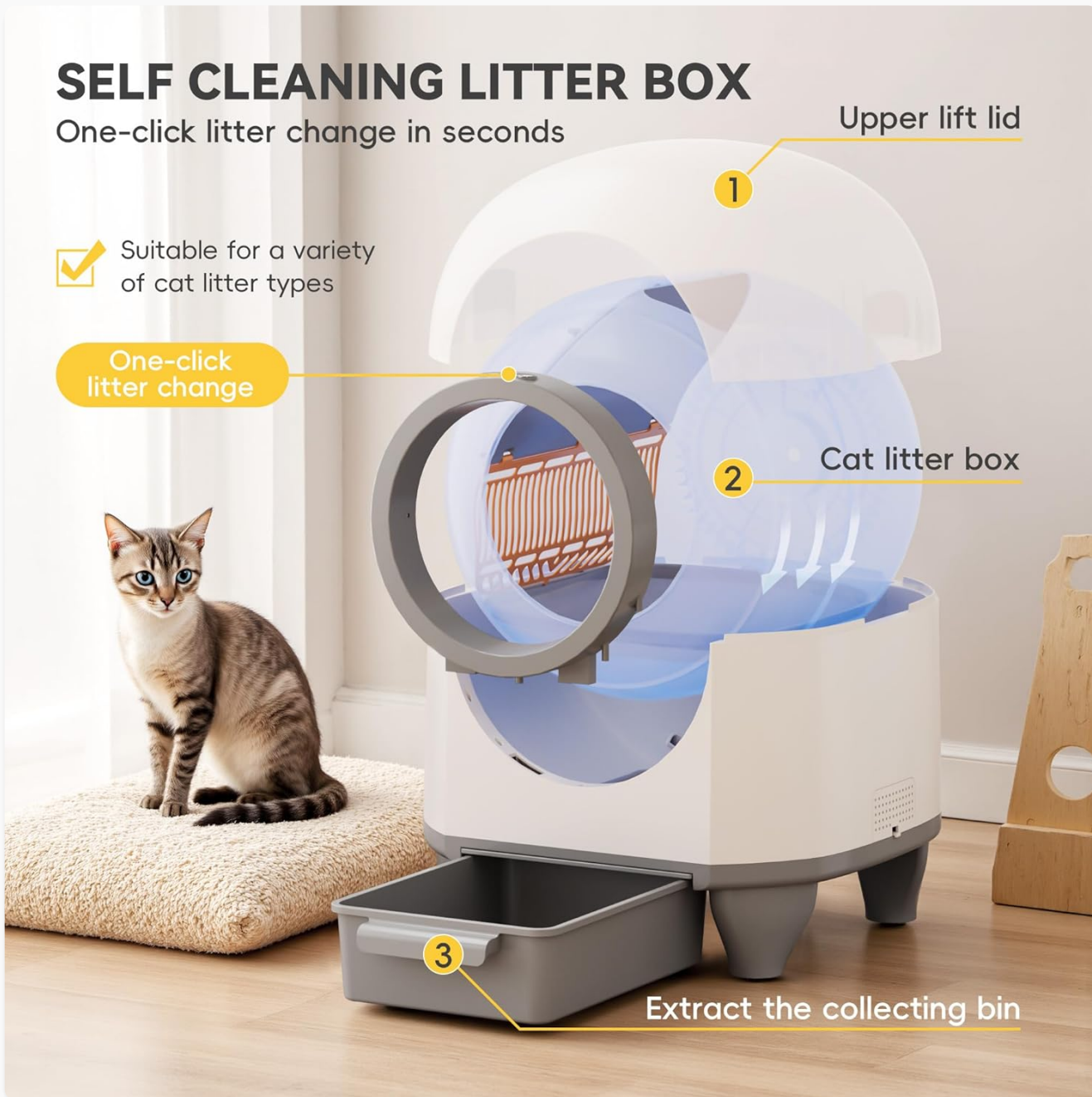
Image: Self-Cleaning Litter Box. This diagram illustrates the modular design, showing the upper lift lid, the cat litter box (drum), and the extractable collecting bin, facilitating easy setup and one-click litter changes.