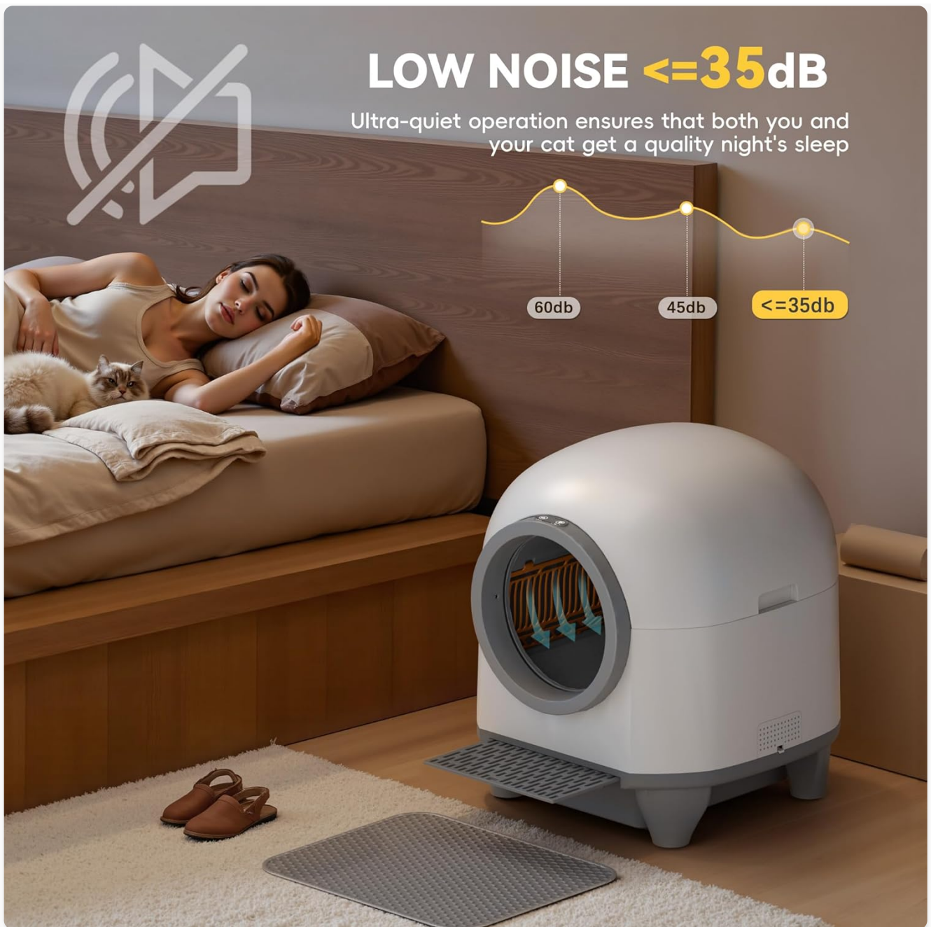
Image: Low Noise Operation. This image illustrates the quiet operation of the litter box, indicating noise levels below 35dB, ensuring minimal disturbance for both pets and owners, especially during sleep.