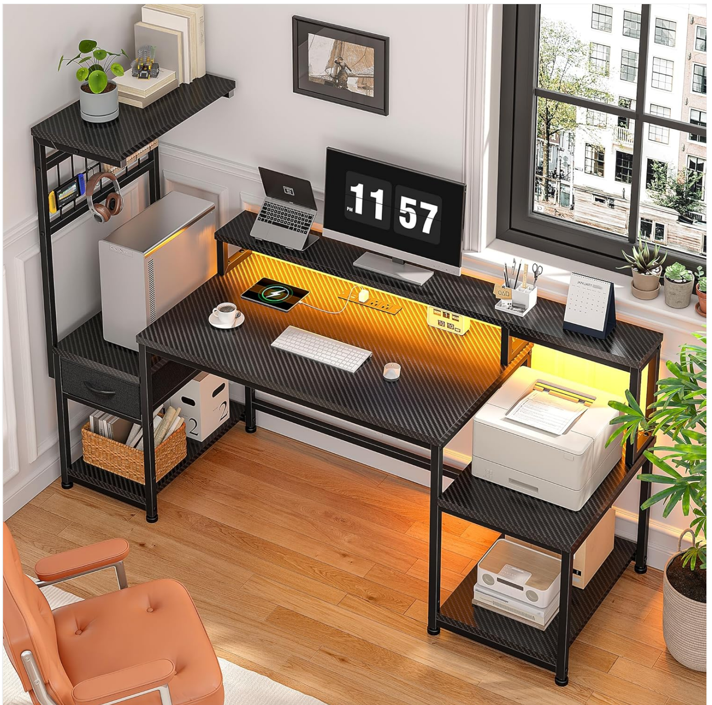
Image: An illustration demonstrating how the ergonomic monitor stand helps maintain correct posture.