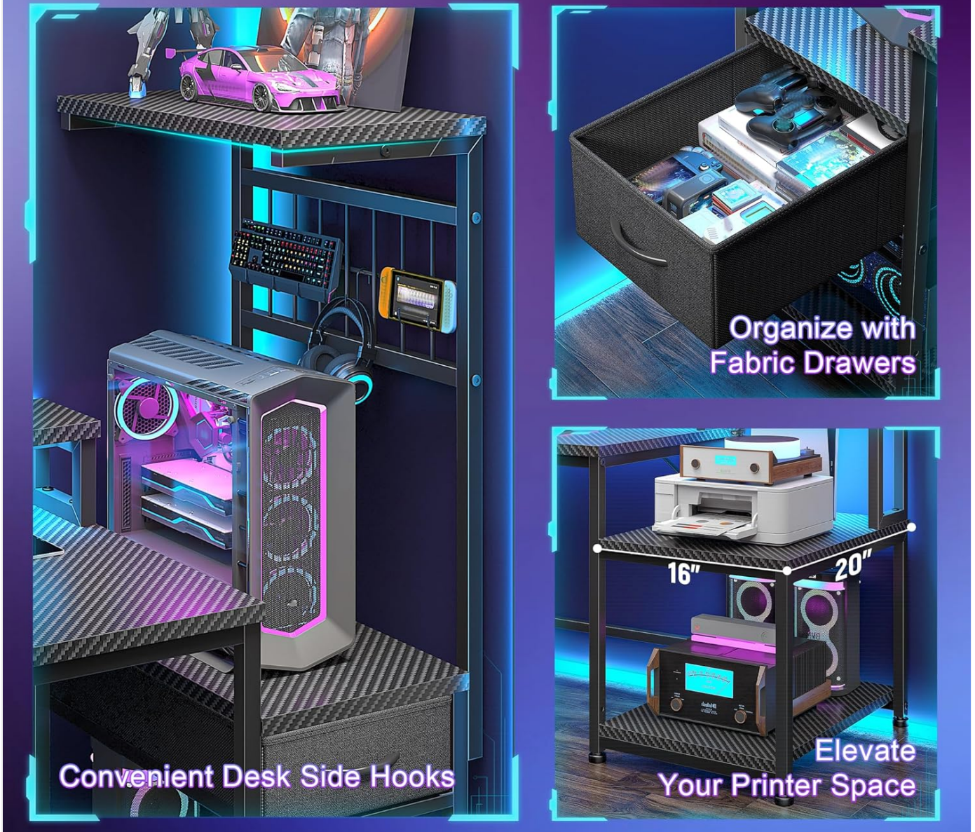
Image: Visual representation of the desk's storage capabilities, including the fabric drawer, shelves, and side hooks.