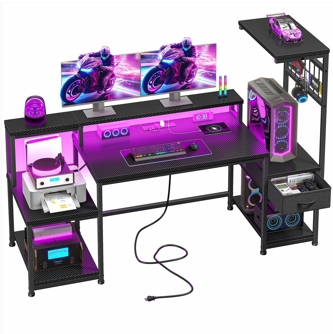
Image: The DurayLoly 55-inch Gaming Desk, showcasing its spacious design, LED lighting, and integrated features.