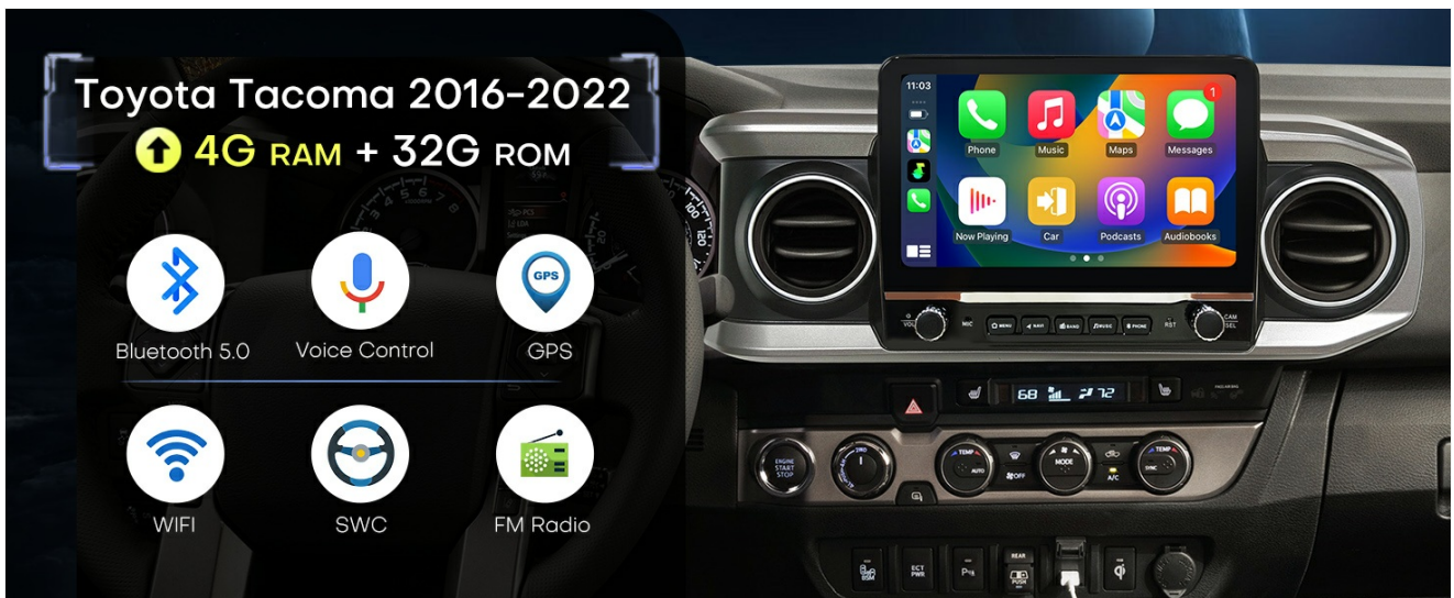
Image: Comparison of the Toyota Tacoma dashboard before and after installation of the Toeeklsa car radio, showing the integrated 10.1-inch display.