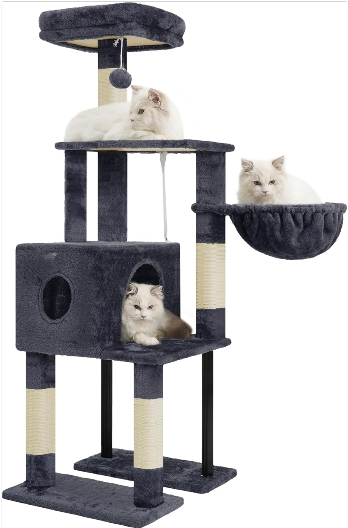
Image: The Heybly HCT200SG Cat Tree in anthracite grey, showcasing its multi-level design with two cats enjoying the platforms and condo.