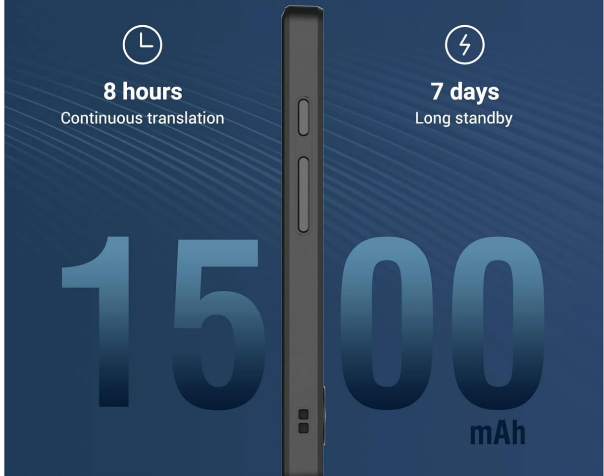
Image: Side profile of the W12 device, illustrating its long battery life of 8 hours continuous translation and 7 days standby, powered by a 1500mAh battery.