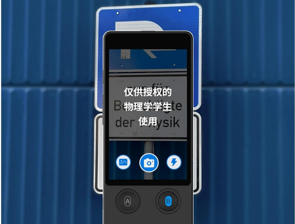
Image: The W12 device demonstrating instant photo translation, capturing text from a road sign and displaying its translation on the screen.