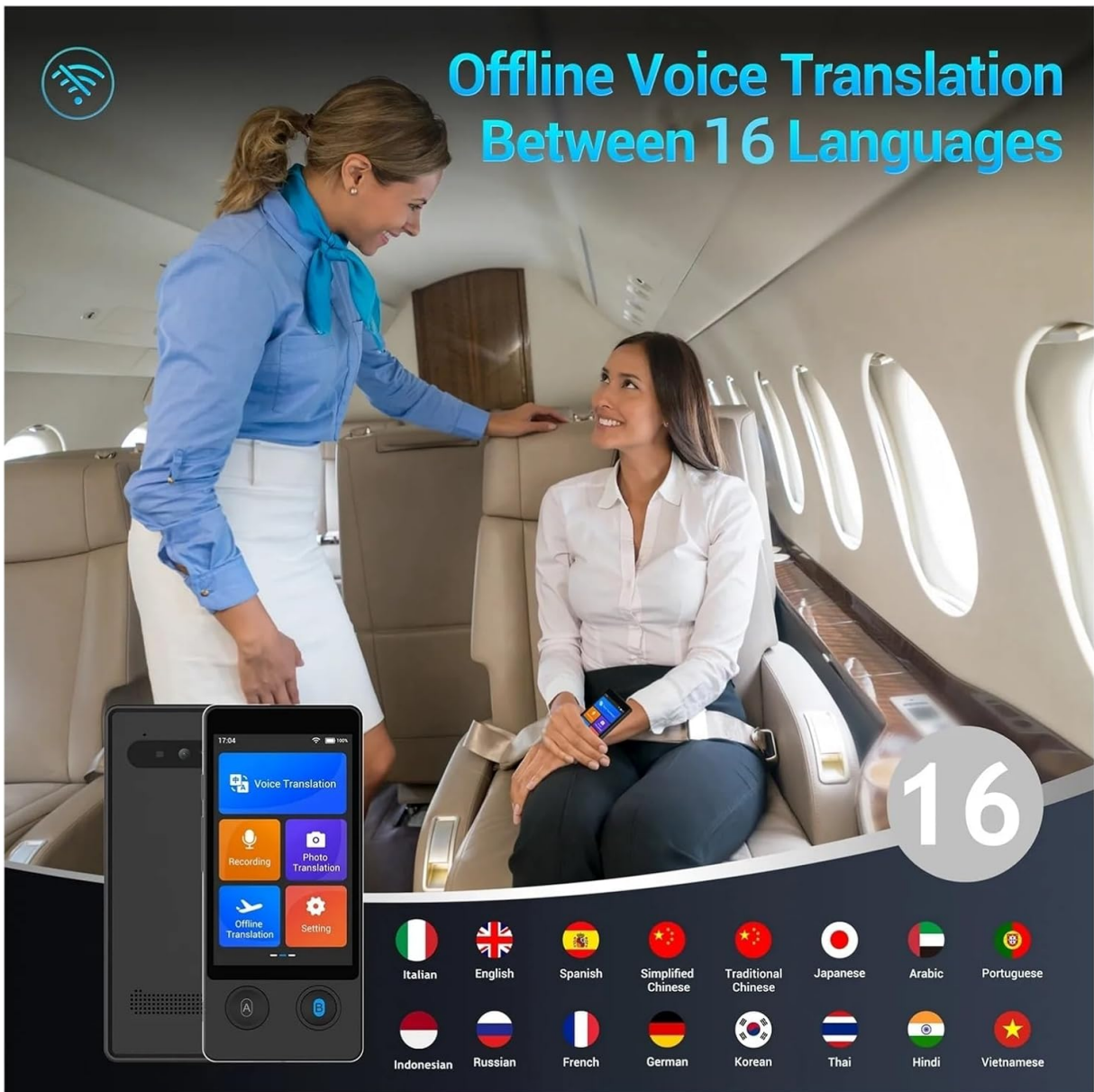
Image: A person using the W12 device for offline voice translation on an airplane, illustrating its utility in environments without internet access. The image lists 16 supported offline languages.