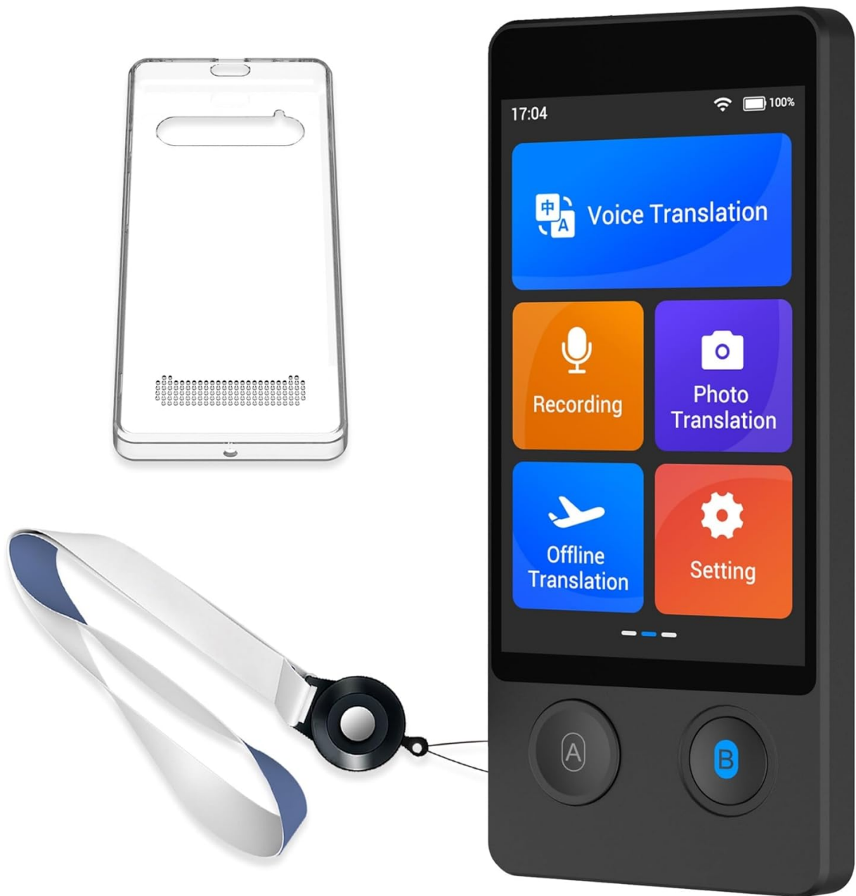
Image: The W12 Language Translator Device shown with its protective case and a lanyard. The device features a touchscreen interface displaying options for Voice Translation, Recording, Photo Translation, Offline Translation, and Settings.