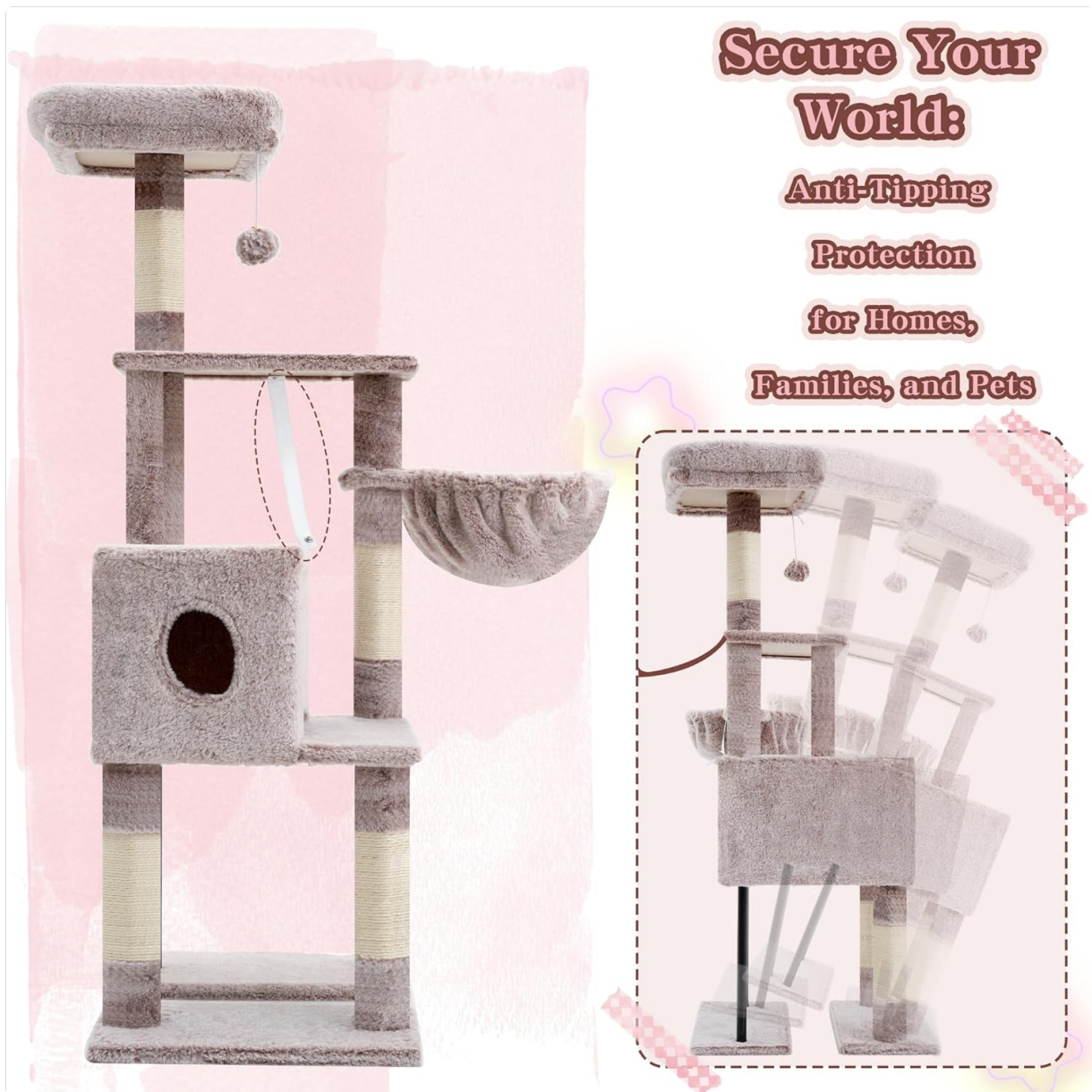
Image 4: A close-up view highlighting the sisal scratching post and the stable metal tubes that reinforce the cat tree's structure.