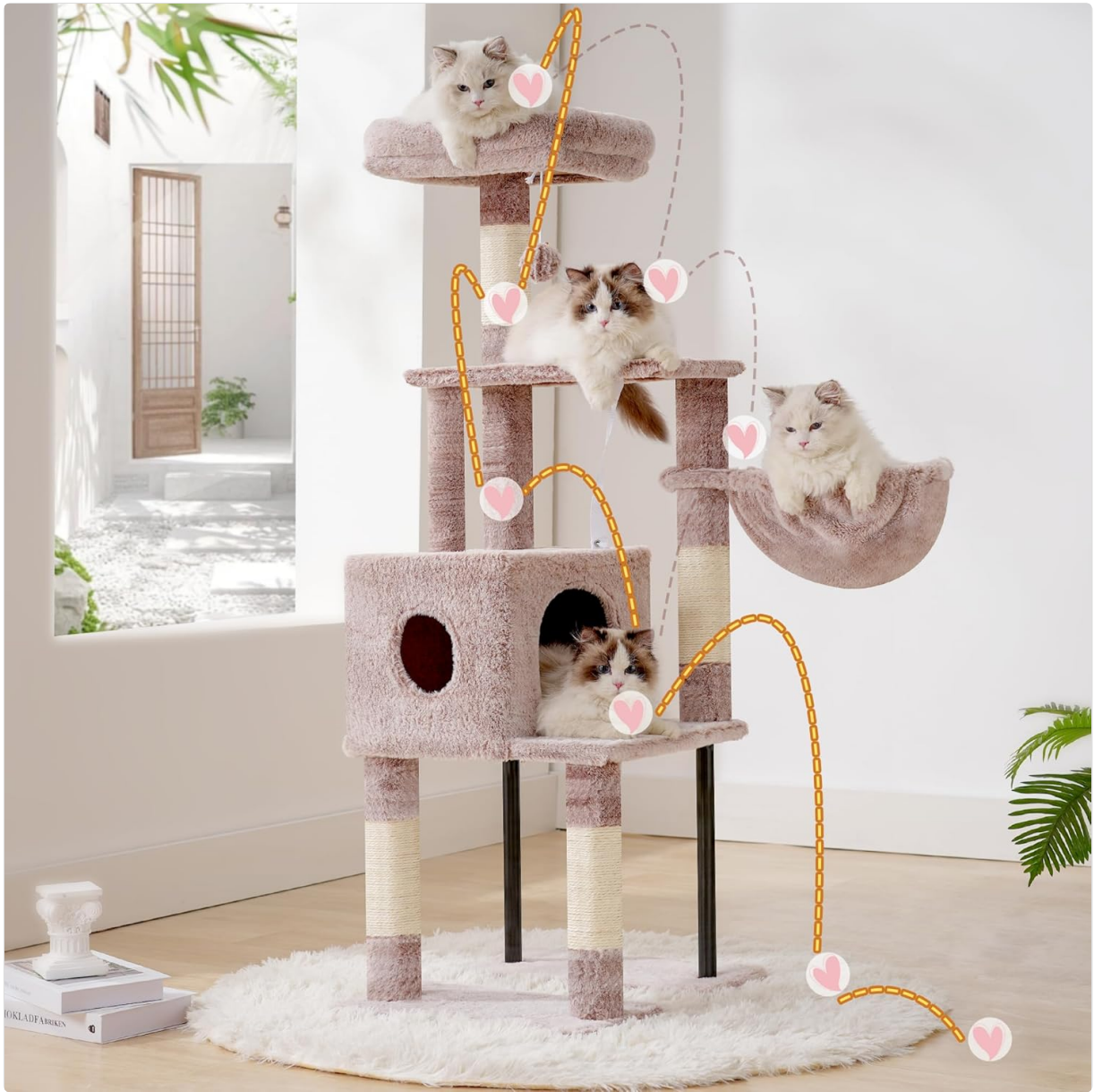
Image 5: A cat comfortably positioned on the highest platform, illustrating its use as a lookout point.