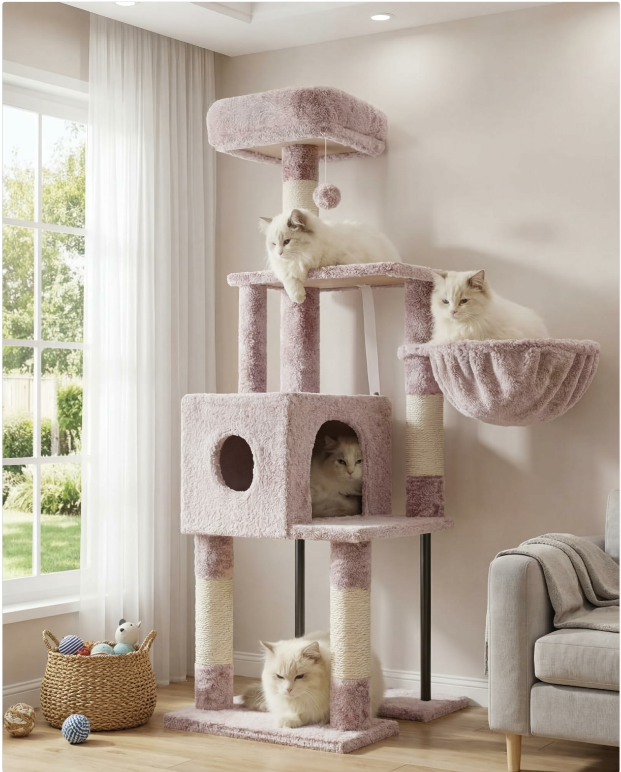
Image 1: The Heybly HCT200SMU Cat Tree, showcasing its multi-level design and various features, with cats resting on platforms and inside the condo.