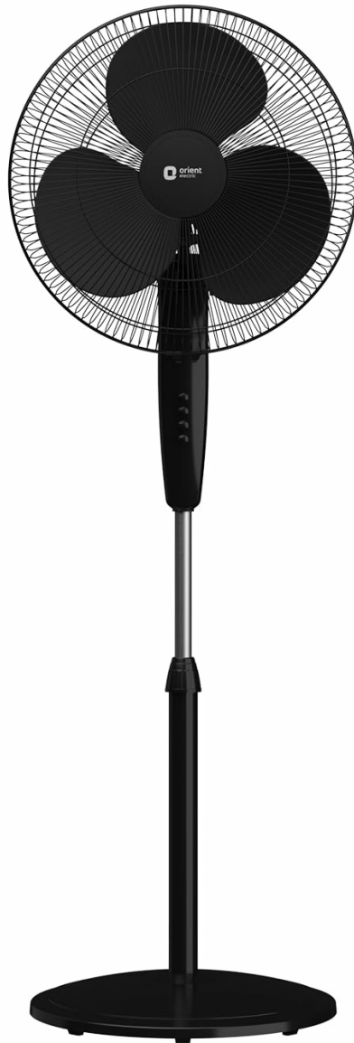
Image: The Orient Electric Stand 81 Pedestal Fan in black, showcasing its design and features like speed control and air delivery.