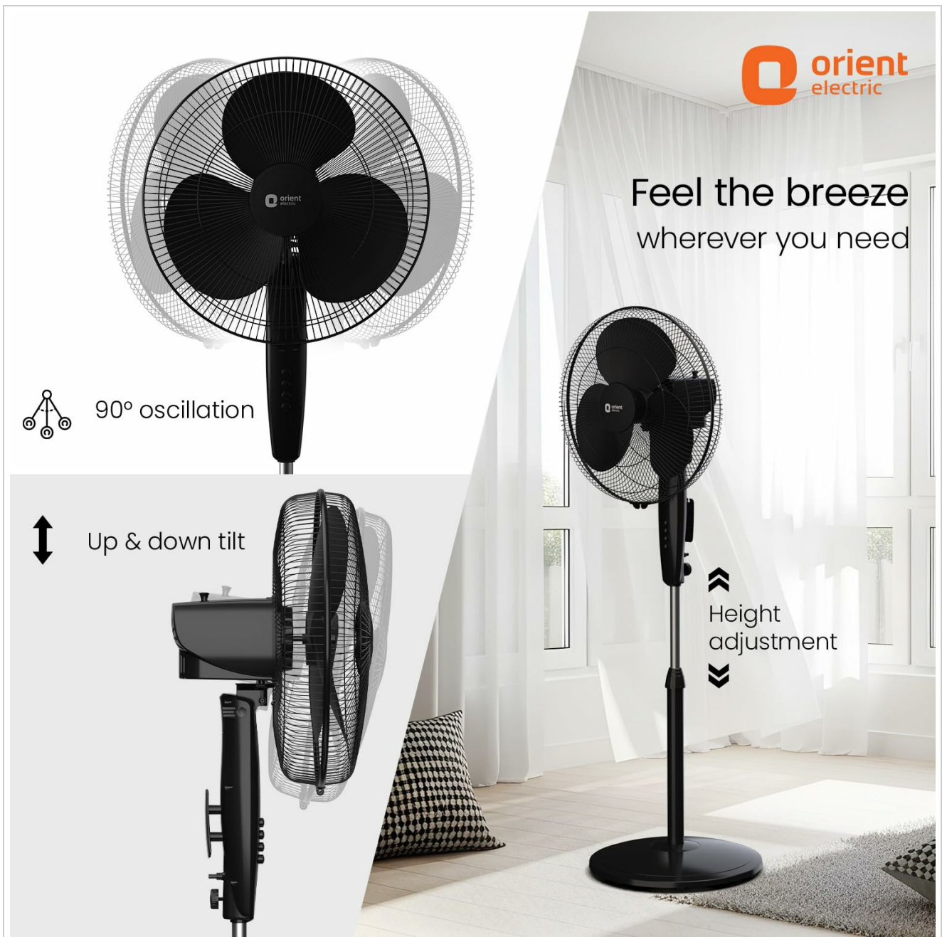
Image: Illustrations demonstrating the 90-degree oscillation, up and down tilt, and adjustable height features of the pedestal fan.