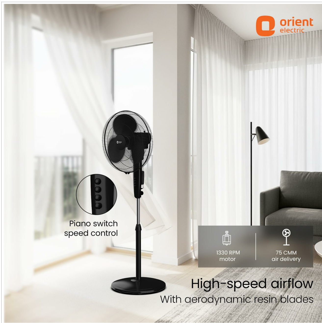
Image: The fan highlighting the piano switch speed control buttons on the main body.