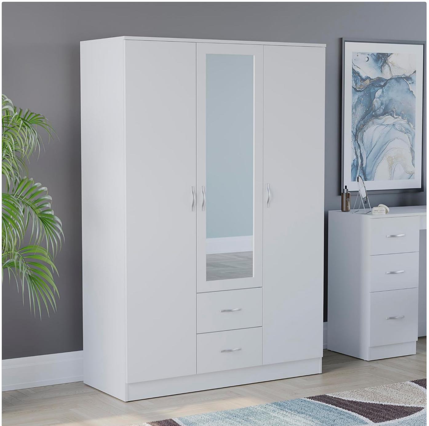
Image: Front view of the Vida Designs Riano 3-Door Mirrored Wardrobe in white, showcasing its three doors, central mirror, and two lower drawers.