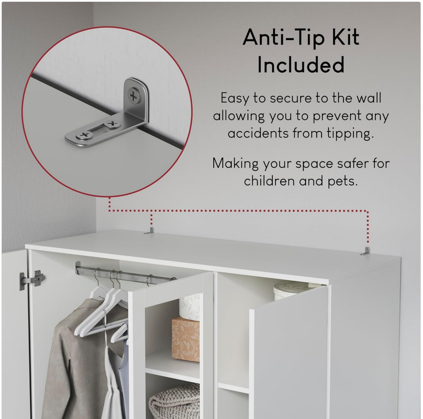
Image: A close-up view illustrating the installation of the anti-tip bracket, showing it securely fastened to the top panel of the wardrobe and ready to be attached to a wall. This kit is crucial for stability and safety.

Making your space safer for children and pets.