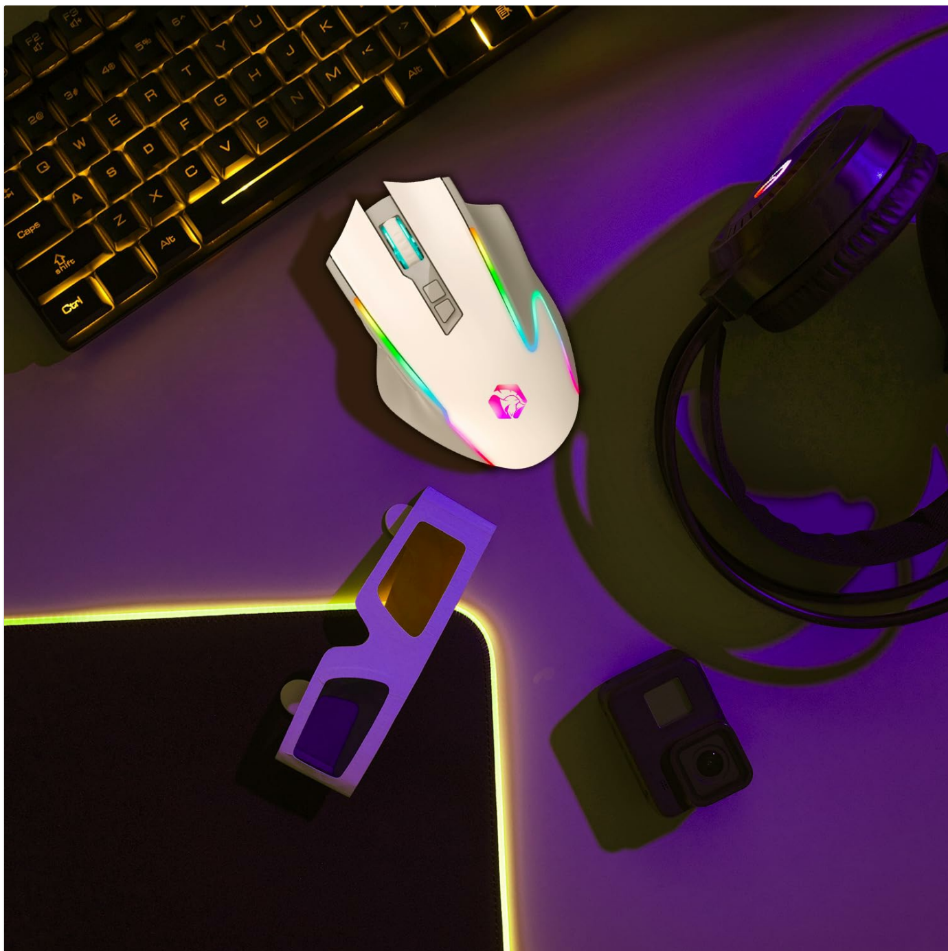
Image 5.1: Rear view of the RF908 mouse, showcasing its customizable RGB backlighting.