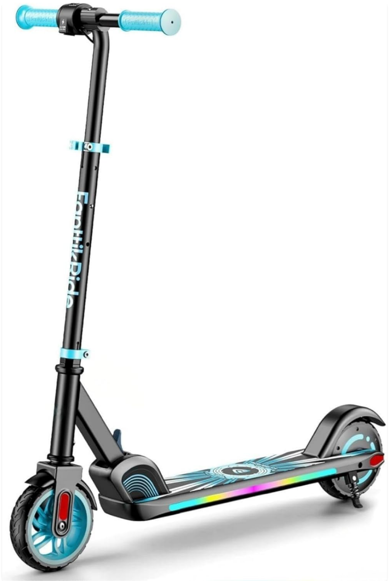
Figure 1: FanttikRide C9 Apex Electric Scooter