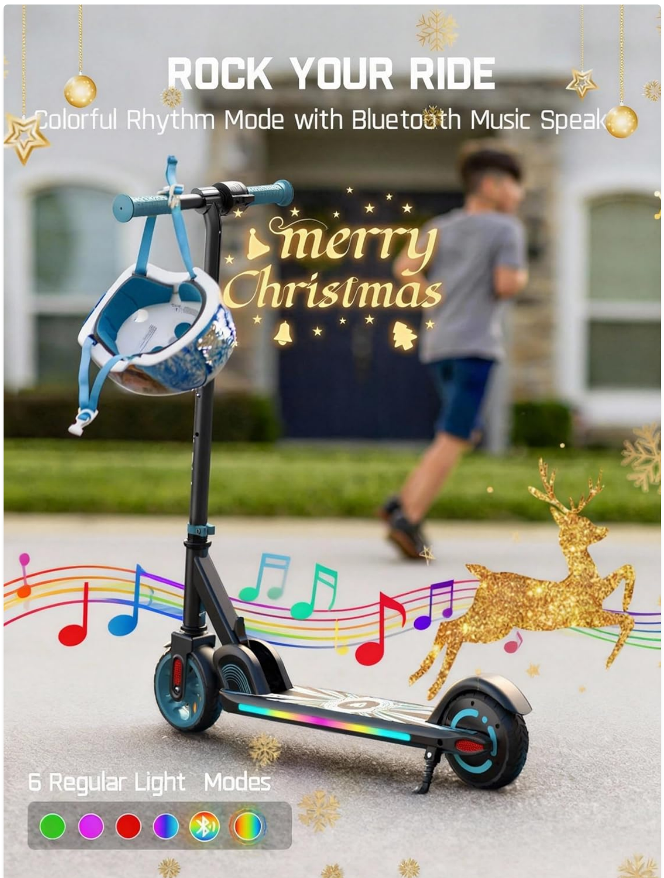
Figure 3: Scooter with active lights and music feature.