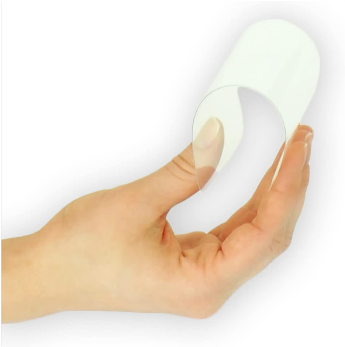
Image: A hand gently bending the brotect AirGlass screen protector, highlighting its flexible glass characteristic.