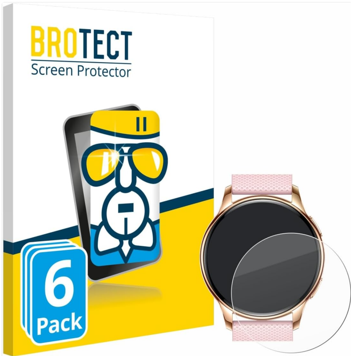
Image: brotect AirGlass Screen Protector packaging, showing a 6-pack label and a screen protector next to a smartwatch, indicating compatibility.