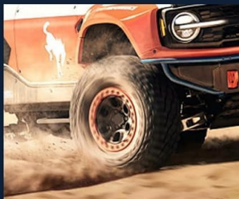
OFF-ROAD VEHICLE WHEELS