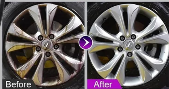
Image: A tire and wheel with a "Before" and "After" comparison, illustrating the safe and effective cleaning formula.

Suitable for exterior components and interior trim. The perfectly tuned formula makes it easier than ever to clean your engine, tires, carpets, truck bed and suspension parts!