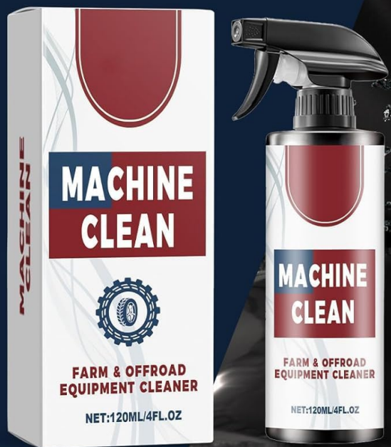
Image: The Machine Clean product bottle shown with a clean vehicle wheel, highlighting its application.