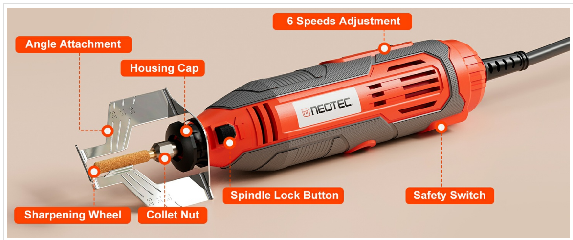
Figure 4: Visual guide for sharpener assembly.