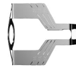
Figure 2: All components included in the NEOTEC Electric Chainsaw Sharpener Kit.