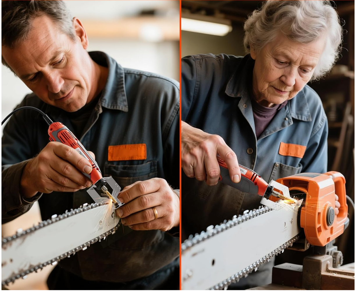
Figure 6: On-saw sharpening in progress, highlighting ease of use.

Your browser does not support the video tag.