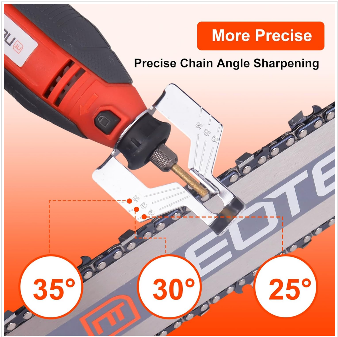
Figure 5: Precise angle adjustment for optimal sharpening.