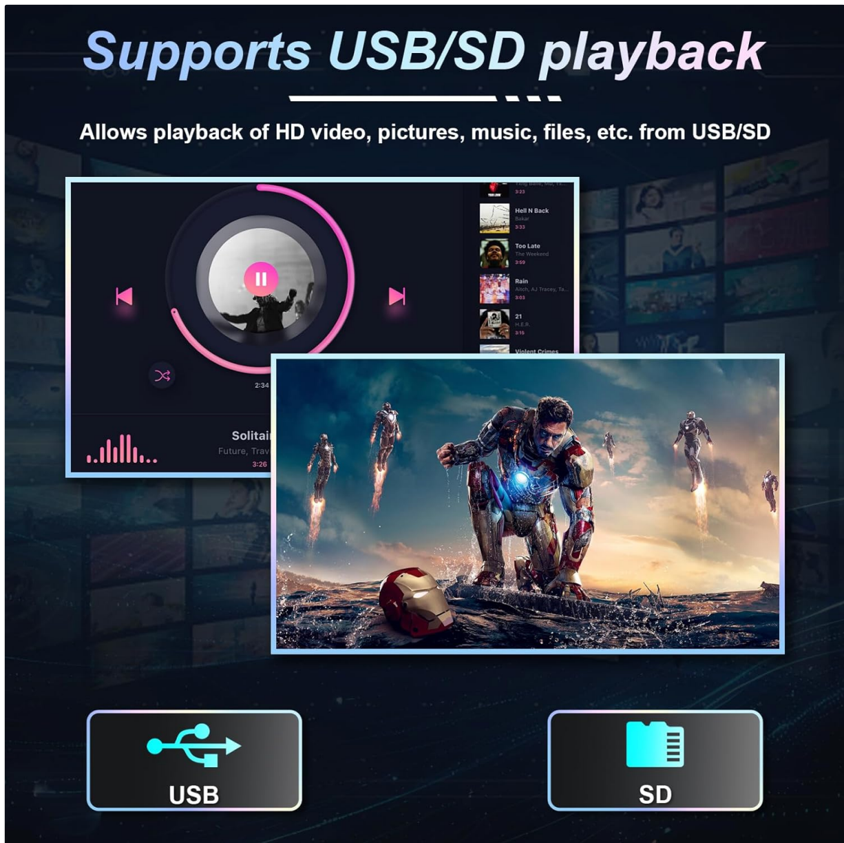
Image 3.3: Illustration of USB and SD card media playback capabilities.

The unit supports playback of various media files (HD video, pictures, music) from USB drives and SD cards.