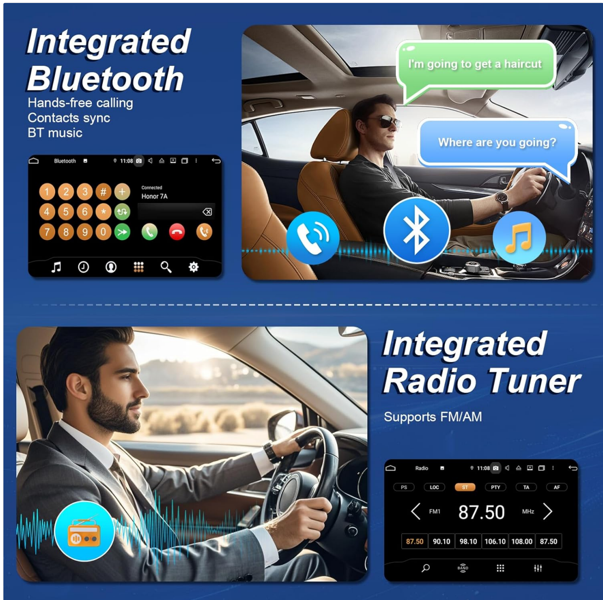
Image 3.2: Display showing Bluetooth interface for calls and music, and the radio tuner interface.

The device includes integrated Bluetooth for hands-free calling and wireless audio streaming.