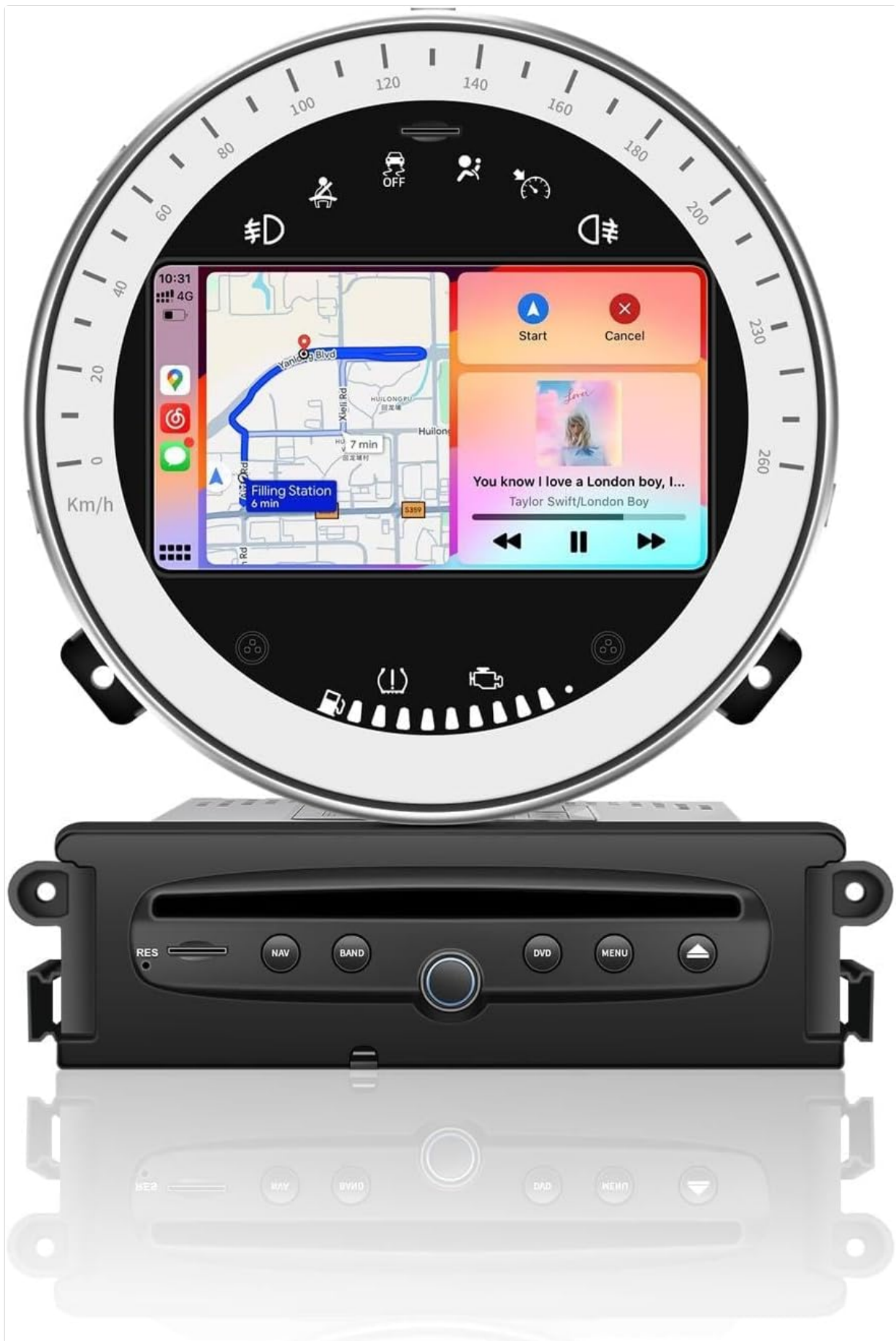
Image 1.1: The NUOTIAN 7-Inch CarPlay Display unit and its accompanying head unit.