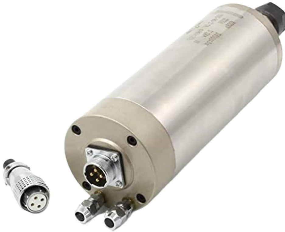
Figure 3.1: The AJDFVHJF GDZ-80-2.2B Water Cooled Spindle Motor, showing the main body and the detachable 4-pin aviation connector for power and control signals.