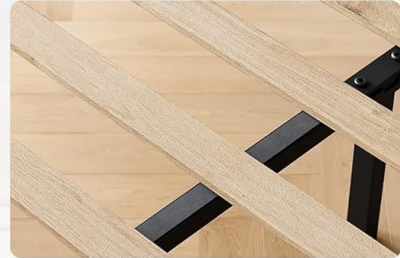
Durable Wooden Slats