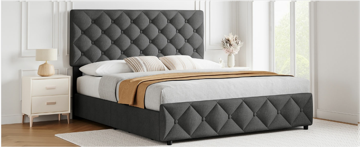
Image: Overview of the IDEALHOUSE Full Size Bed Frame with all components and key dimensions.