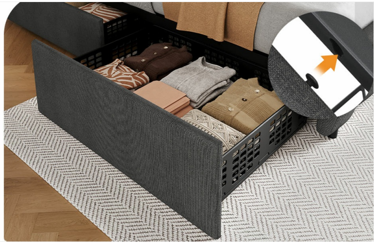
Image: Illustration of the drawer fixture design, showing how a small screw aligns to prevent the drawer from slipping out.

Each drawer comes with a small screw,aligning with the hole to prevent from slipping out.