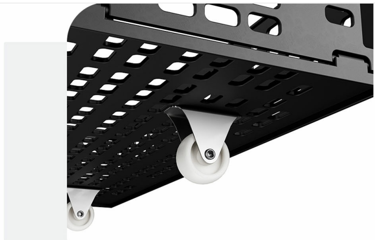
Image: Detail of the functional heavy-duty wheels on the storage drawers.

Each drawer was equipped with 4 heavy-duty wheels, can easily to slide in and out, offering strong support for the drawers.