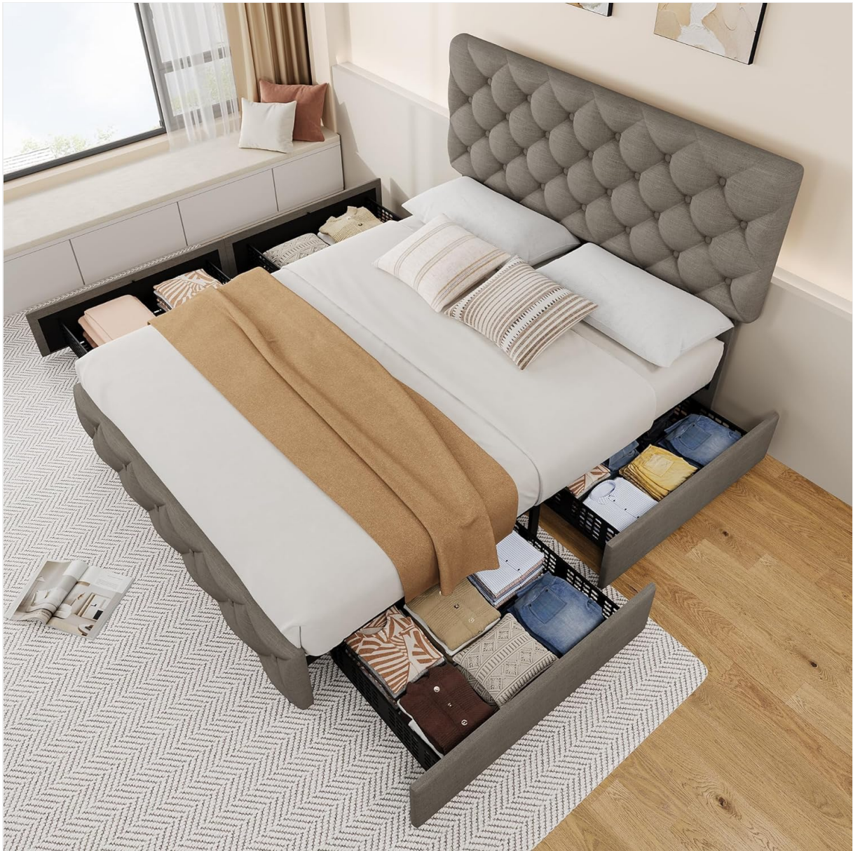
Image: The bed frame with all four storage drawers extended, demonstrating ample storage space for various items.