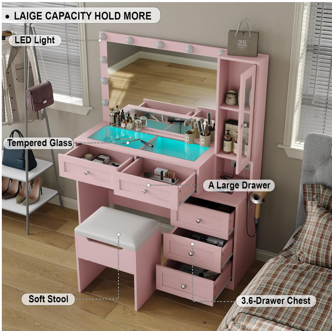
Image 3.1: An overview of the vanity desk's components, including drawers, tempered glass top, LED light mirror, and soft stool.