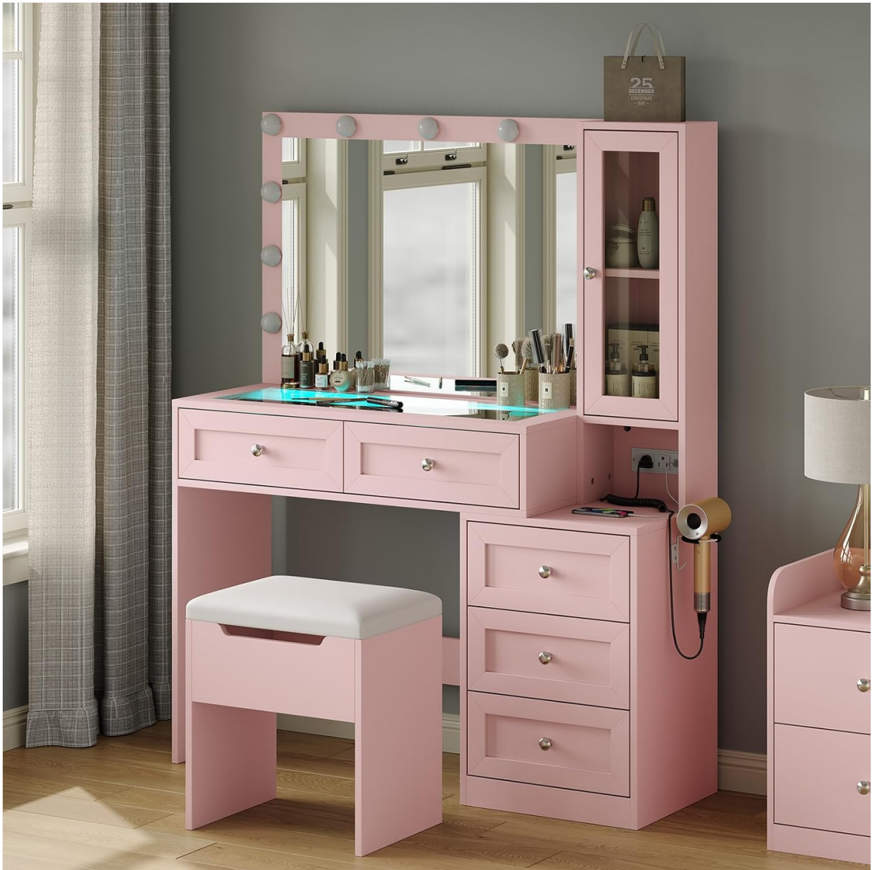
Image 1.1: The CollaredEagle Pink 43-inch Vanity Desk, showcasing its mirror, drawers, and included stool.