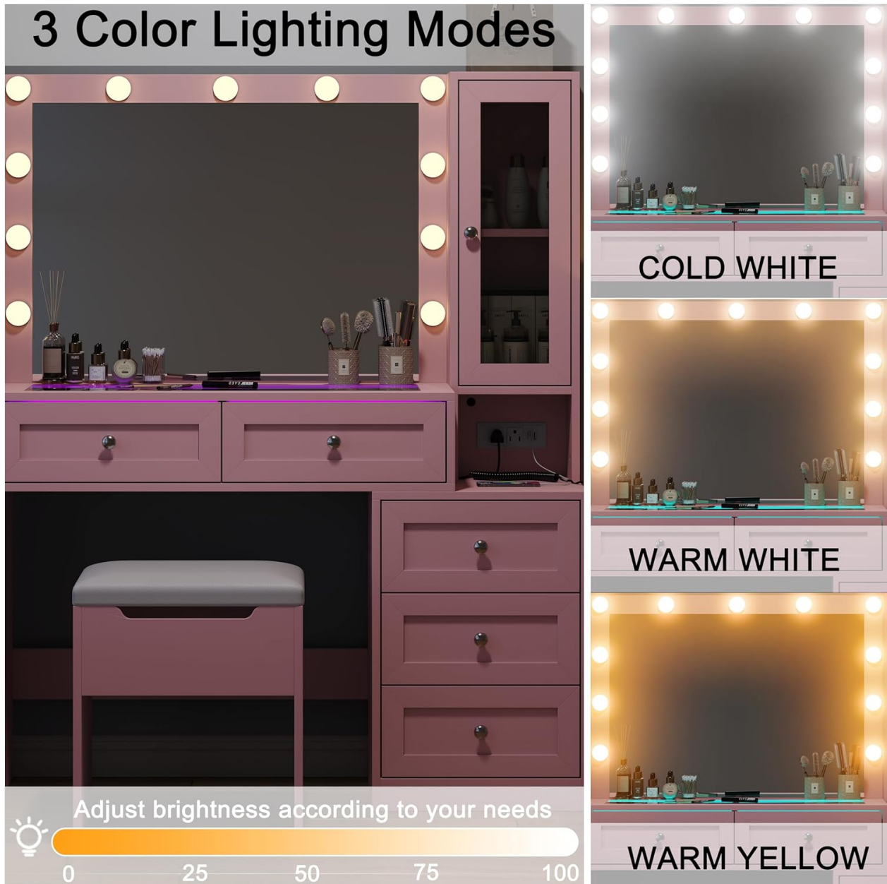
Image 4.1: Illustration of the three adjustable color lighting modes for the mirror.