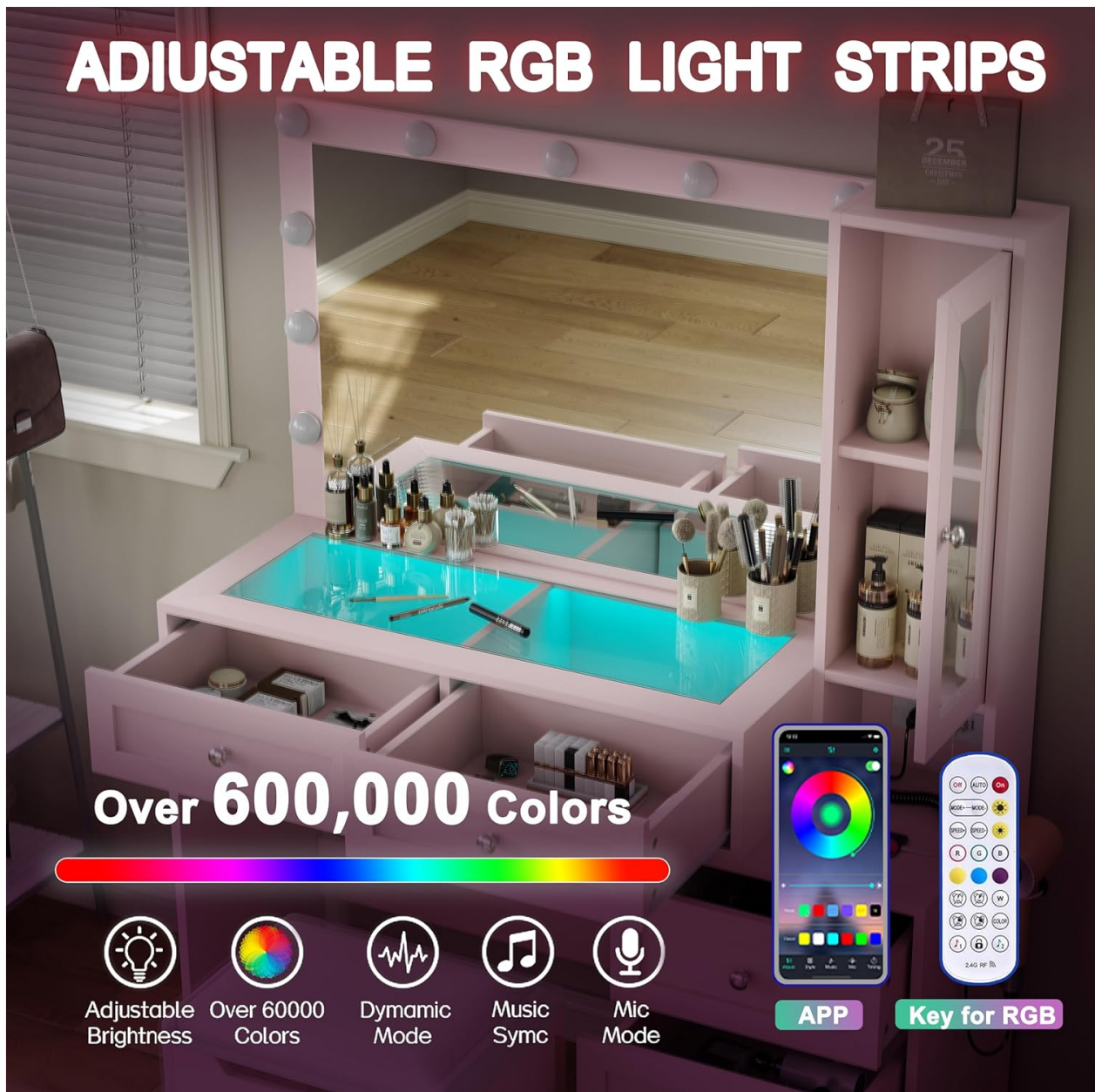
Image 4.2: The RGB light strips within the drawers, demonstrating control options via app and remote.