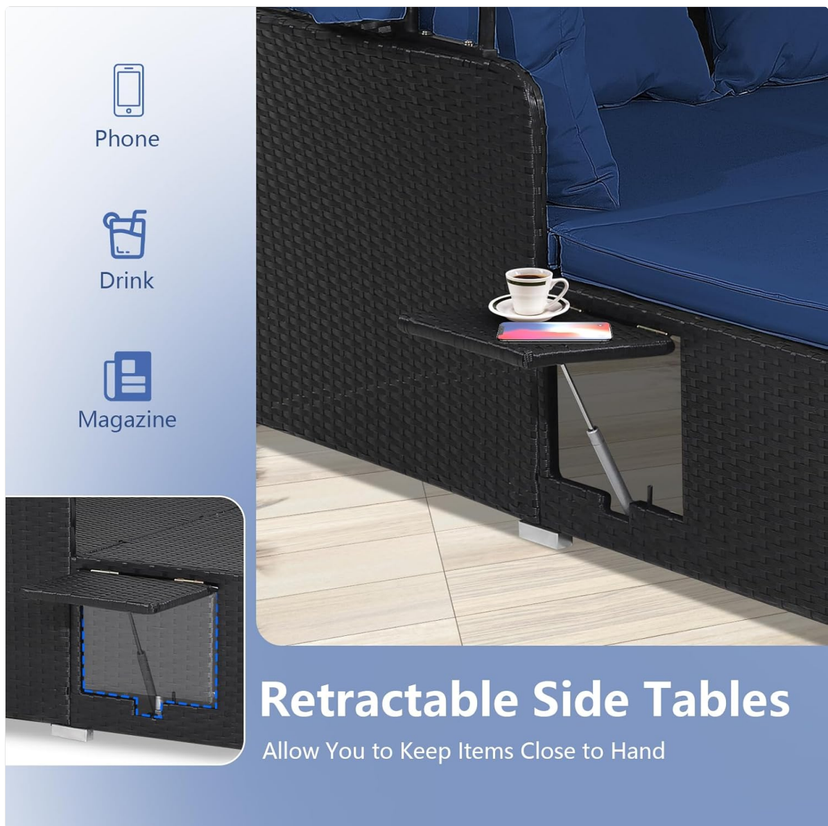
Figure 2: Retractable Side Tables. This image demonstrates the functionality of the side tables, which can be extended to hold items like phones, drinks, or magazines, and shows the internal pneumatic rod mechanism.