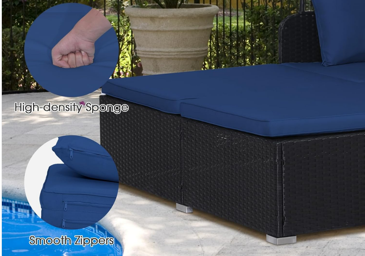
Figure 4: Cushions Detail. This image provides a close-up of the daybed's cushions, emphasizing the high-density sponge for comfort and the smooth zippers for easy cover removal and cleaning.

Due to the light avoidance and light exposure, the color of the cushions is slightly different