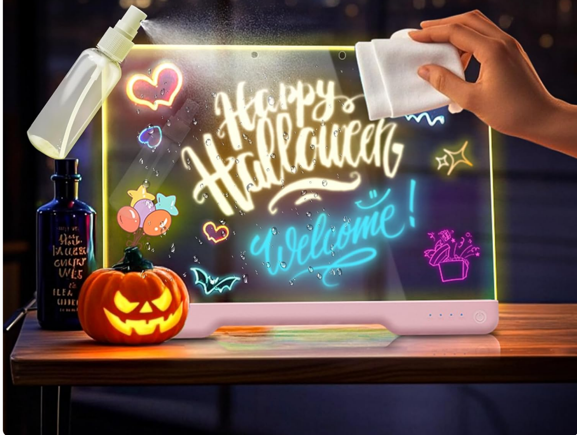
Image: Demonstrating the effortless cleaning process of the LED Note Board.

For drawings left on for over 3 days, lightly spray with water or use a damp paper towel for best results.