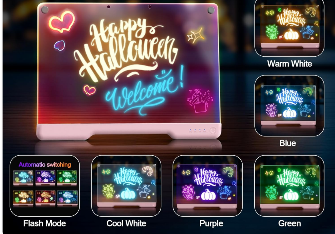
Image: The LED Note Board demonstrating its 7 different light effects.

Long press to power ON/OFF, single press to cycle through light modes