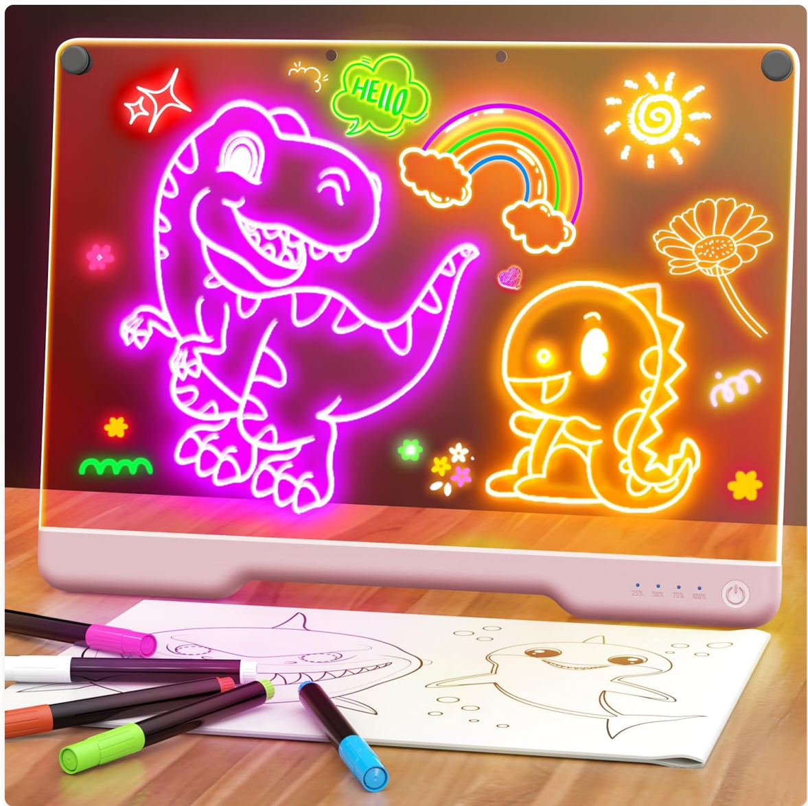
Image: The Geokay 16-Inch Rechargeable Doodle Glow LED Note Board showcasing vibrant, illuminated dinosaur artwork.