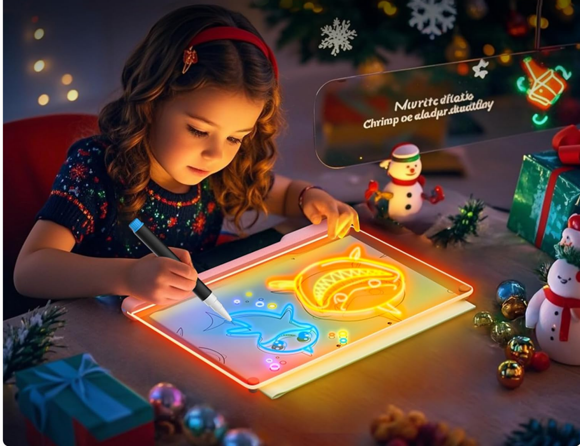
Image: A child using the tracing papers with the LED Note Board.

Tracing book included to inspire kids' imagination and creative doodles