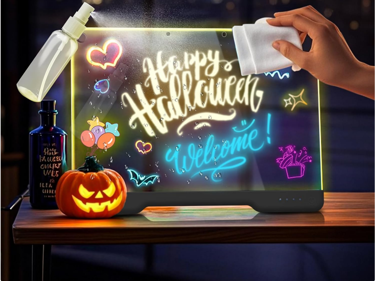
Image: Demonstrates the effortless cleaning process of the LED Note Board using the provided spray bottle and cloth.

For drawings left on for over 3 days, lightly spray with water or use a damp paper towel for best results.