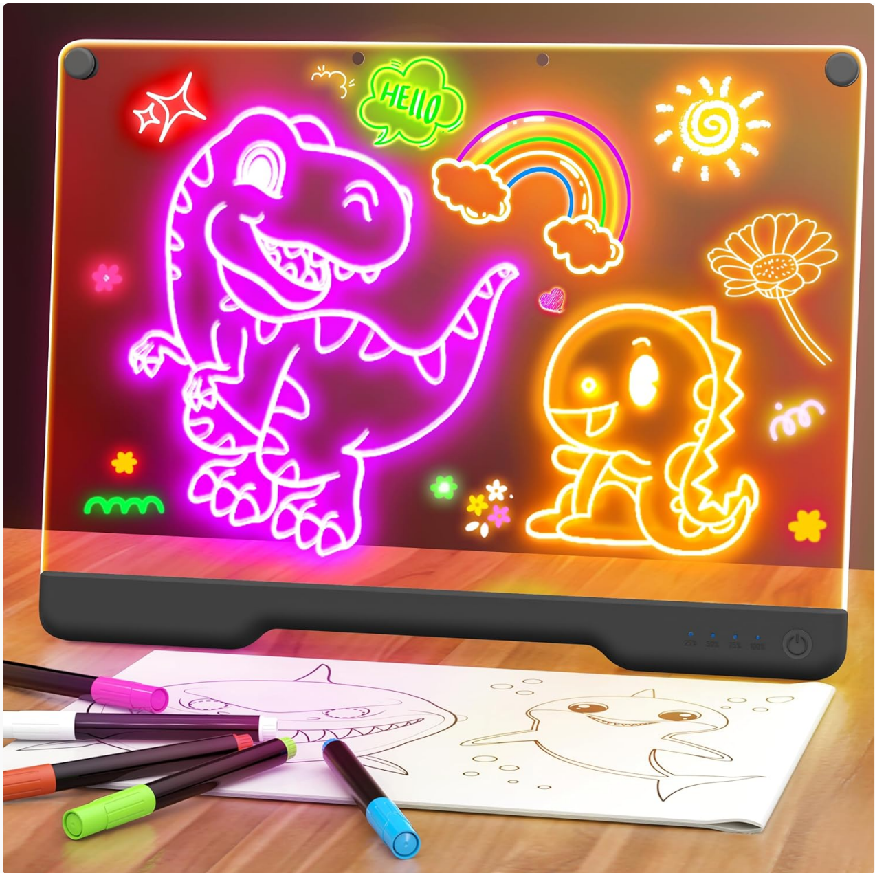
Image: The Geokay 16-Inch Rechargeable Doodle Glow LED Note Board in use, showcasing a vibrant drawing illuminated by its LED lights.