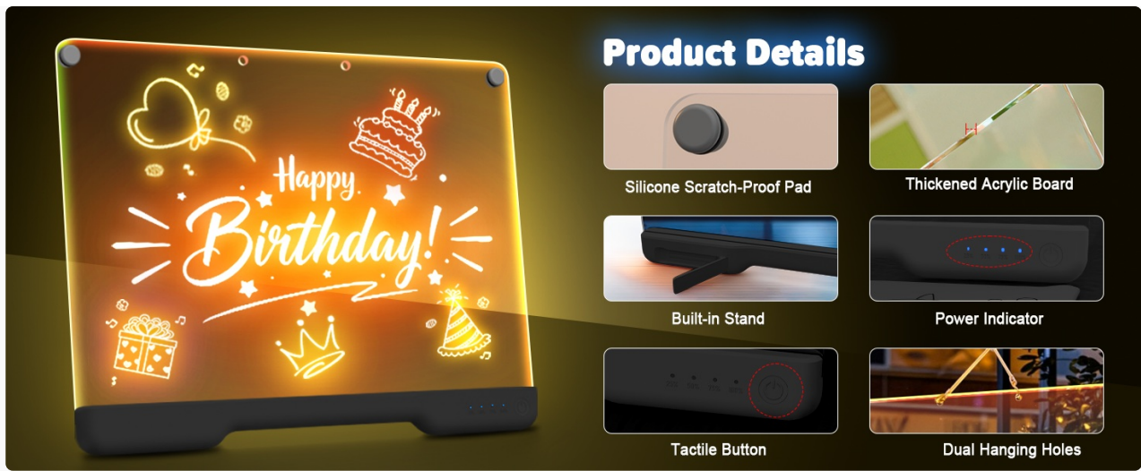
Image: Detailed view of the LED Note Board's base, highlighting the power indicator lights, power button, built-in stand, and hanging holes.