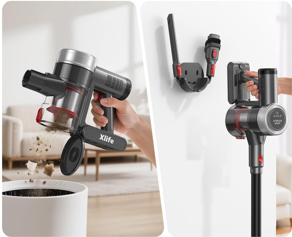
Figure 3: Wall-mounted charging dock and dust cup emptying.

Mess-Free & Space-Saving – Keep Your Home Tidy, Even After Cleaning