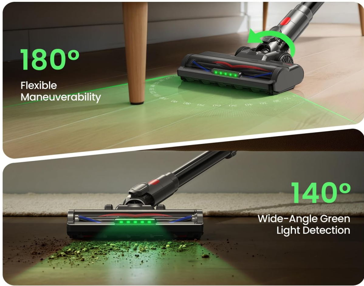
Figure 4: Green light revealing hidden dust under furniture.

140° Wide-Angle Green Light Detection – Finds Dust You Can't See