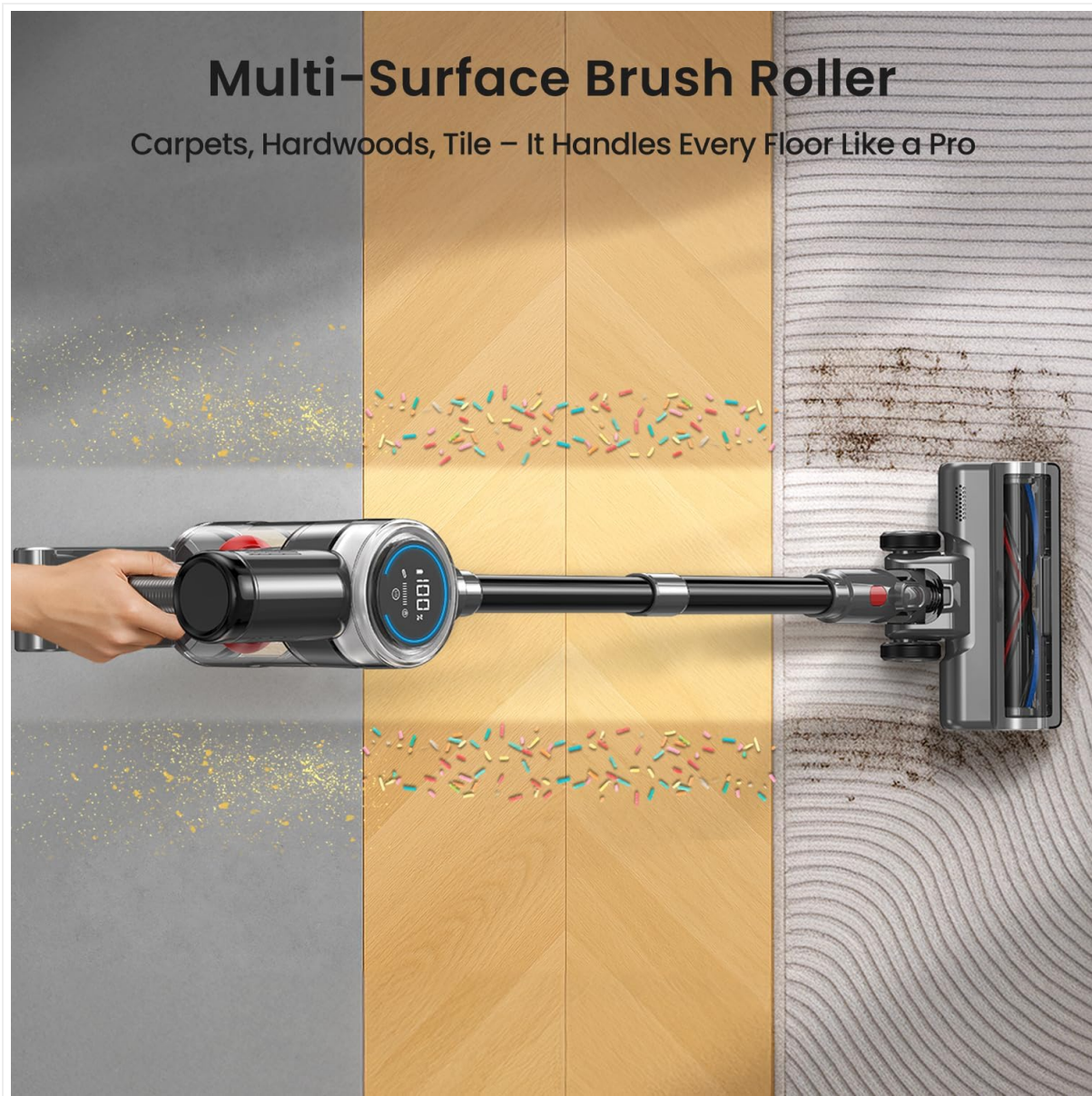
Figure 5: Multi-surface brush roller in action.