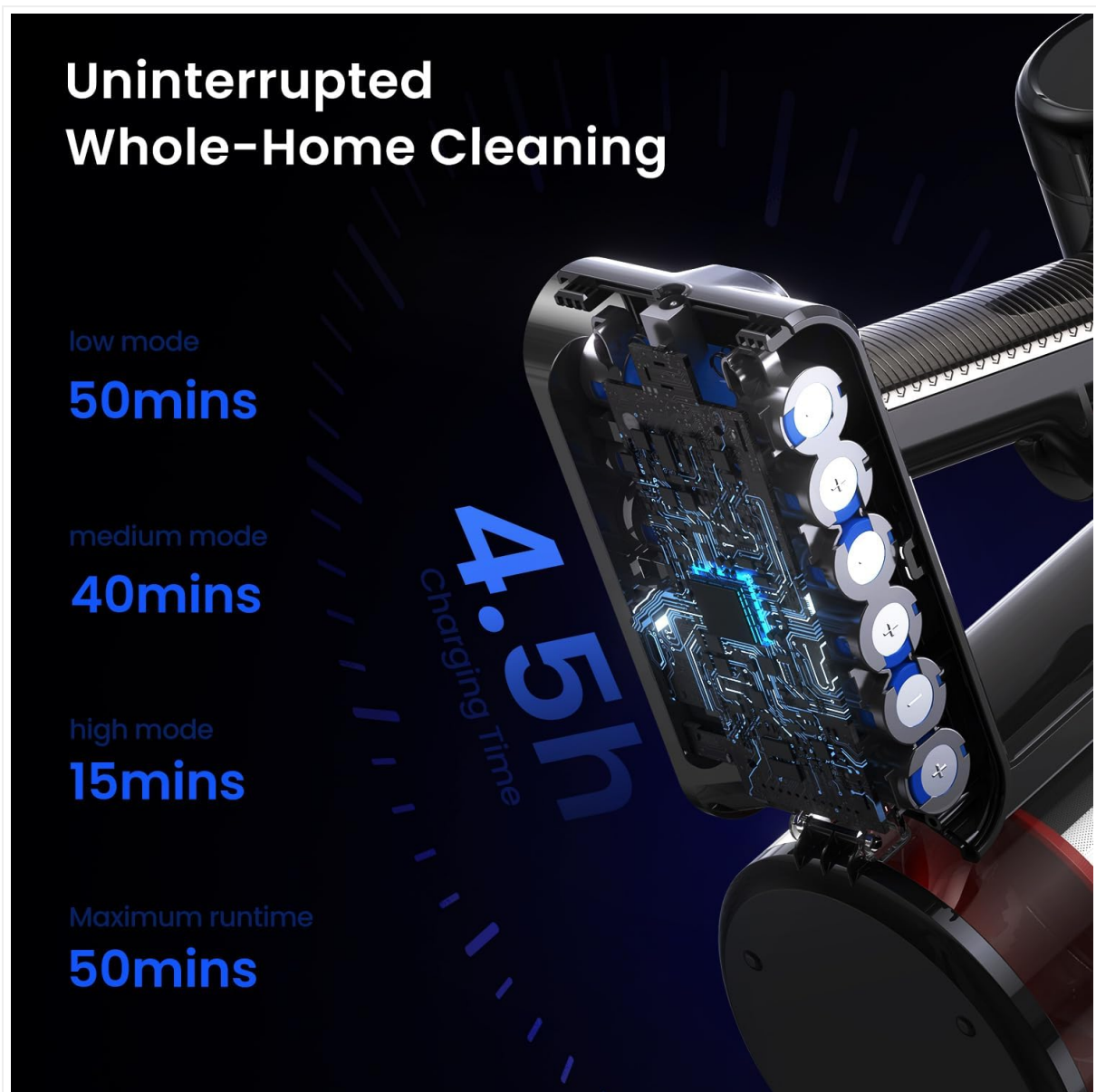
Figure 2: Battery charging and runtime display.