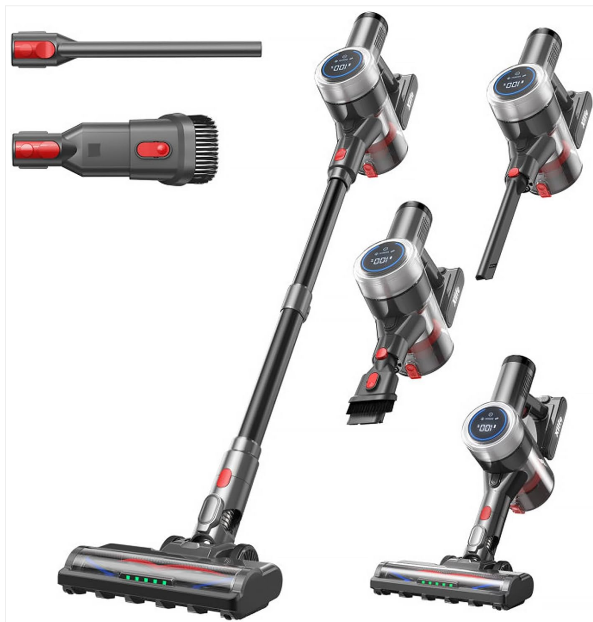
Figure 1: Xlife Cordless Vacuum Cleaner P2 and its included accessories.