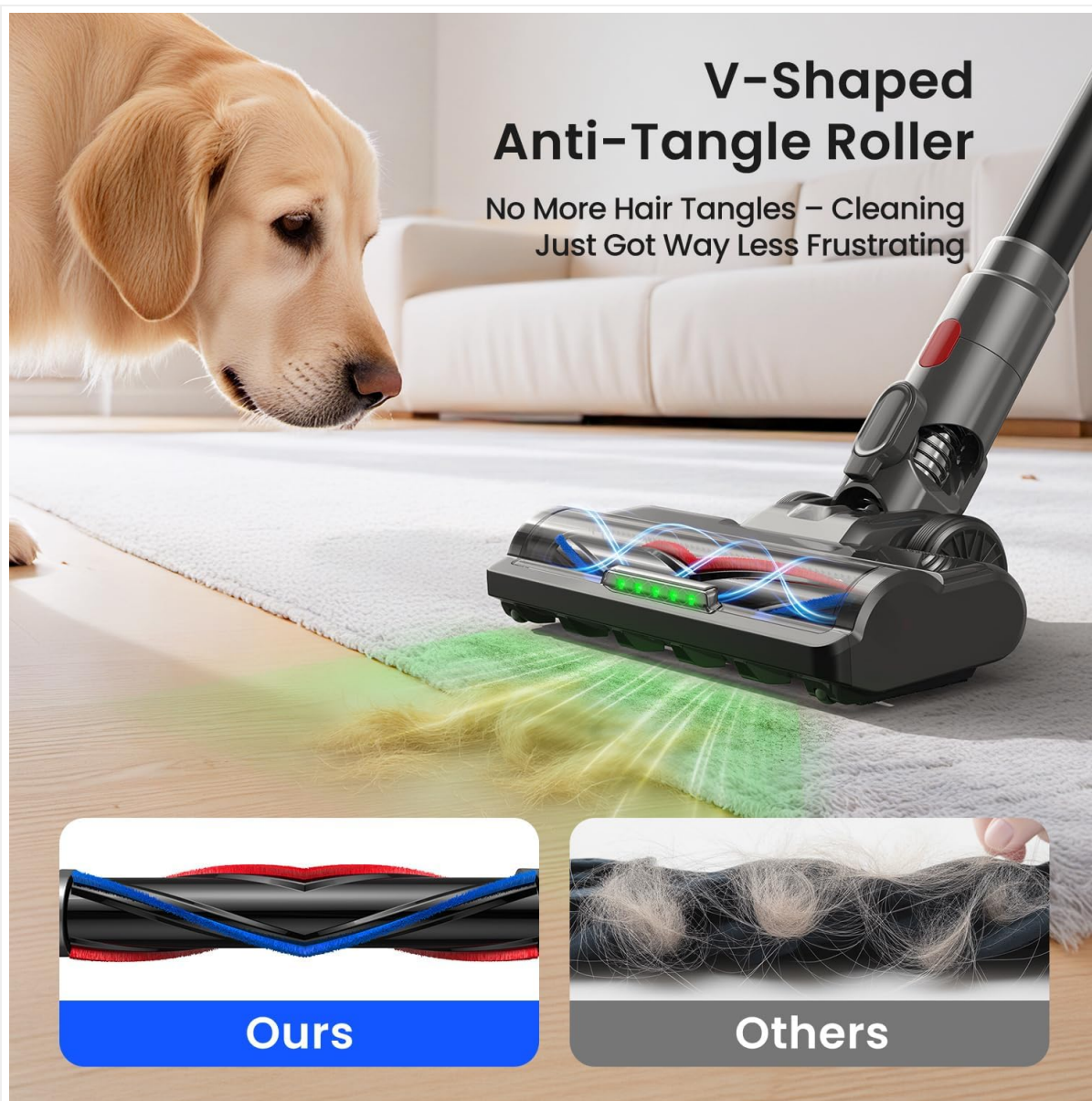
Figure 8: V-shaped anti-tangle roller design.