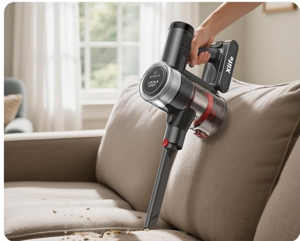
Figure 6: Versatile attachments for various cleaning needs.