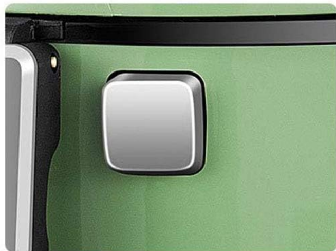
Figure 2: Key components including the transparent visible window, fine hole filter holder, and one-button opening mechanism.