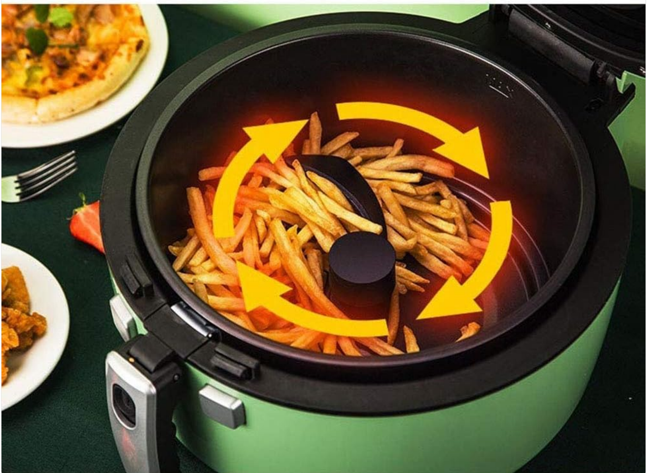
Figure 4: The automatic stirring function ensures even cooking.