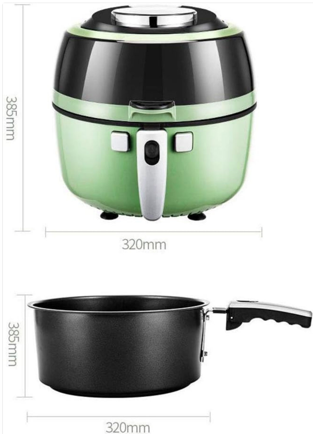
Figure 6: Approximate dimensions of the air fryer and its basket.