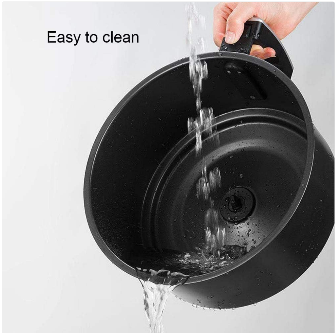
Figure 5: The non-stick basket is designed for easy cleaning.