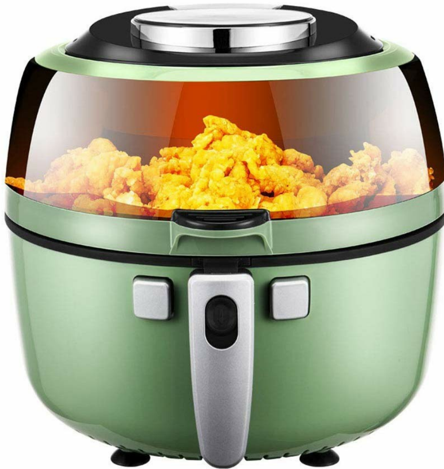
Figure 1: Front view of the Generic 6.5L Air Fryer.

visible window to monitor cooking progress without opening the unit.