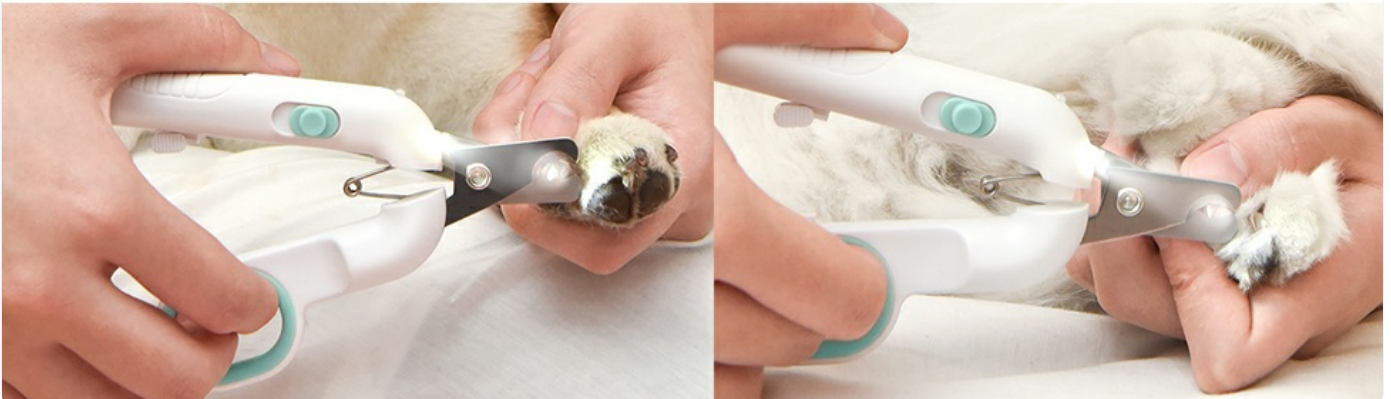
Image: Trimming guidance for various nail colors.