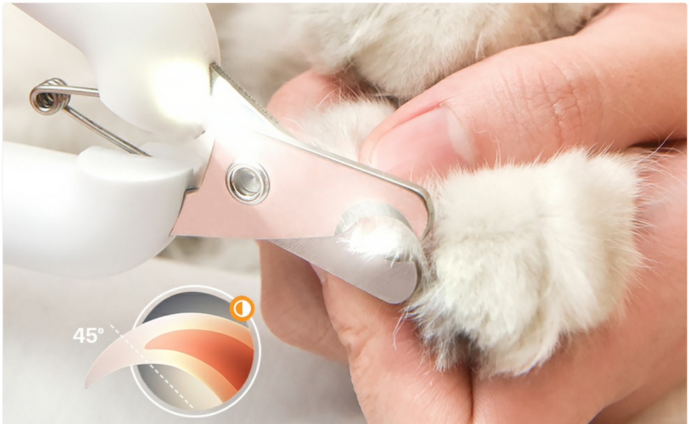
Image: Using the LED light to identify the quick for safe trimming.