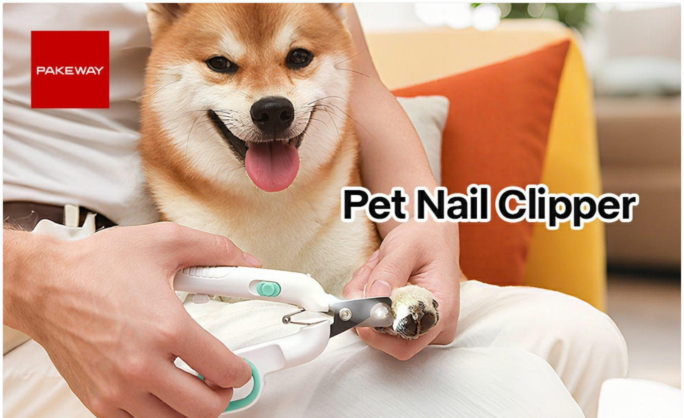
Image: PAKEWAY Dog Nail Clippers, nail file, and packaging.

Thank you for choosing the PAKEWAY Dog Nail Clippers with LED Light. This tool is designed to assist in safely and effectively trimming the nails of small to medium-sized dogs, puppies, cats, and rabbits. The integrated LED light helps illuminate the quick, reducing the risk of injury during grooming. This manual provides essential information for the proper setup, operation, maintenance, and troubleshooting of your nail clippers.