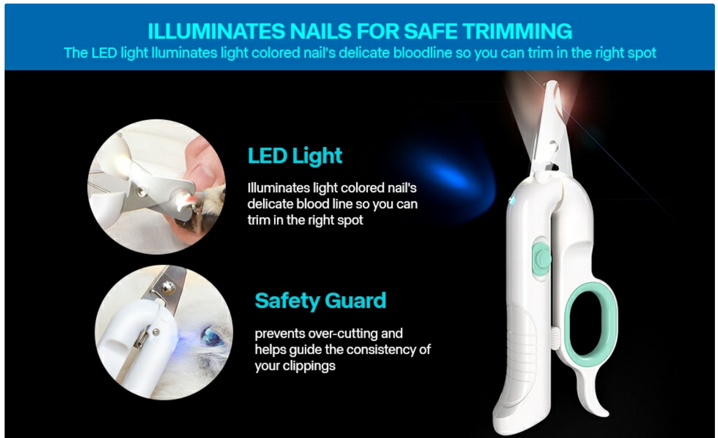
Image: LED Light and Safety Guard features explained.