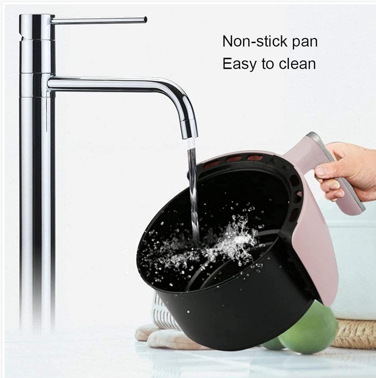
Image 6.1: The non-stick frying pan being cleaned under running water, highlighting its easy-to-clean design.