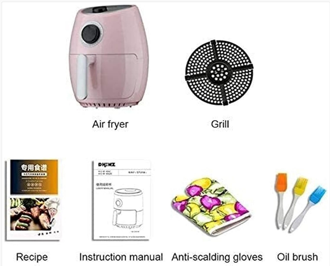
Image 3.2: The complete air fryer package, including the main unit, grill plate, recipe book, instruction manual, anti-scalding gloves, and oil brushes.