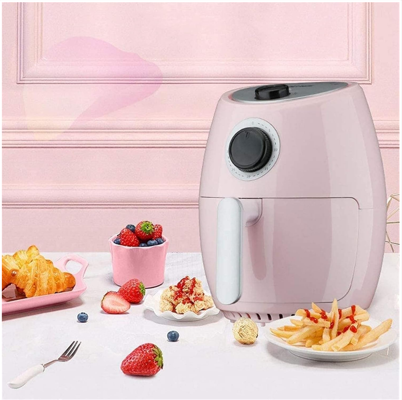
Image 5.2: The air fryer in a kitchen setting, surrounded by various cooked items such as croissants, french fries, and fresh berries, demonstrating its versatility.