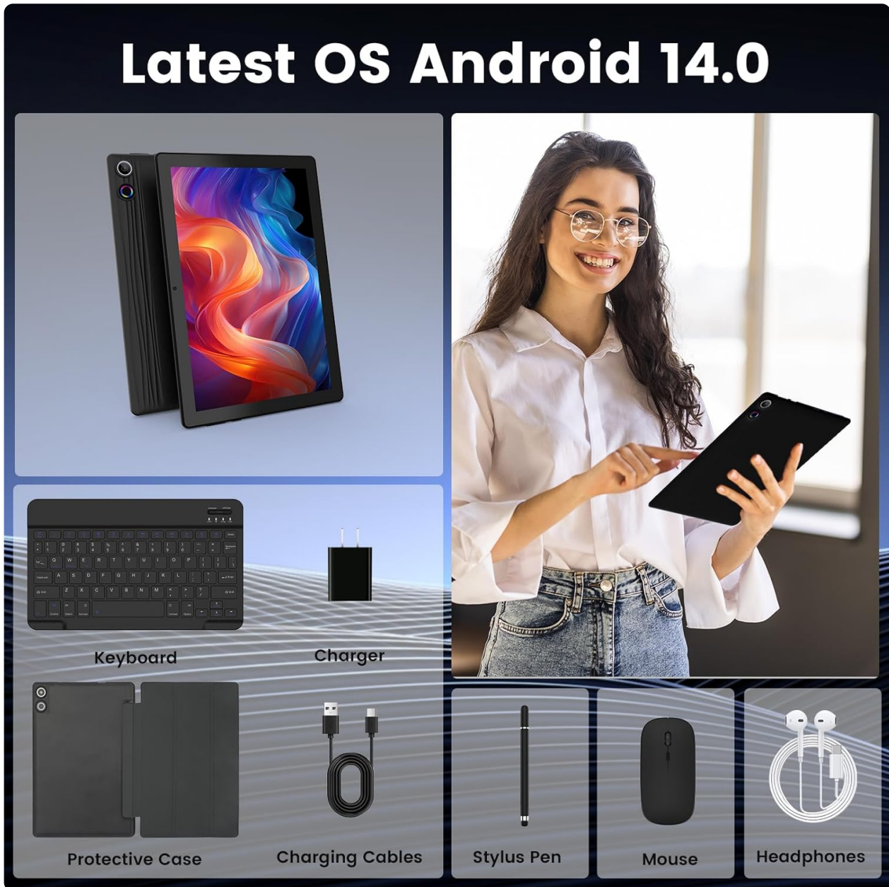
Image 2.1: All accessories included with the HiGrace A7L Tablet, neatly arranged.