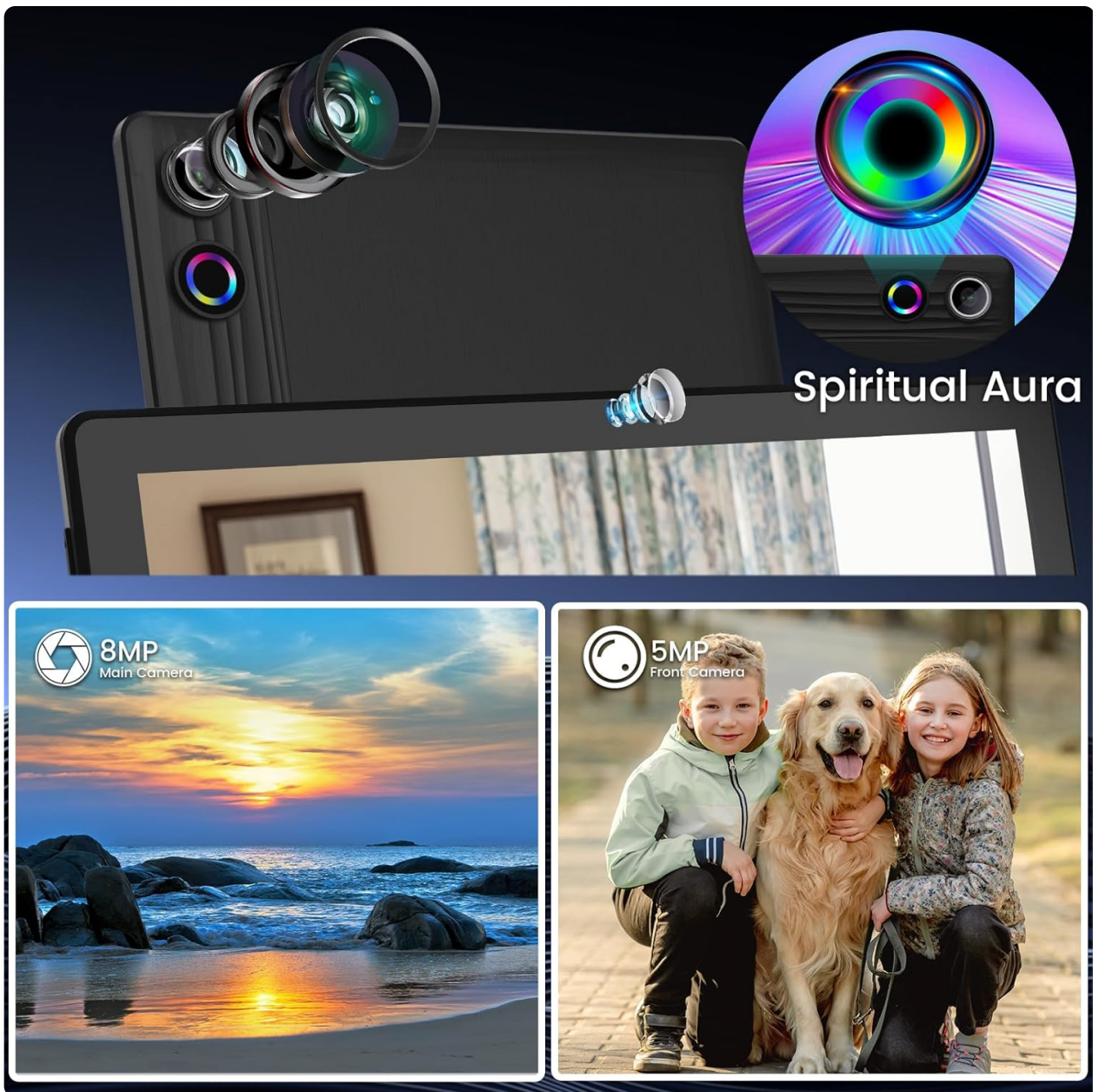
Image 5.4: Details of the tablet's 8MP main camera and 5MP front camera.