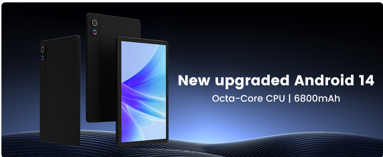
Image 1.1: HiGrace A7L Tablet highlighting Android 14, Octa-Core CPU, and 6800mAh battery capacity.

This manual provides essential information for the proper use and maintenance of your HiGrace 11-inch Android 14 Tablet, Model A7L. Please read this guide thoroughly before operating the device to ensure optimal performance and longevity.