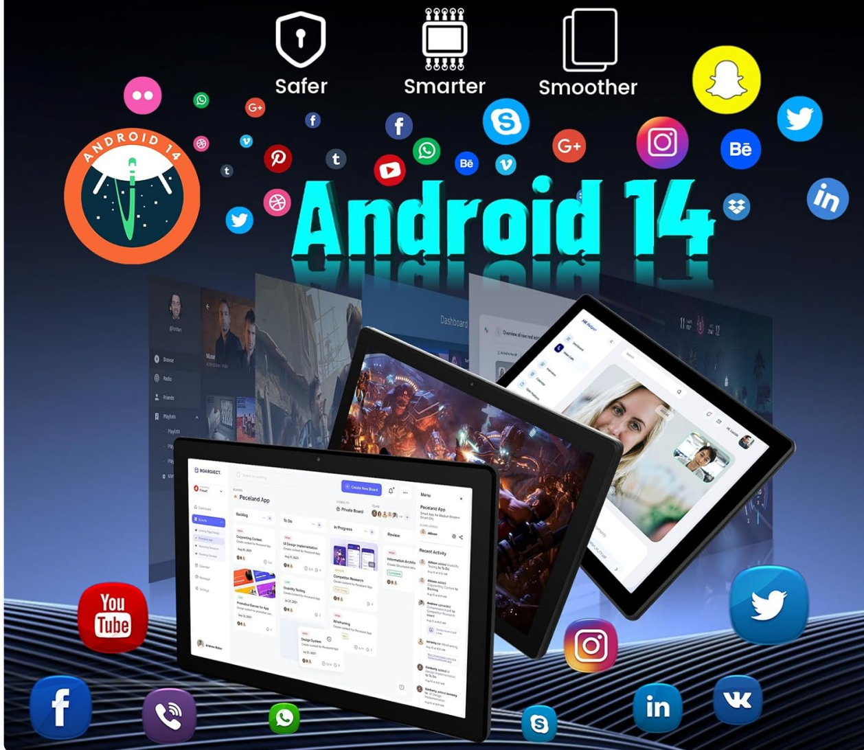
Image 5.1: The Android 14 operating system interface on the tablet screen.