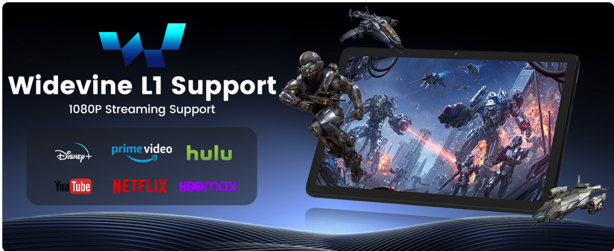
Image 5.3: Widevine L1 support for high-definition streaming on popular platforms.

The 11-inch display with 1280x800 resolution provides clear visuals. With Widevine L1 certification, the tablet supports smooth HD video playback from streaming services such as Netflix, Disney+, Prime Video, Hulu, and YouTube.