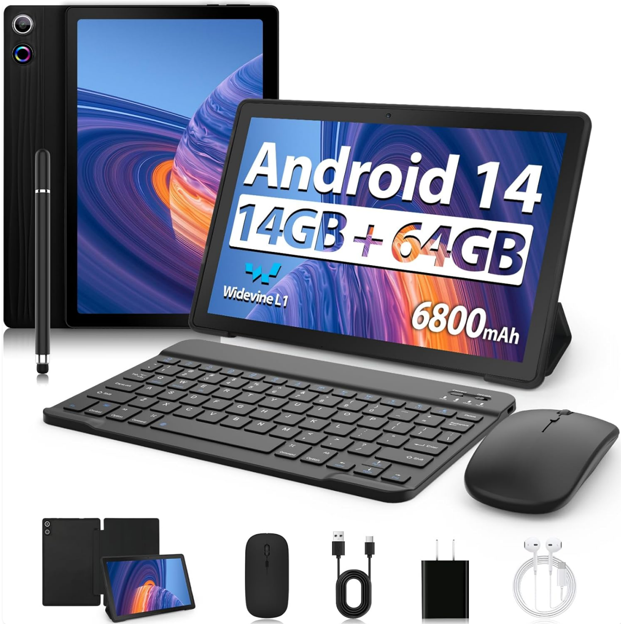
Image 3.1: Front view of the HiGrace A7L Tablet with keyboard and mouse, and a rear view of the tablet.