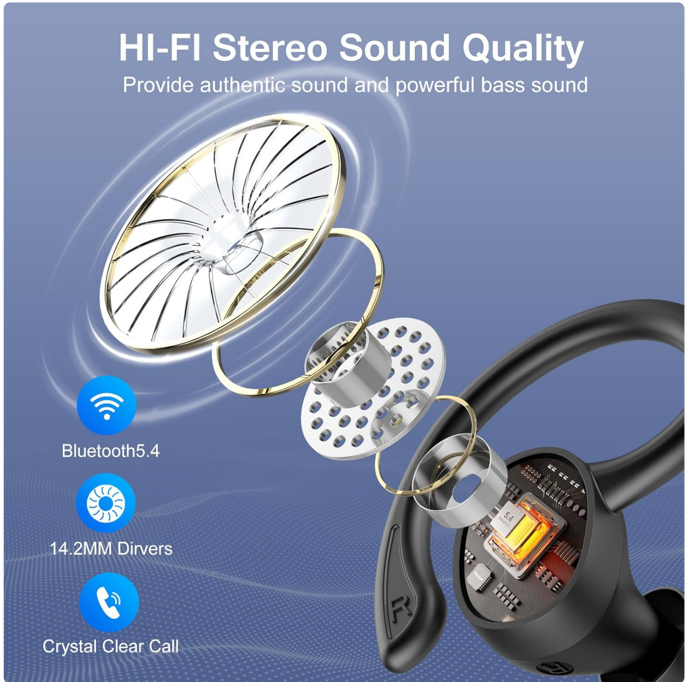
Image: An exploded view of the earbud's internal components, highlighting the 14.2mm drivers and the Bluetooth 5.4 chip, emphasizing HI-FI Stereo Sound Quality and Crystal Clear Call capabilities.

Provide authentic sound and powerful bass sound