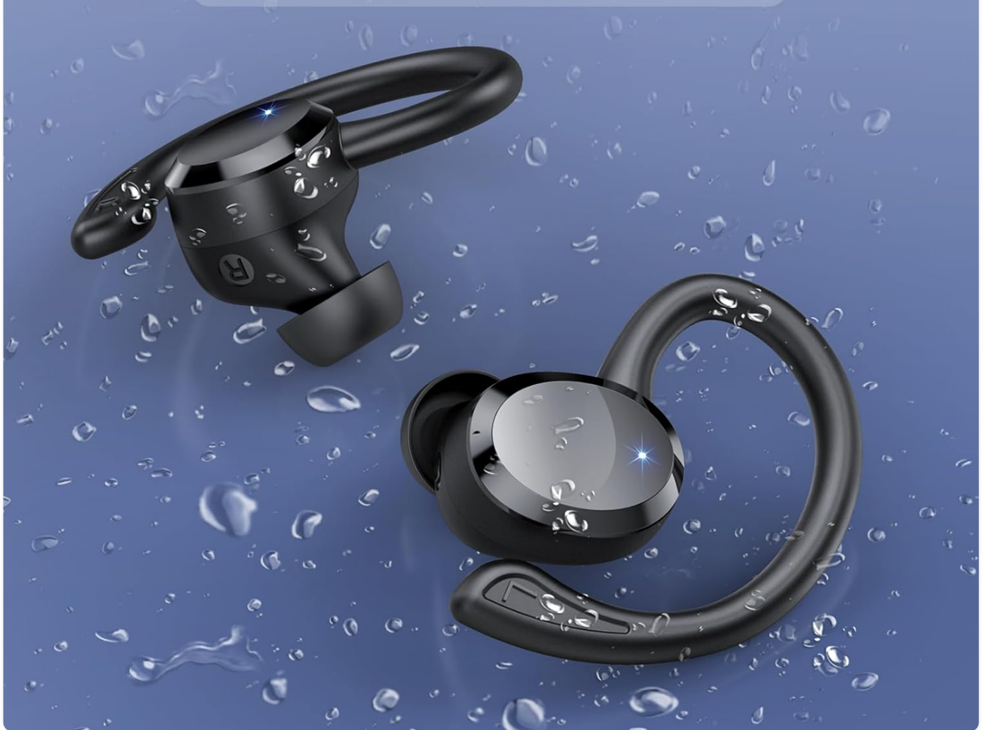
Image: The Wekily Q38 earbuds shown with water droplets, illustrating their IP7 waterproof, sweatproof, and rainproof capabilities, suitable for use during exercise and in various weather conditions.