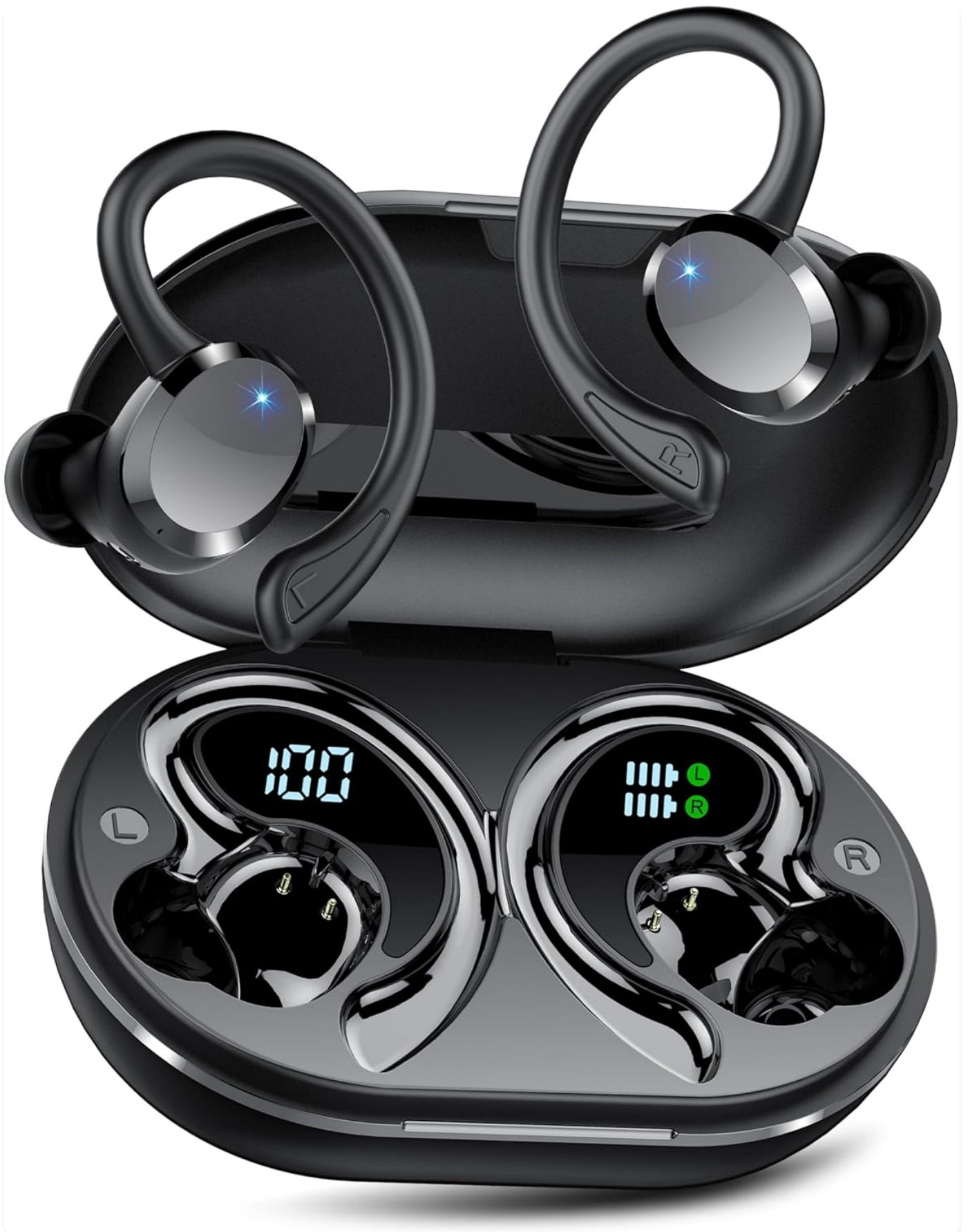
Image: The Wekily Q38 Sport Bluetooth Headphones shown inside their charging case, illustrating the compact design and the digital battery display on the case.