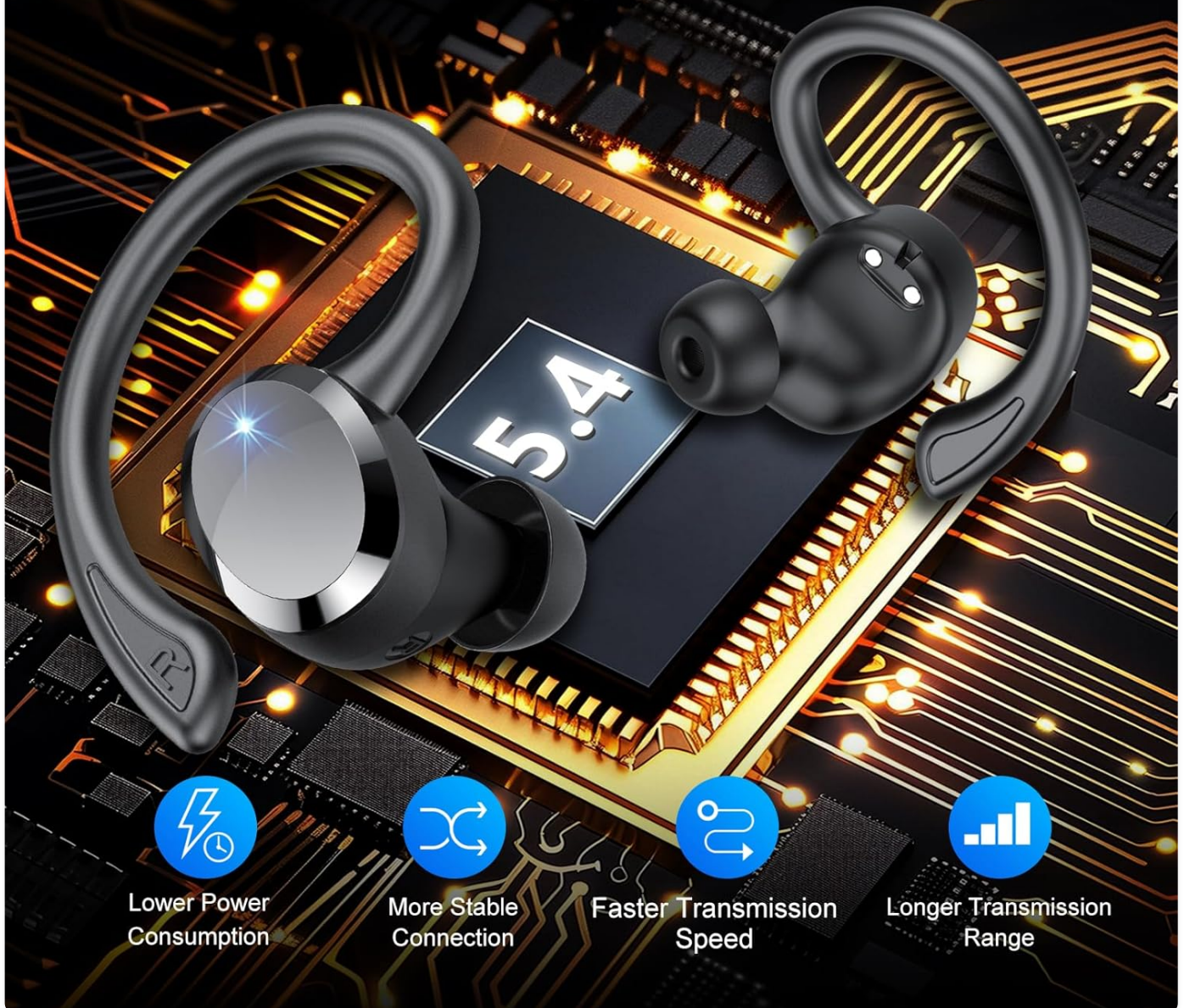
Image: A close-up of the Wekily Q38 earbuds with a background illustrating the Bluetooth 5.4 chip, emphasizing lower power consumption, more stable connection, faster transmission speed, and longer transmission range.

The connection is more stable, and the calls and music are clearer