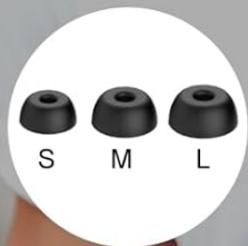
3 Sizes Eartips