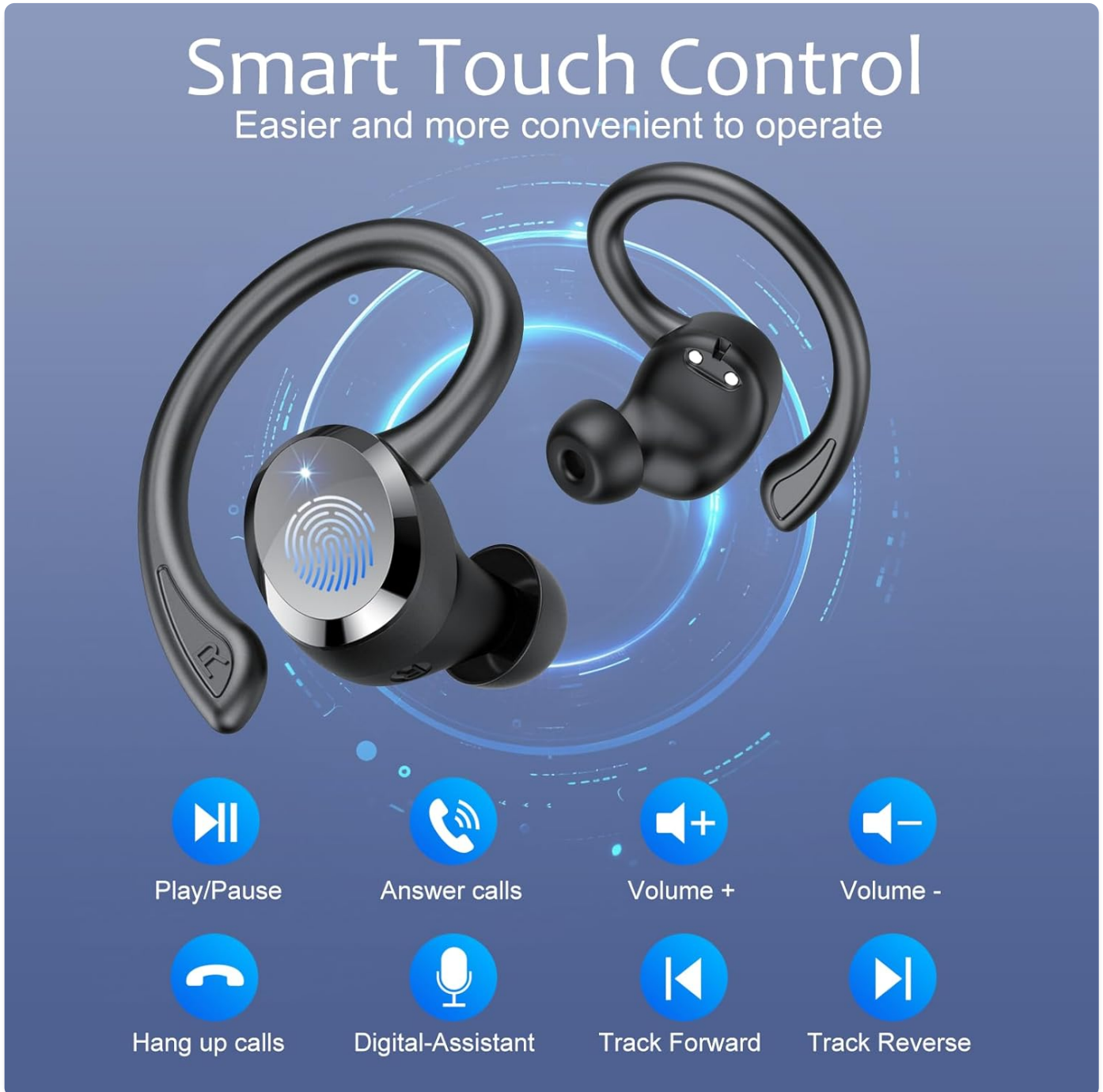
Image: A visual guide to the smart touch controls, showing icons for Play/Pause, Answer Calls, Volume +, Volume -, Hang Up Calls, Digital Assistant, Track Forward, and Track Reverse, indicating their respective tap actions.