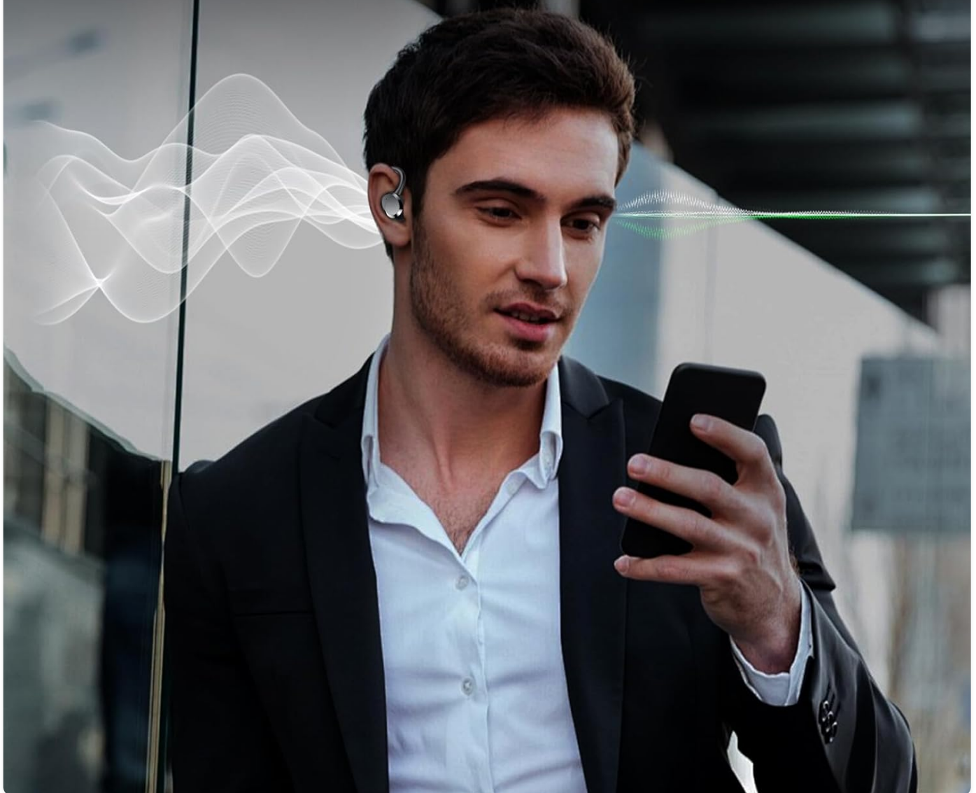
Image: A person wearing the earbuds while looking at a smartphone, with sound waves illustrating the ENC Noise Reduction technology, indicating its ability to filter external noise for a better listening experience.

Listen to the sound in the midst of external noise