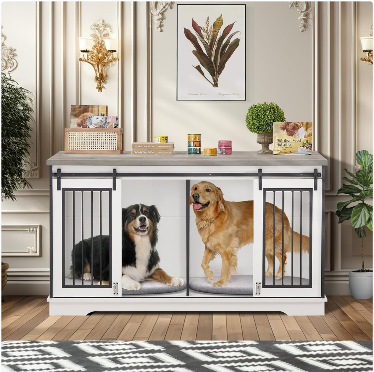
The Yaflyly 60.6 Inch Double Dog Crate TV Stand, shown with two dogs comfortably housed inside.