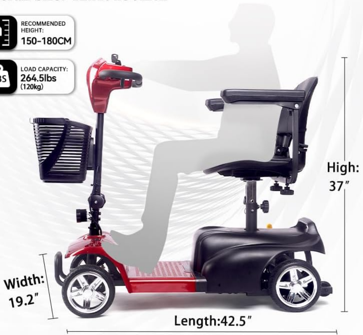
Figure 6: A detailed specification diagram illustrating the overall dimensions (length, width, height), recommended user height, and load capacity of the TOXOZERS Mobility Scooter.