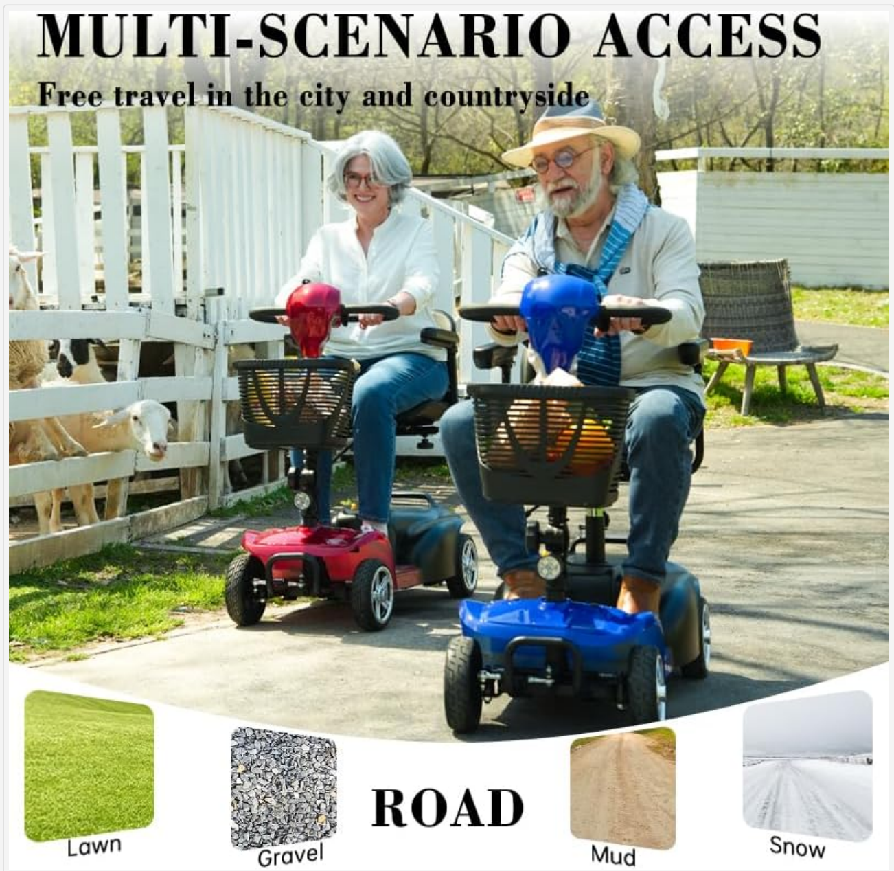
Figure 4: This image illustrates the TOXOZERS Mobility Scooter's capability to navigate various terrains, including lawn, gravel, mud, and snow, highlighting its versatility for different environments.