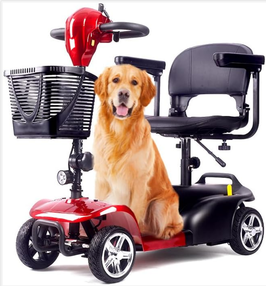
Figure 1: Front view of the TOXOZERS Mobility Scooter, highlighting the front basket, tiller, and seat. This image shows the overall design of the scooter.

Familiarize yourself with the main components of your mobility scooter.