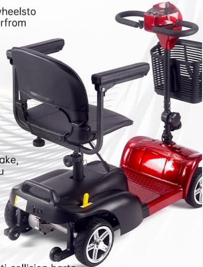
Figure 2: Illustration detailing the safety features, including rear anti-tilt wheels, electromagnetic brake system, and front anti-collision bar. These features enhance user safety during operation.

Front anti-collision bar to reduce the impact of impact