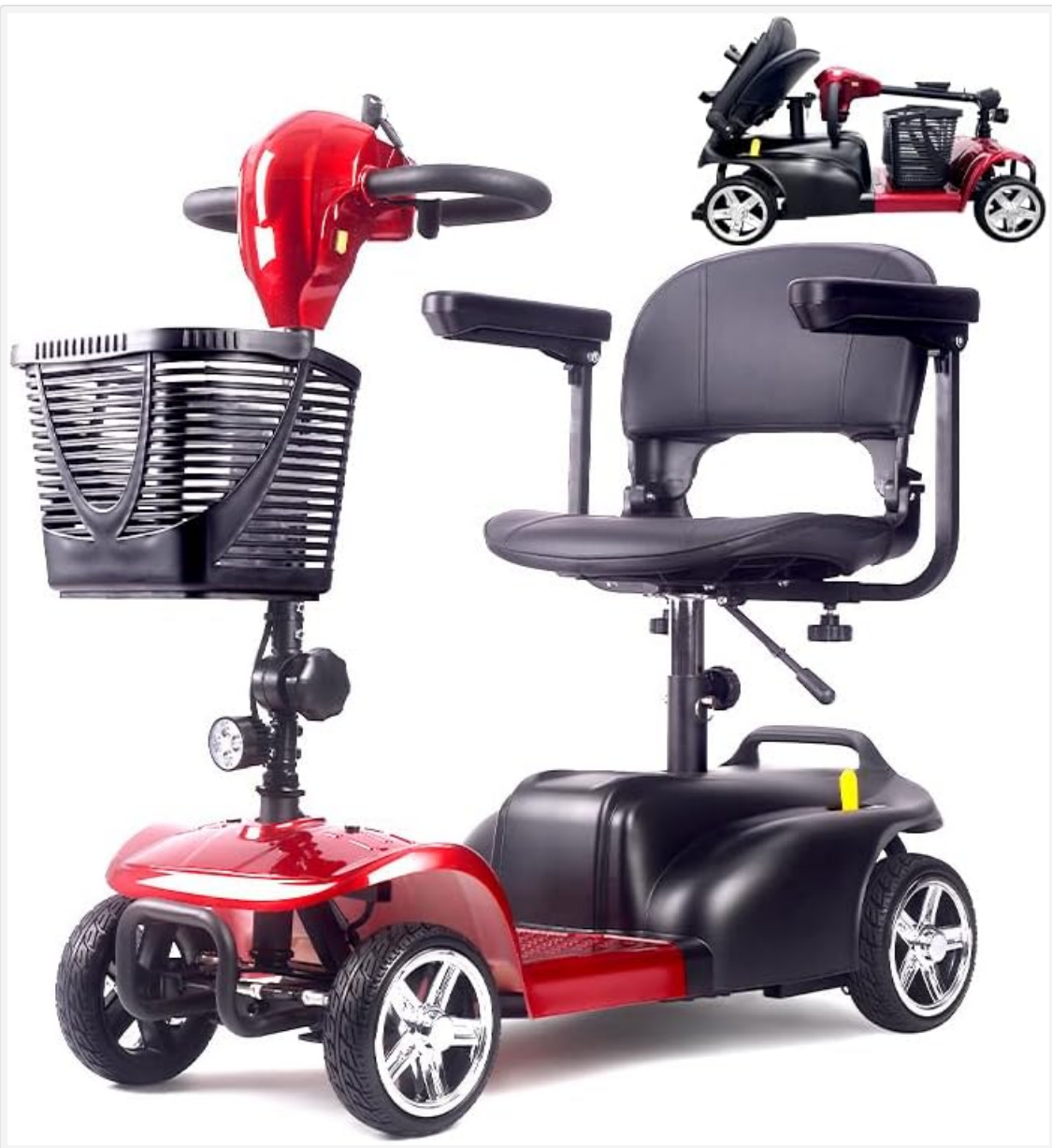
Figure 3: The TOXOZERS Mobility Scooter in its operational state, with a visual reference of the scooter in a folded configuration in the background. This illustrates the compact nature when folded.