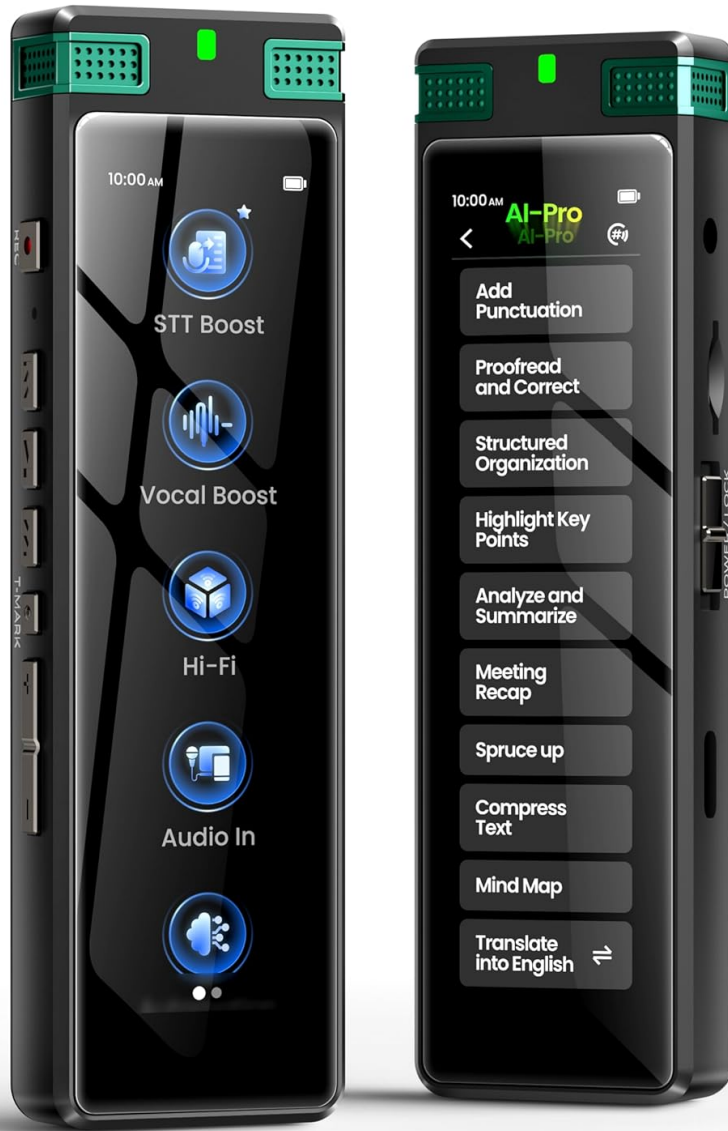
Figure 2.1: TIMMKOO SR1 Device Interface

The image displays two views of the TIMMKOO SR1 AI Voice Recorder. The left view shows the device's screen with options for various recording modes: STT Boost, Vocal Boost, Hi-Fi, and Audio In. The left side of the device features physical buttons, including a 'REC' button and a 'T-MARK' button. The right view shows the device's screen displaying the 'AI-Pro' menu, which includes options such as Add Punctuation, Proofread and Correct, Structured Organization, Highlight Key Points, Analyze and Summarize, Meeting Recap, Spruce up, Compress Text, Mind Map, and Translate into English. The right side of the device has a 'POWER/LOCK' slider switch.