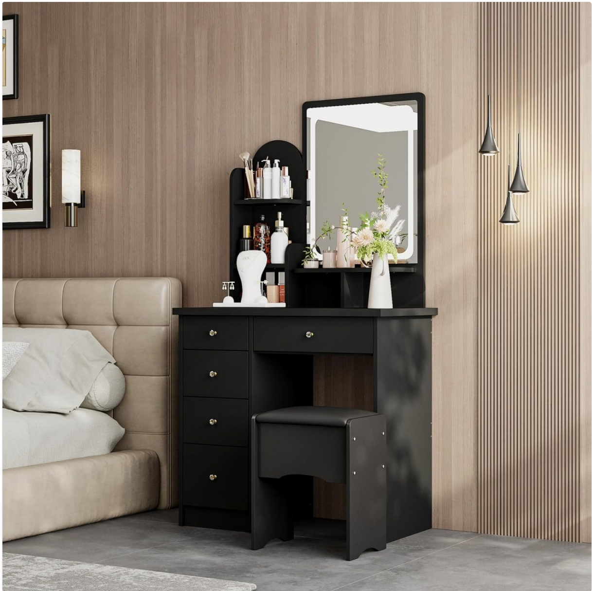
Figure 2: Another view of the FUFU&GAGA Black Vanity Set, showcasing its compact design.