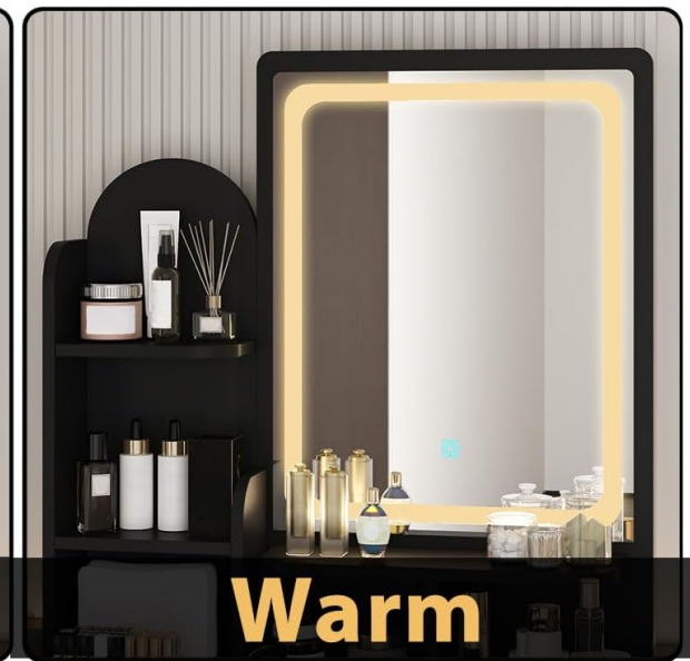
Figure 5: The lighted mirror offers three distinct color temperatures: Cool, Natural, and Warm, for optimal illumination.