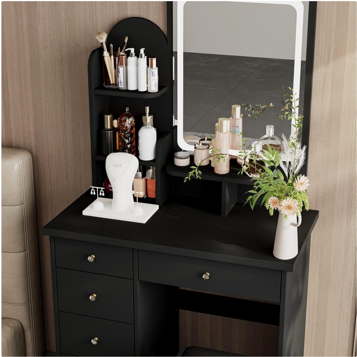
Figure 6: The vanity desktop features integrated shelves for organizing skincare and beauty products.