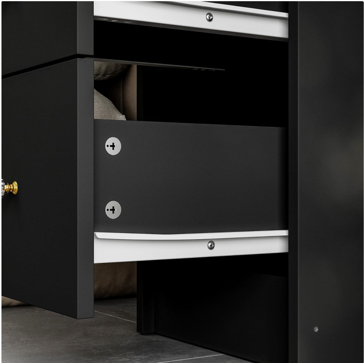
Figure 7: An open drawer demonstrating the internal storage capacity for various items.