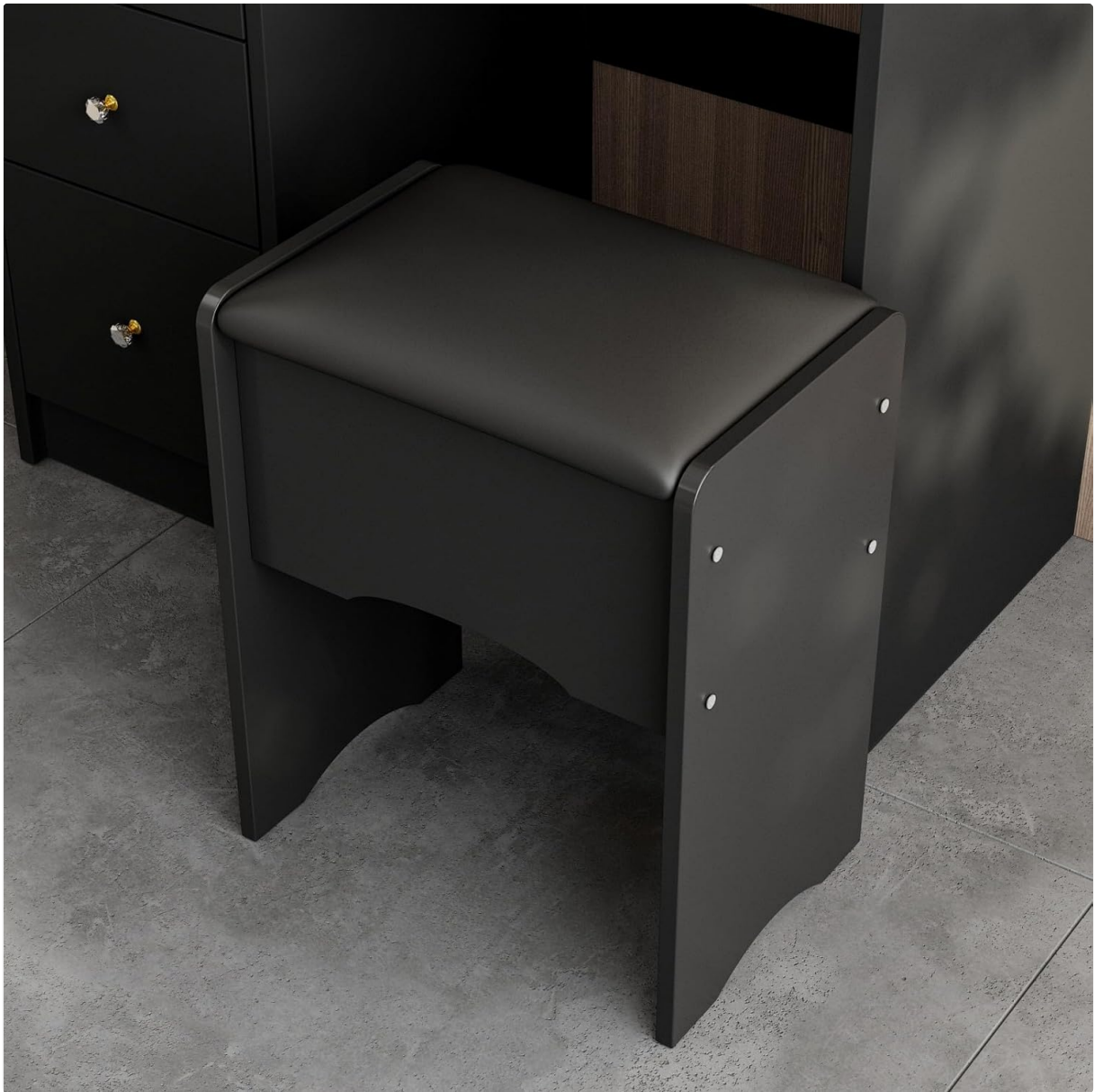
Figure 4: The cushioned stool included with the vanity set.