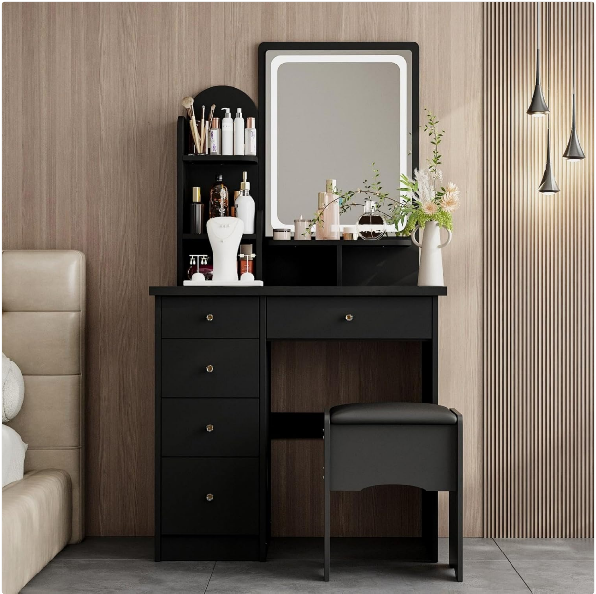
Figure 1: Complete FUFU&GAGA Black Vanity Set with Lighted Mirror and Stool.