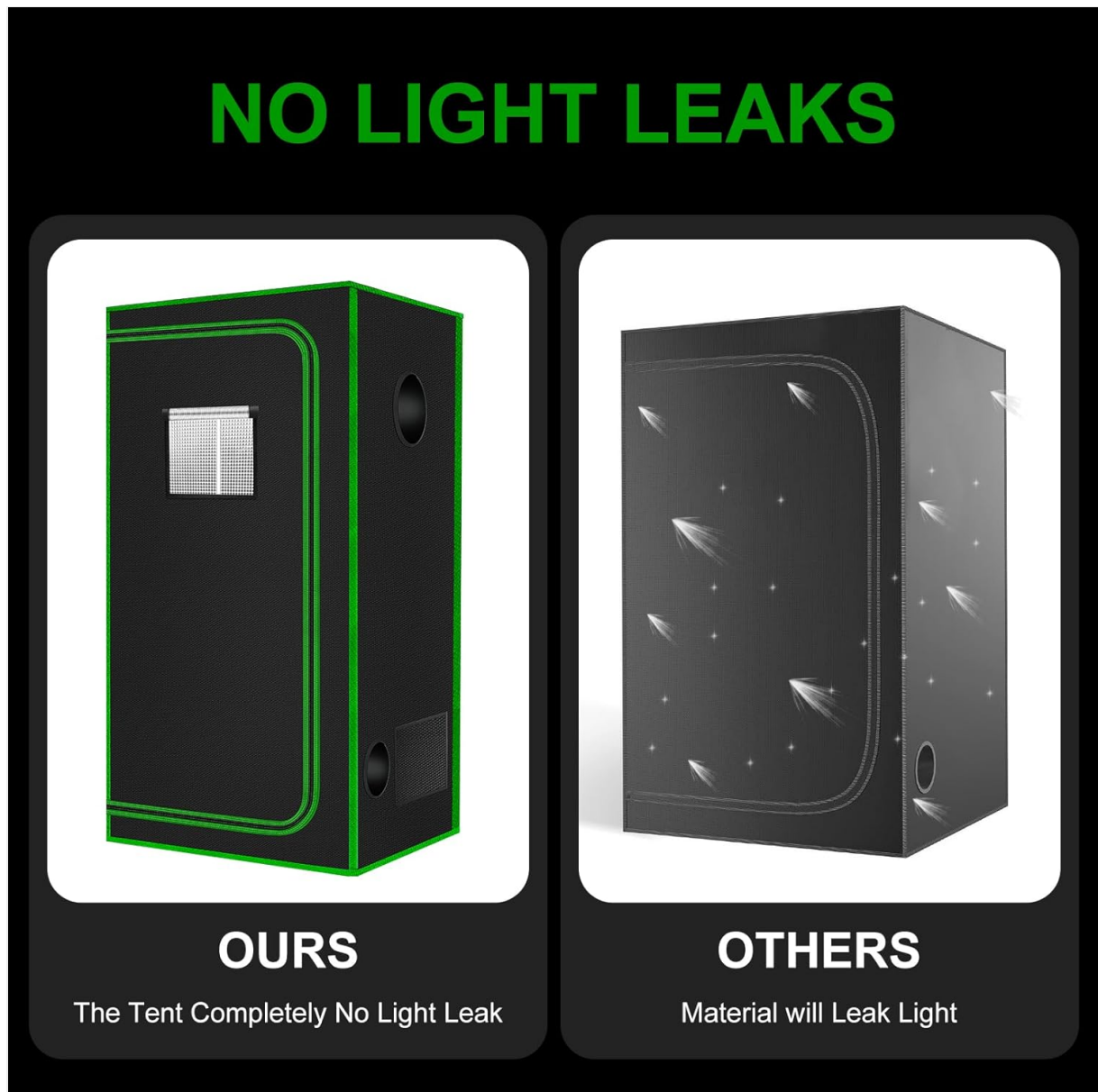
Image: Visual comparison highlighting the superior light-proofing of the MELONFARM grow tent compared to other tents