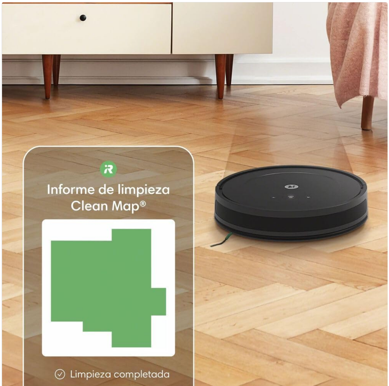
Figure 3: The iRobot Roomba Combo 2 Essential Robot actively cleaning a wooden floor, demonstrating its operational capability.