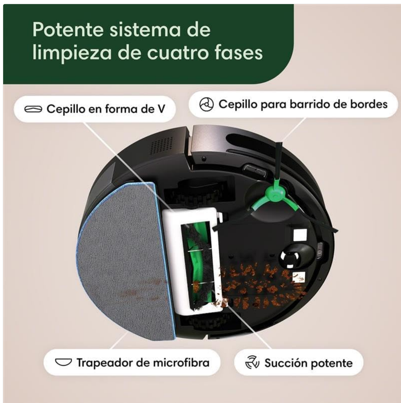
Figure 4: The underside of the iRobot Roomba Combo 2 Essential Robot, illustrating the main brushes, side brush, and the attachment point for the mop pad.