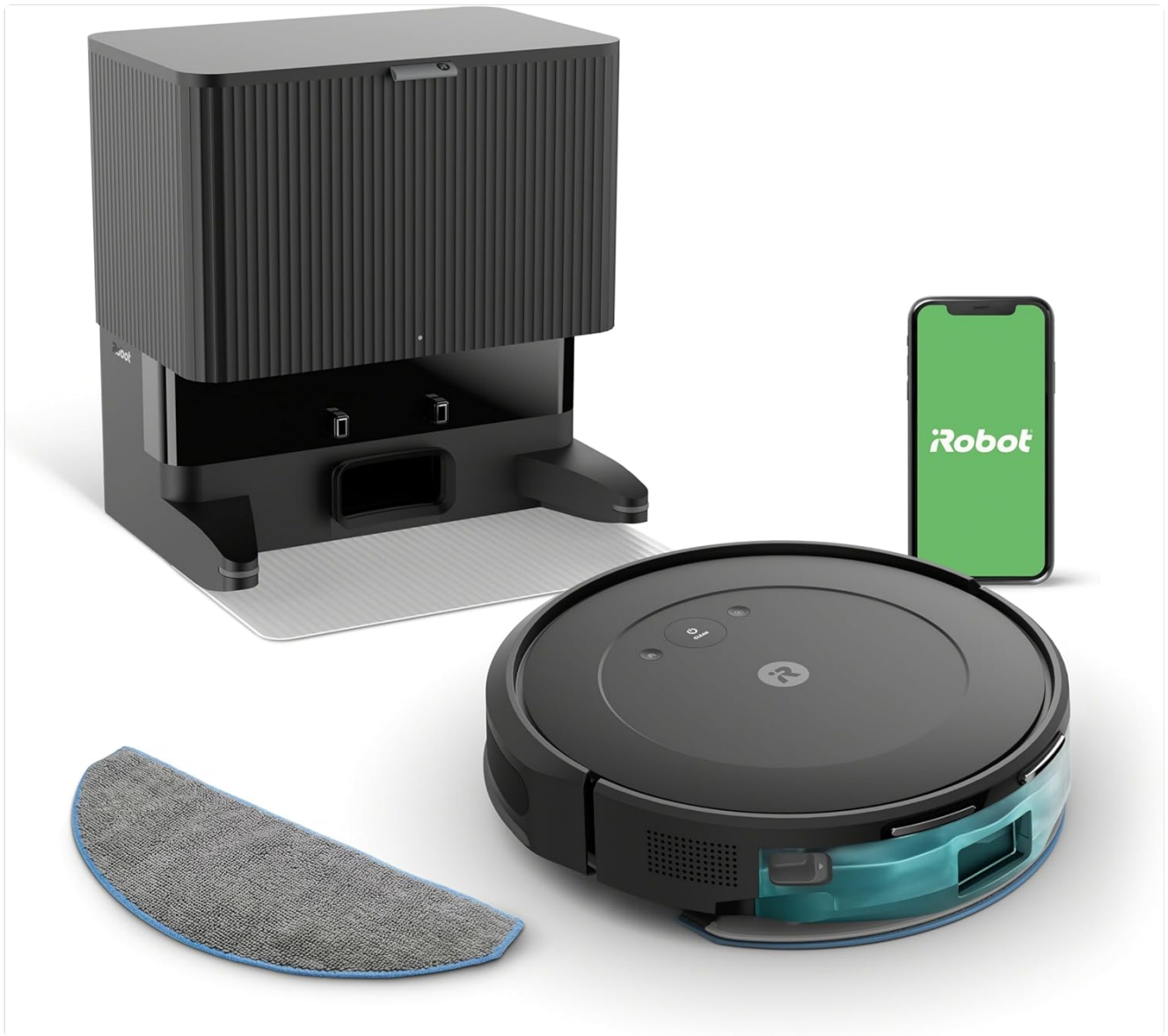
Figure 1: Main components of the iRobot Roomba Combo 2 Essential Robot system, including the robot, the auto-empty base, and a mop pad.