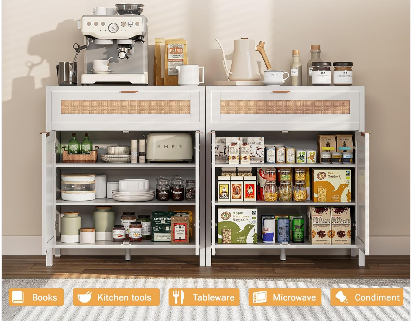
Image: The cabinet shown with its doors open, displaying the internal storage compartments and the adjustable shelves, filled with various kitchenware and pantry items.

Keeps your space tidy and clean, you can place various items as you like, easy to organize and access