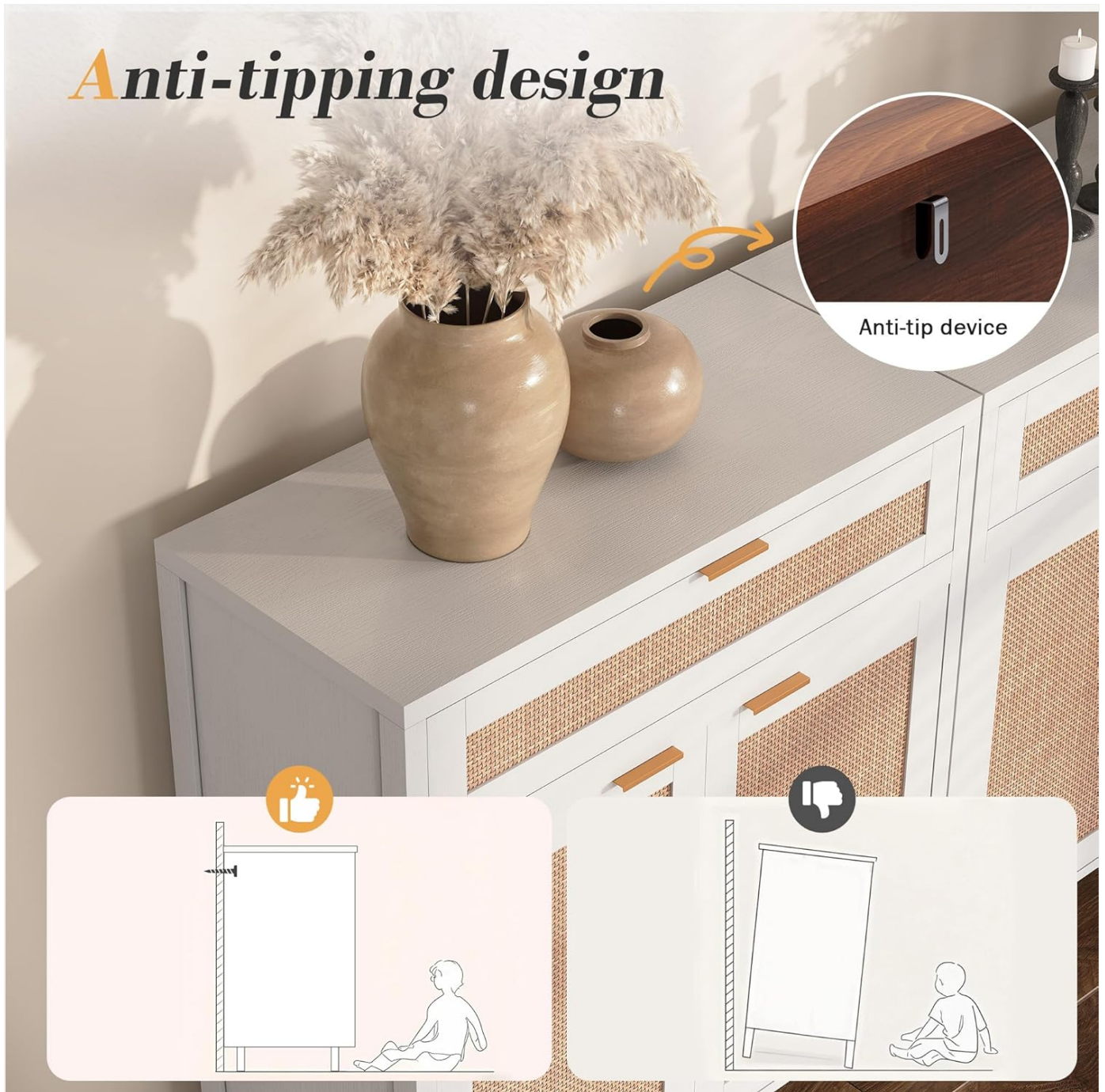
Image: Illustration of the anti-tipping design and its importance for safety. The image shows a diagram of the cabinet with an anti-tip device attached to the wall, demonstrating how it prevents tipping.