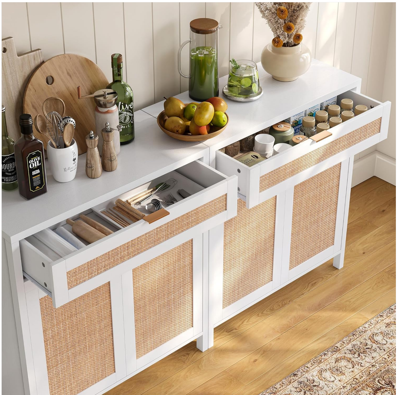
Image: The cabinet with its two top drawers pulled open, illustrating their capacity for storing utensils, spices, or other small household items.